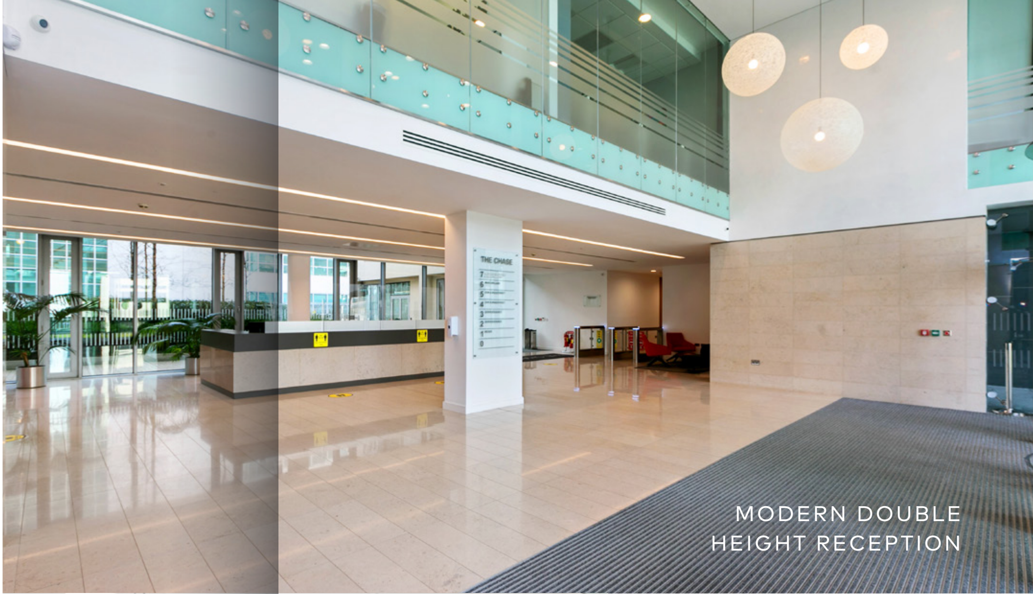
MODERN DOUBLE HEIGHT RECEPTION