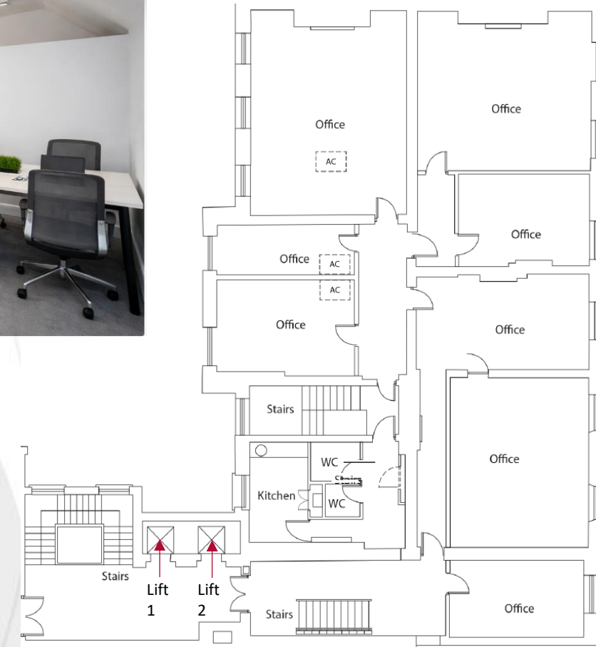
3 rd Floor Plan*