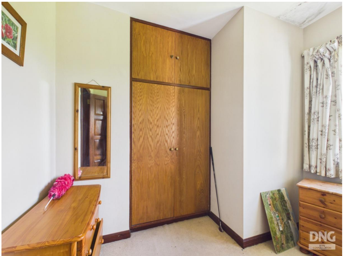
Residence on c. 1 Acre, Lung, Ballaghaderreen, Co. Roscommon. F45 VH57