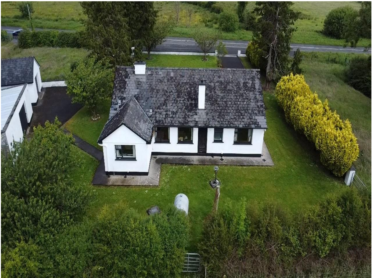
Residence on c. 1 Acre, Lung, Ballaghaderreen, Co. Roscommon. F45 VH57