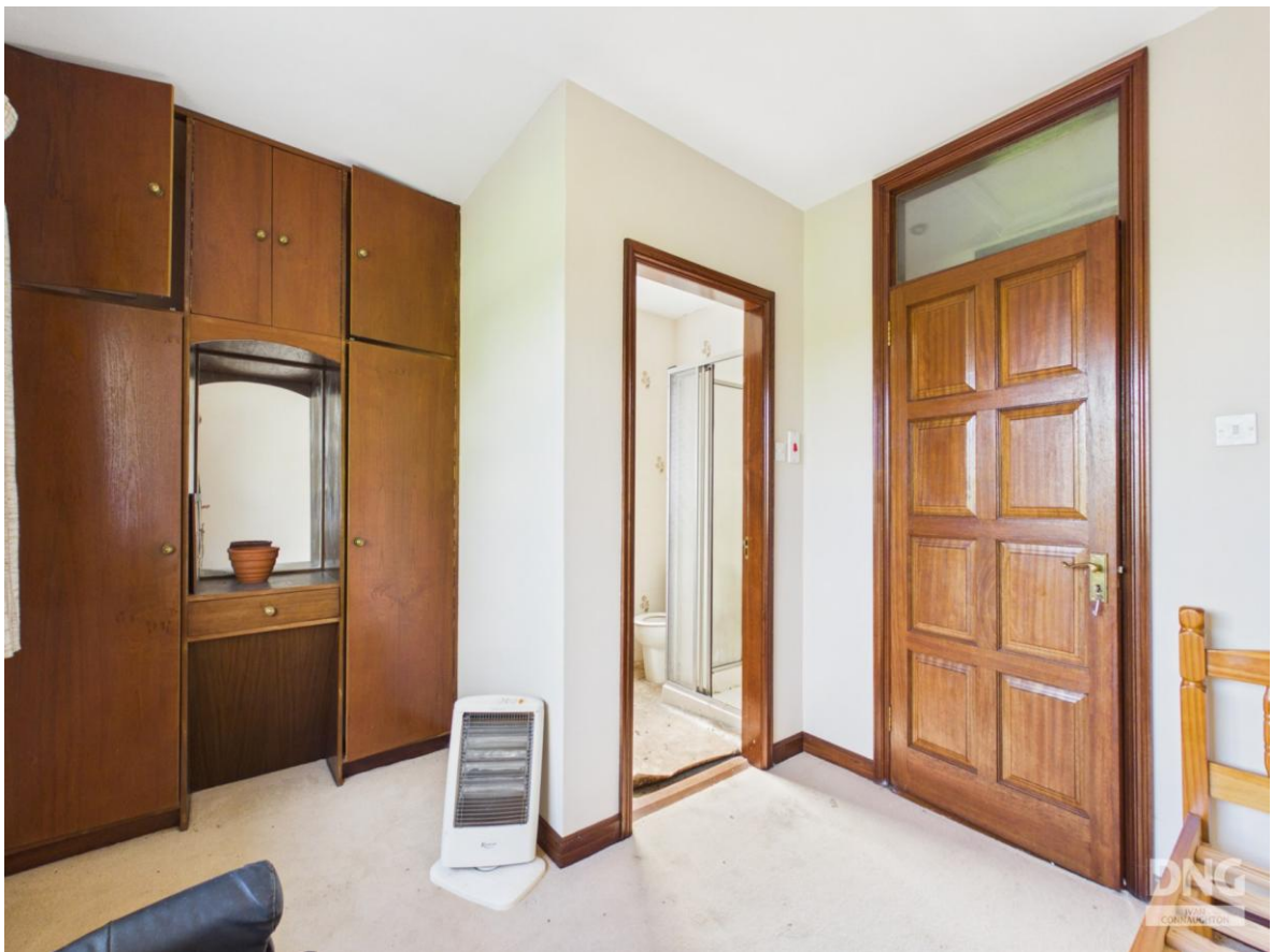
Residence on c. 1 Acre, Lung, Ballaghaderreen, Co. Roscommon. F45 VH57