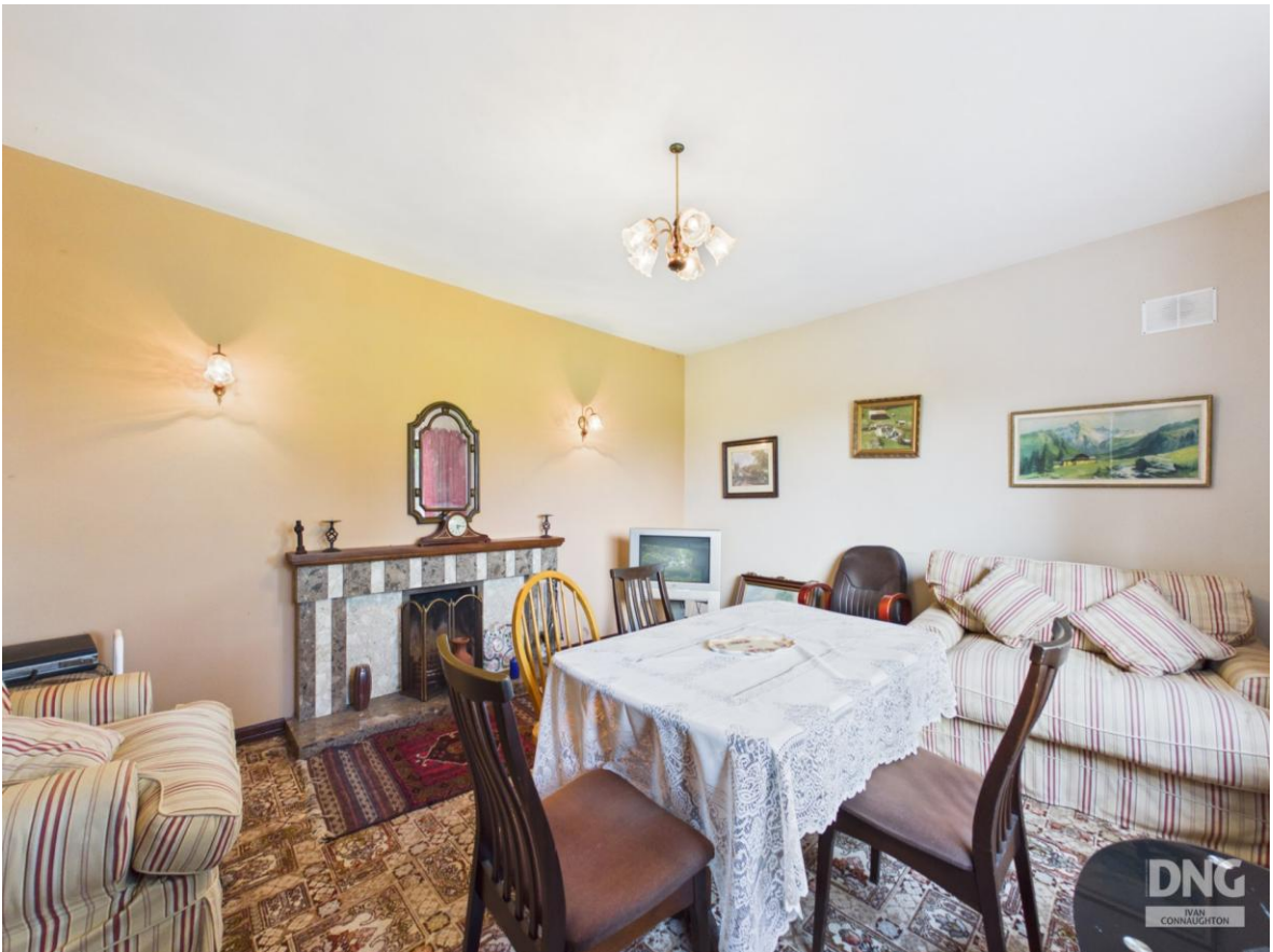
Residence on c. 1 Acre, Lung, Ballaghaderreen, Co. Roscommon. F45 VH57