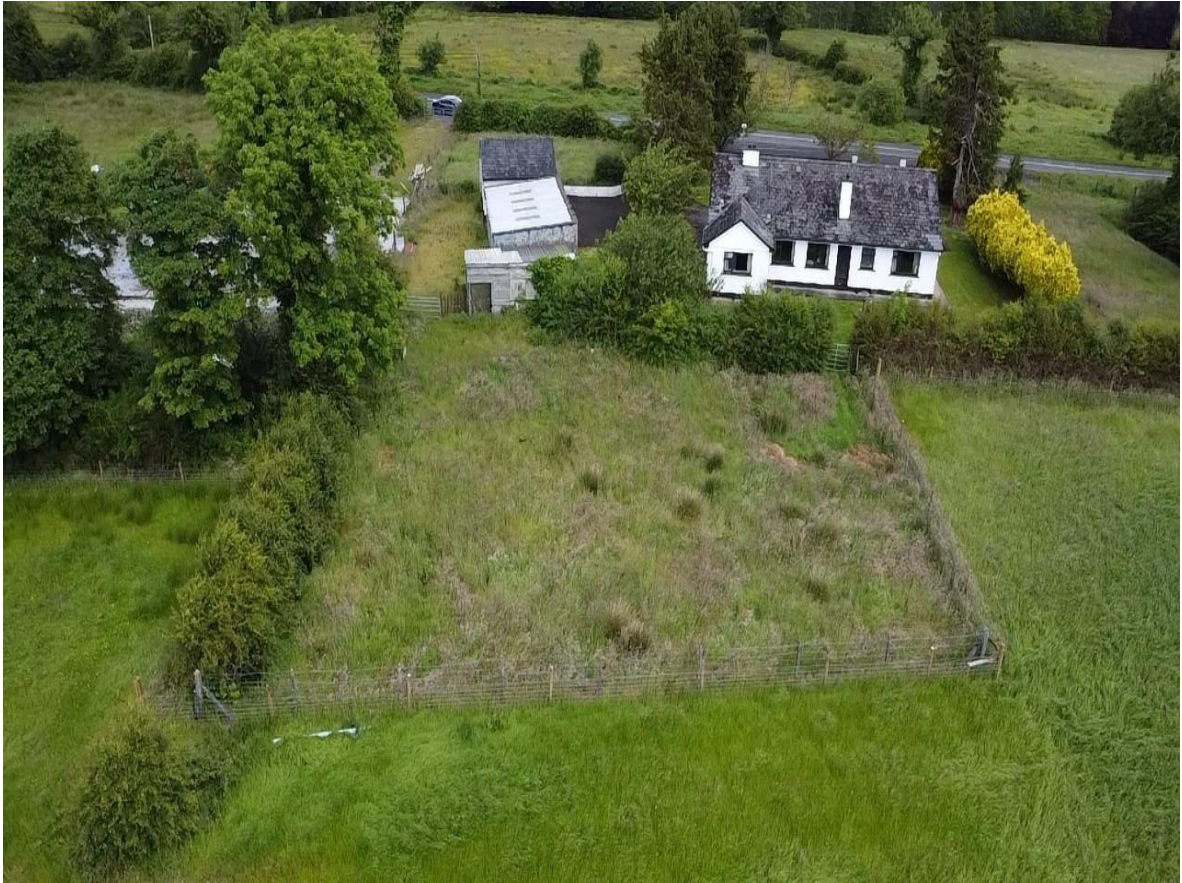
Residence on c. 1 Acre, Lung, Ballaghaderreen, Co. Roscommon. F45 VH57