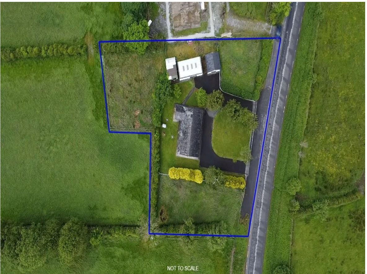
Residence on c. 1 Acre, Lung, Ballaghaderreen, Co. Roscommon. F45 VH57