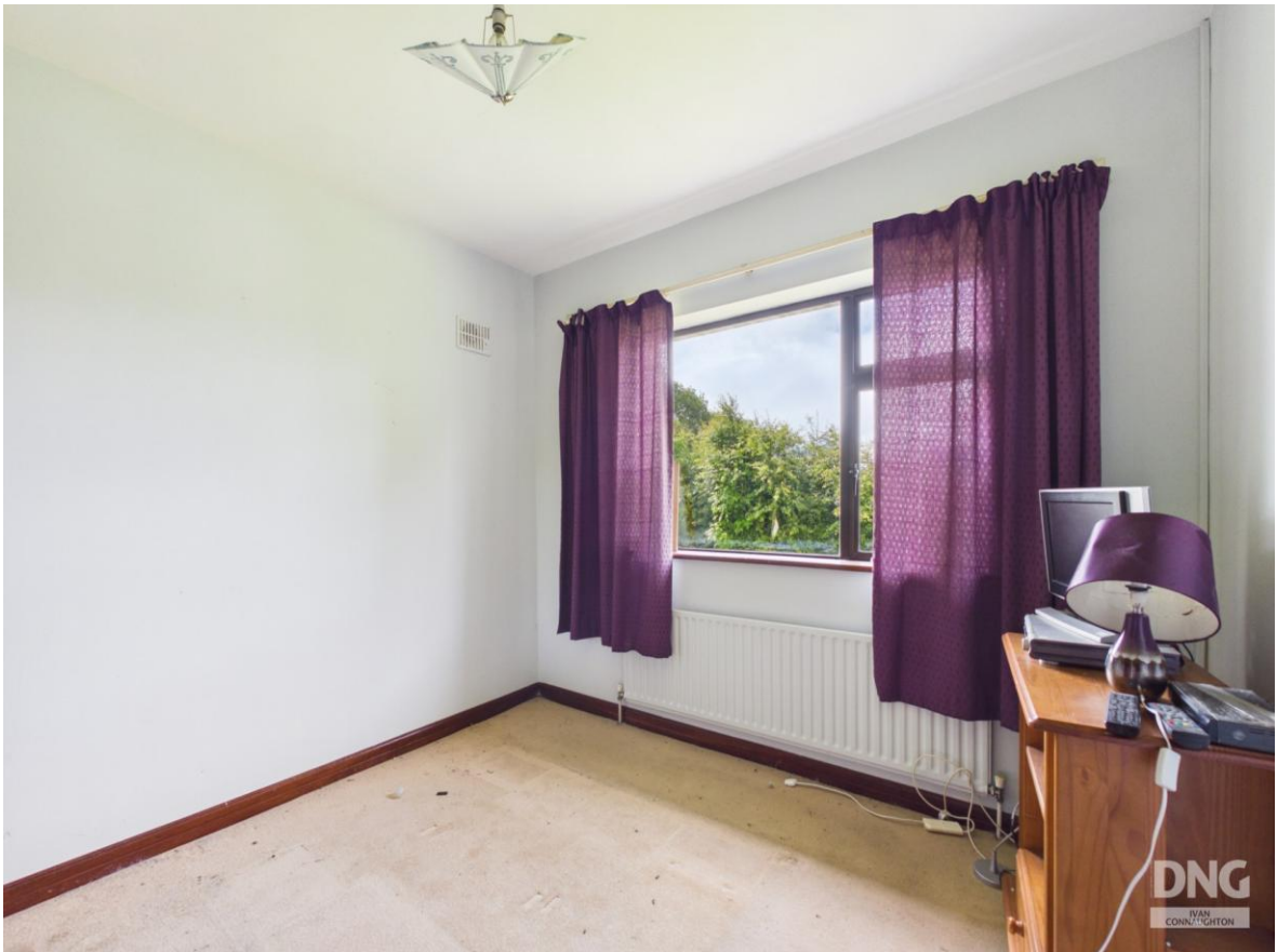
Residence on c. 1 Acre, Lung, Ballaghaderreen, Co. Roscommon. F45 VH57