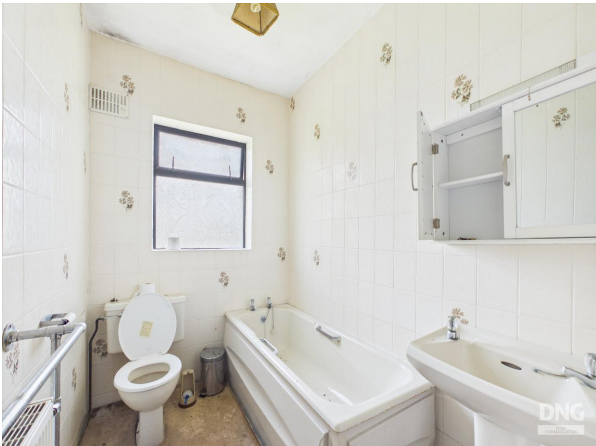
Residence on c. 1 Acre, Lung, Ballaghaderreen, Co. Roscommon. F45 VH57