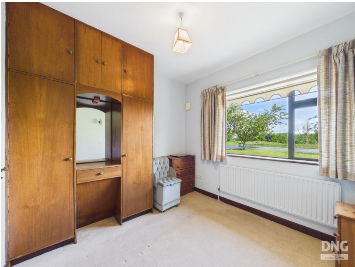
Residence on c. 1 Acre, Lung, Ballaghaderreen, Co. Roscommon. F45 VH57