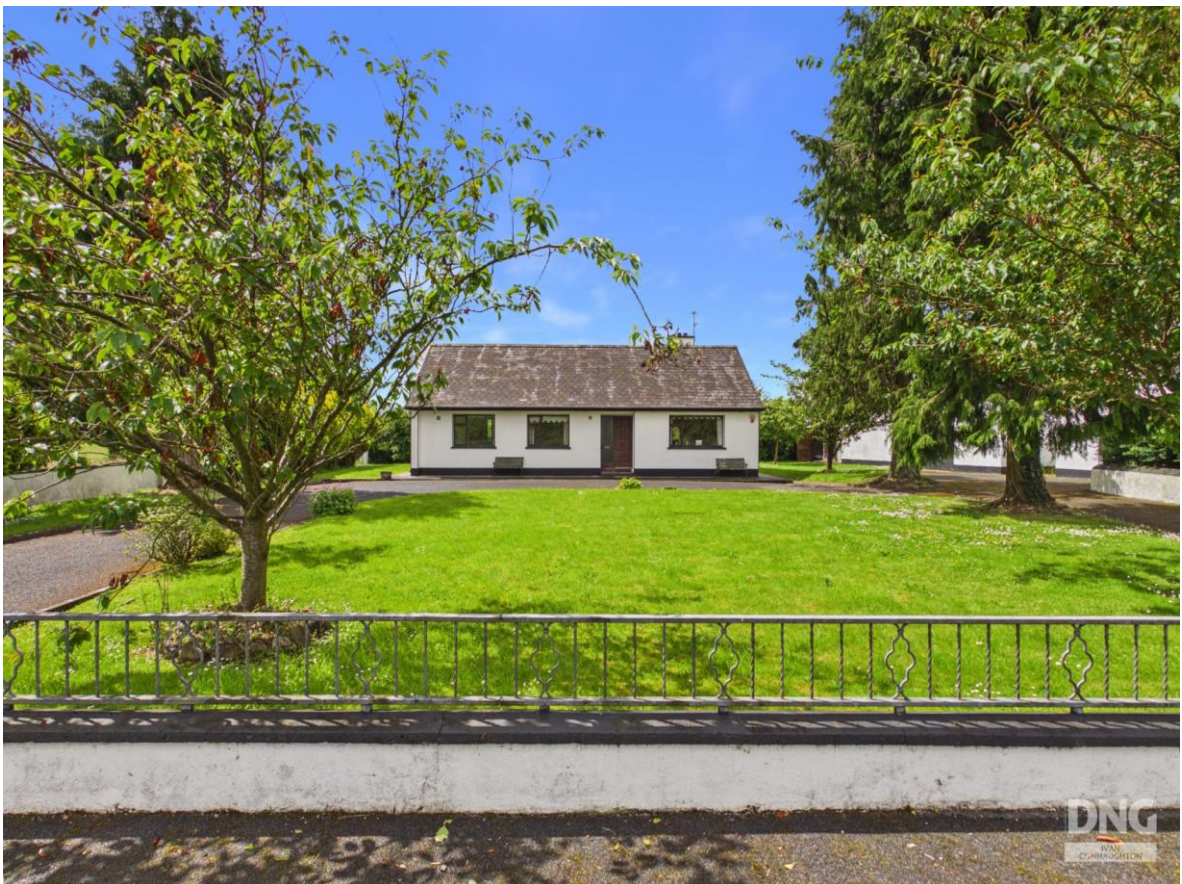
Residence on c. 1 Acre, Lung, Ballaghaderreen, Co. Roscommon. F45 VH57