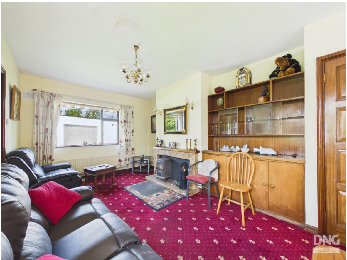
Residence on c. 1 Acre, Lung, Ballaghaderreen, Co. Roscommon. F45 VH57