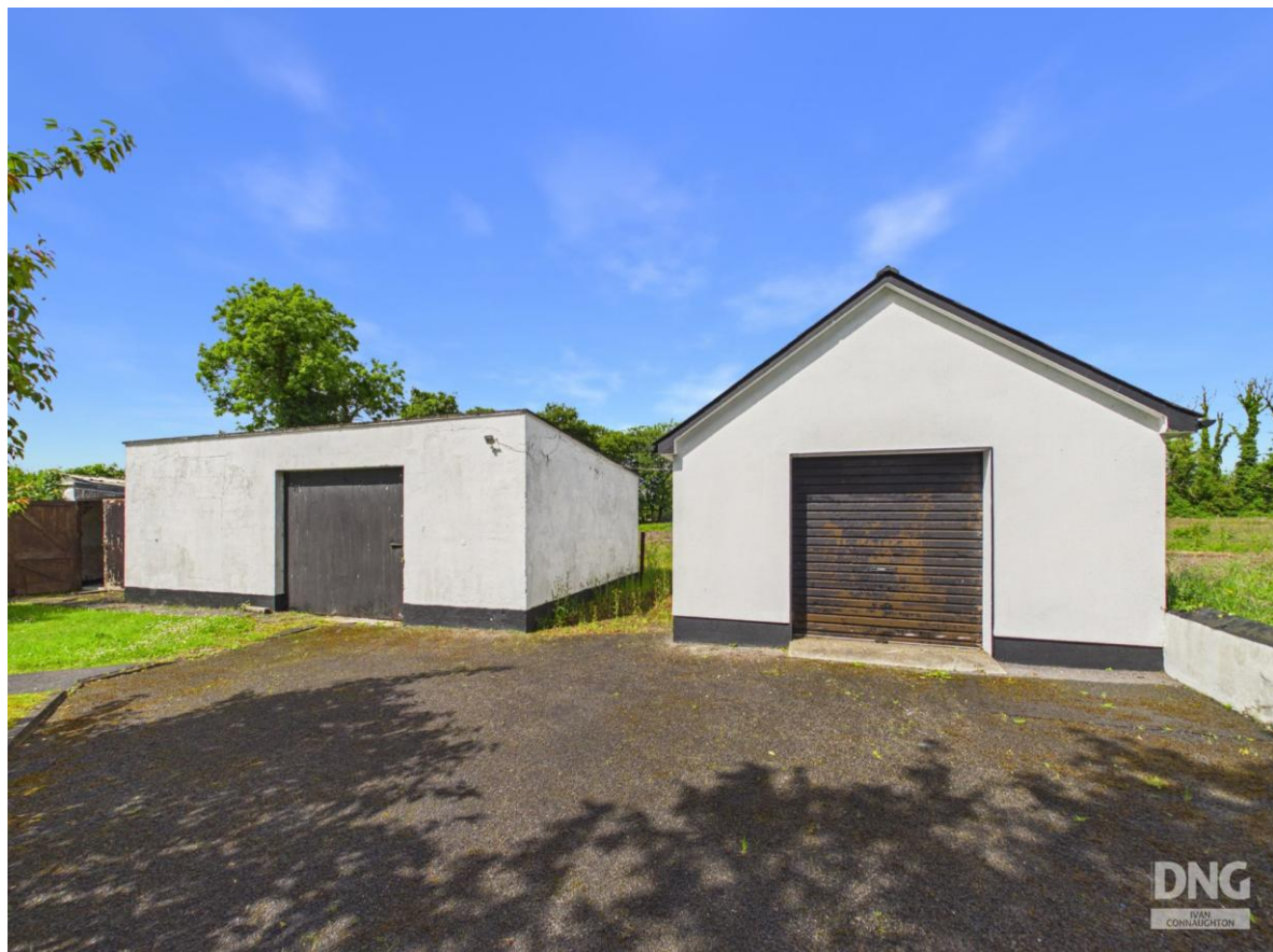
Residence on c. 1 Acre, Lung, Ballaghaderreen, Co. Roscommon. F45 VH57