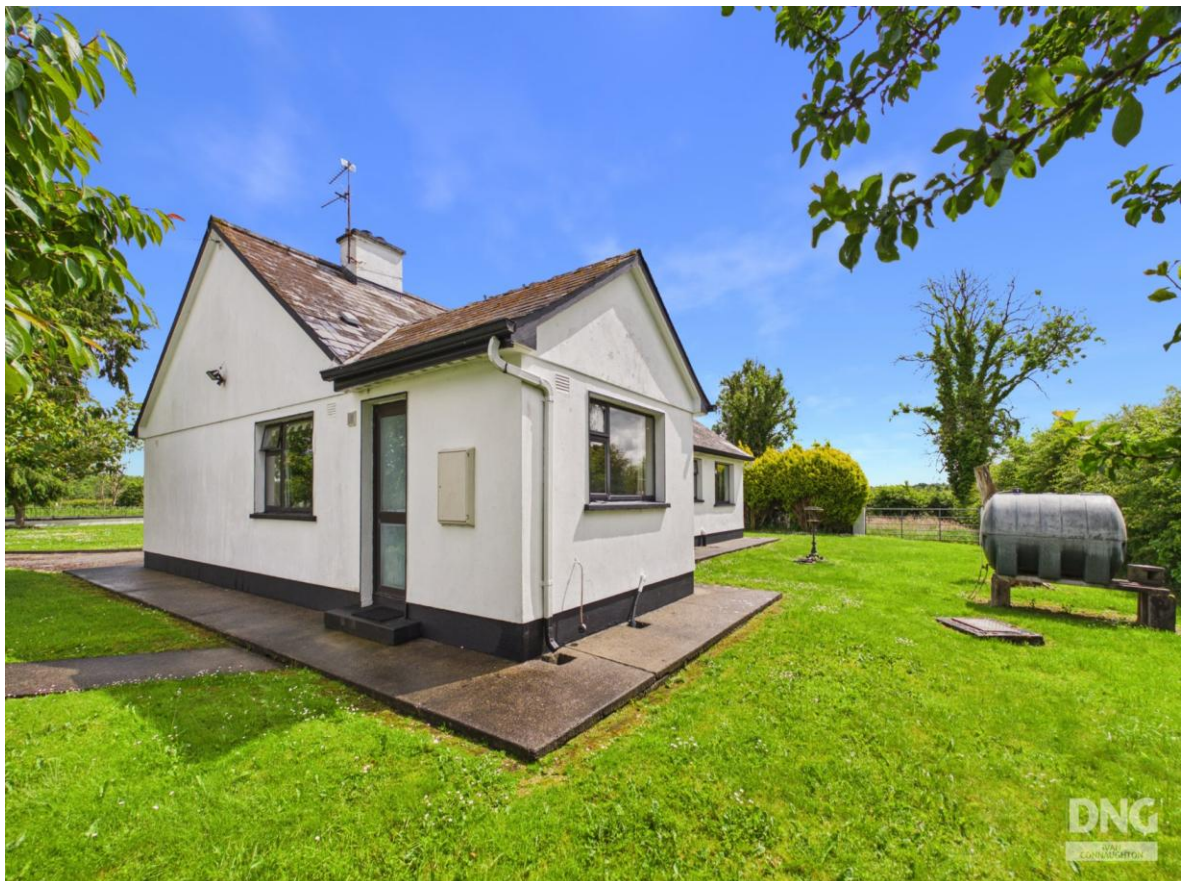
Residence on c. 1 Acre, Lung, Ballaghaderreen, Co. Roscommon. F45 VH57