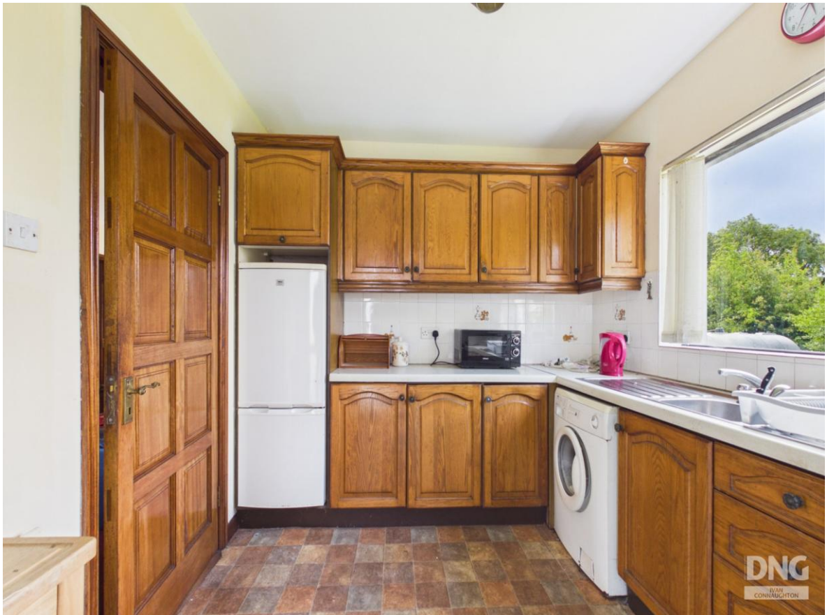
Residence on c. 1 Acre, Lung, Ballaghaderreen, Co. Roscommon. F45 VH57