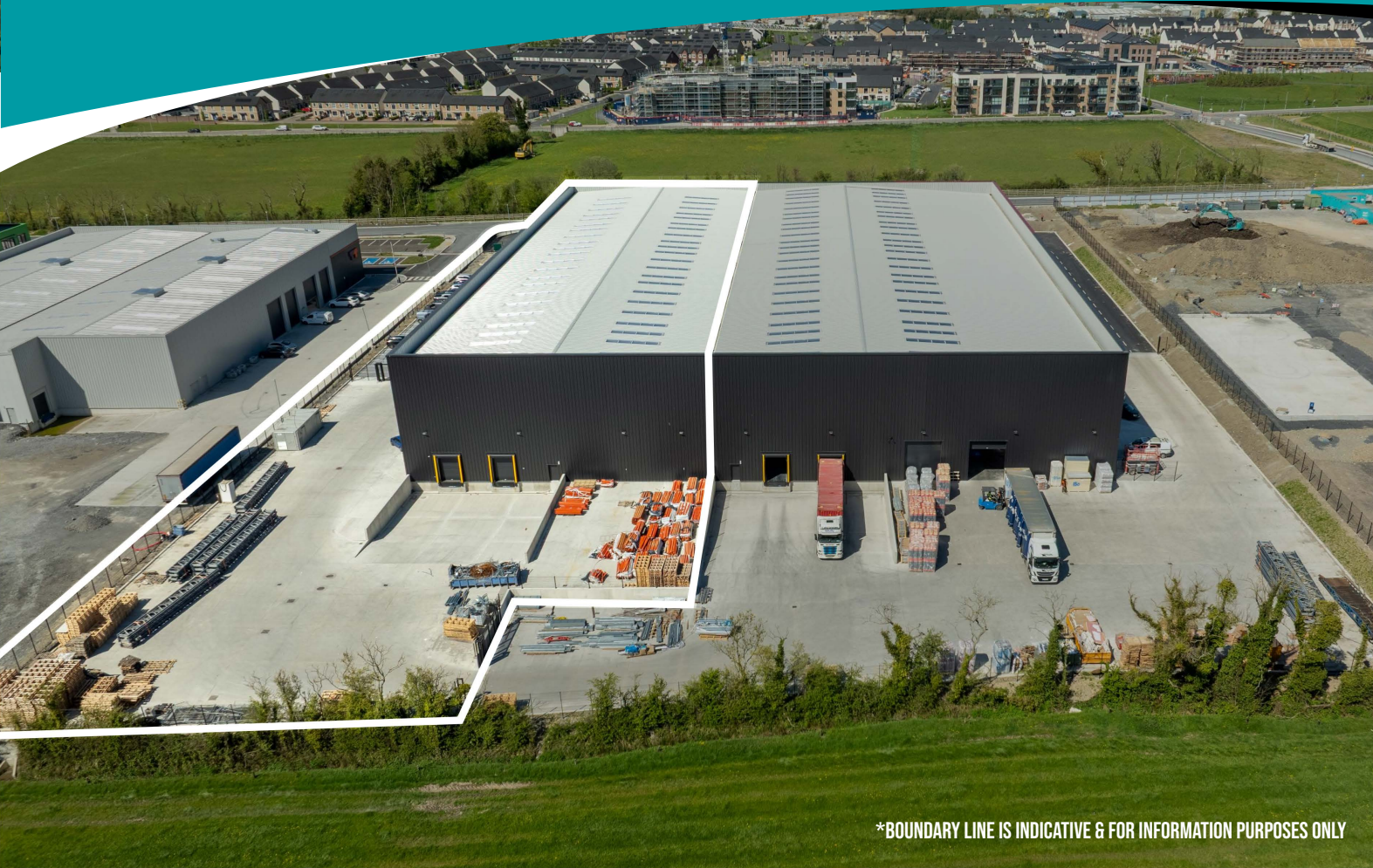
*BOUNDARY LINE IS INDICATIVE & FOR INFORMATION PURPOSES ONLY