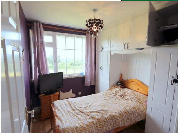
Bedroom No 3

With laminated wooden floor and built in wardrobe 19'0" (5.79m) x 12'6" (3.81m)