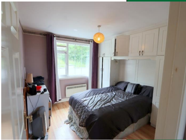
Bedroom No 2

With laminated wooden floor and built in wardrobe 19'0" (5.79m) x 12'6" (3.81m)