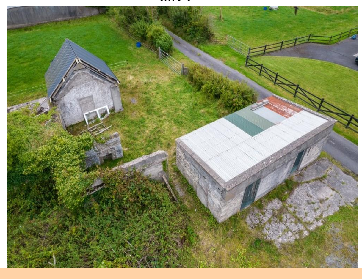
Derelict Cottage On c. 10.40 Acres, Cloonlara South, Glenamaddy, Co. Galway