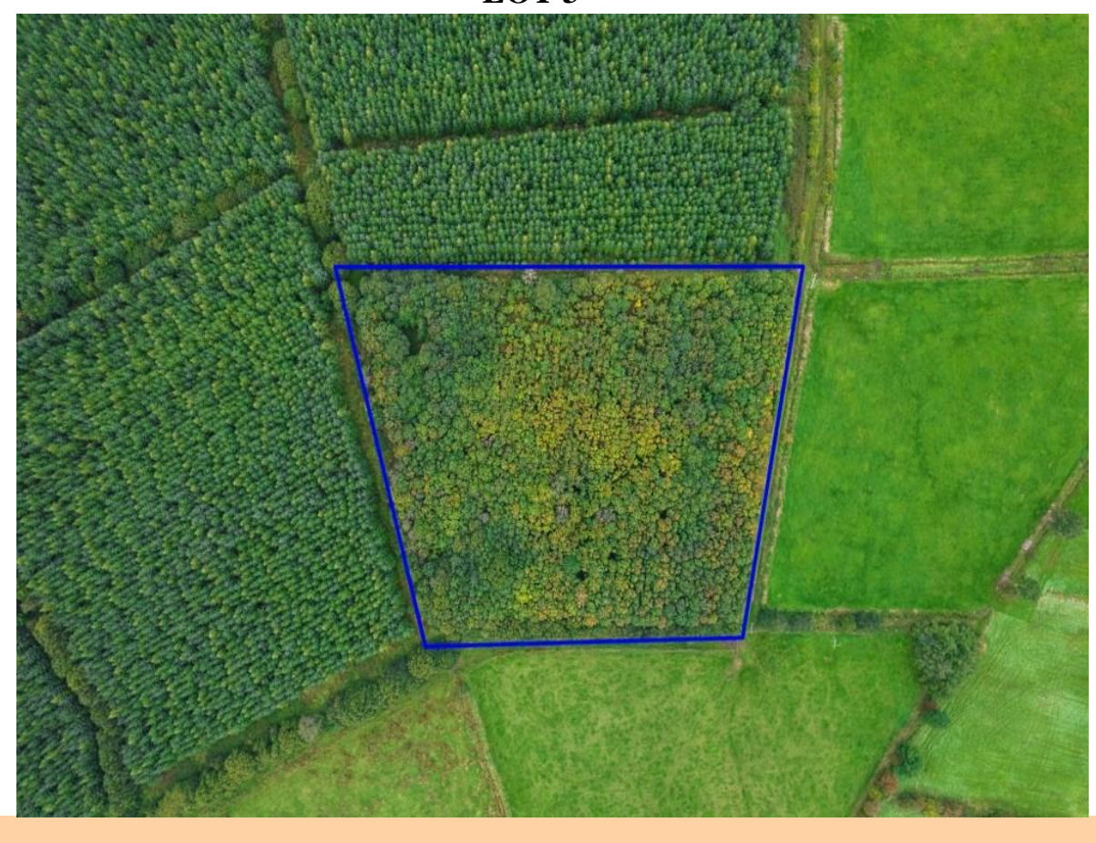
Derelict Cottage On c. 10.40 Acres, Cloonlara South, Glenamaddy, Co. Galway