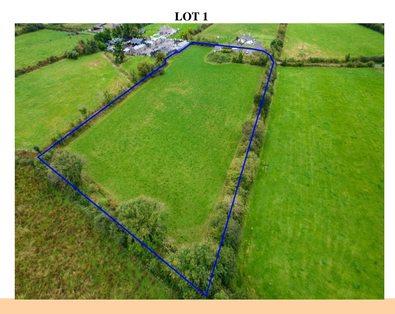
Derelict Cottage On c. 10.40 Acres, Cloonlara South, Glenamaddy, Co. Galway