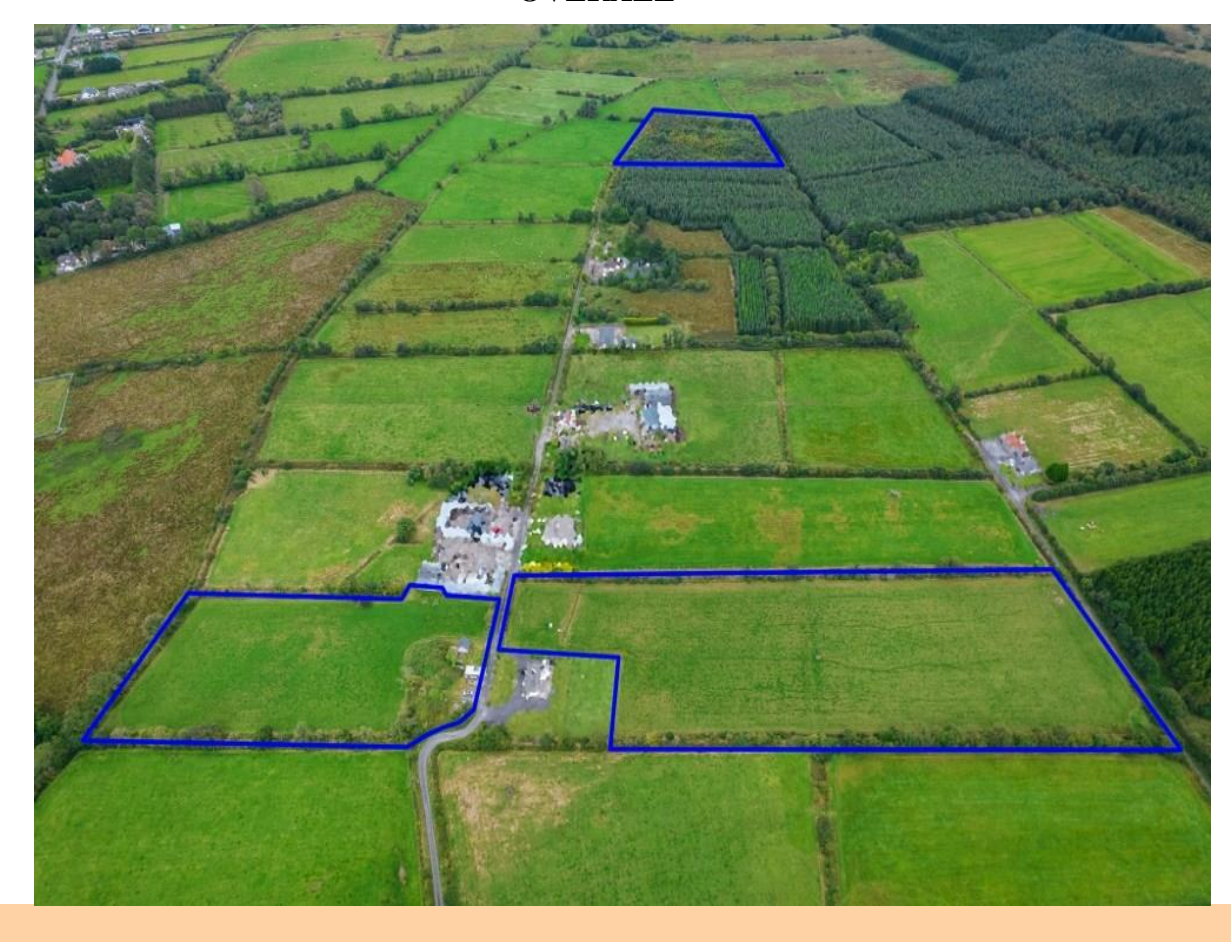
Derelict Cottage On c. 10.40 Acres, Cloonlara South, Glenamaddy, Co. Galway