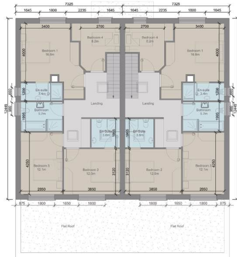
Proposed; First Floor Plan Ground Floor Area: 80m 2 /861sqft