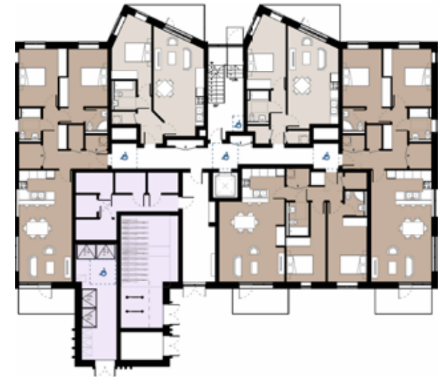
FIRST FLOOR BLOCK A LAYOUT