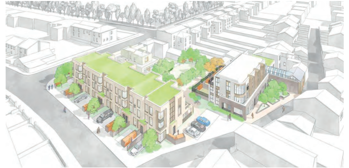
Planning application CGI / Illustrative purposes only. CGI by Corgan Architects.