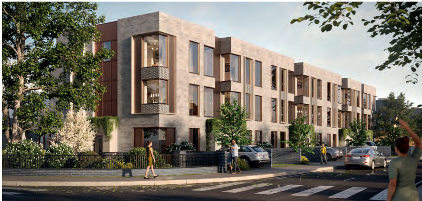
Planning application CGI / Illustrative purposes only. CGI by Corgan Architects.

A full planning pack is available to download via the property dataroom: www.rathgar-avenue.com