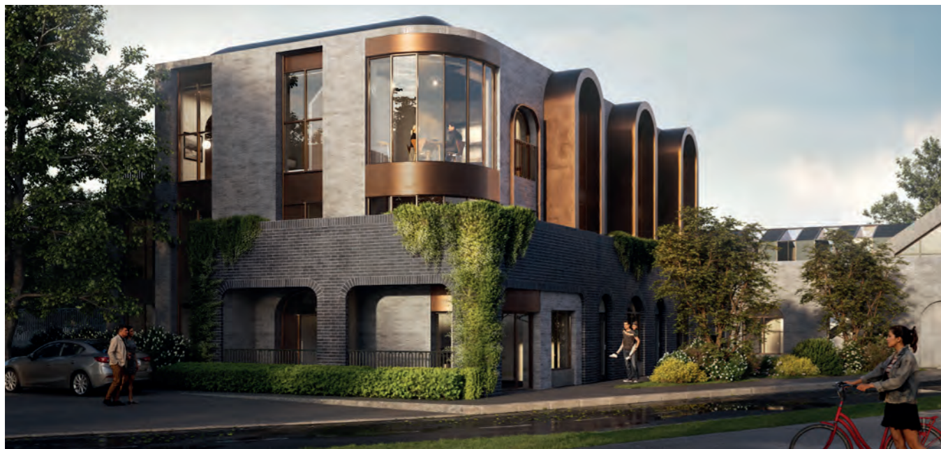
Planning application CGI / Illustrative purposes only. CGI by Corgan Architects.