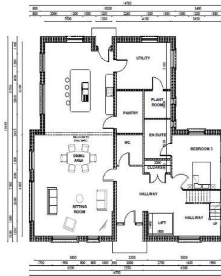
PROPOSED GROUND FLOOR PLAN 1:100 PROPOSED GROUND FLOOR AREA 147.40 SQ METRES (1586 SQ FEET) TOTAL FLOOR AREA 299.20 SQ METRES (3219 SQ FEET)