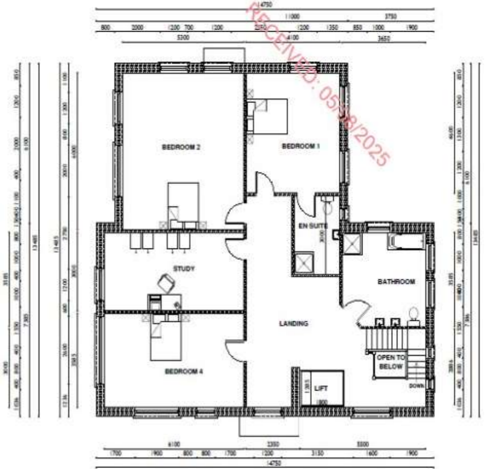
PROPOSED FIRST FLOOR PLAN 1:100 PROPOSED FIRST FLOOR AREA 151.80 SQ METRES (1633 SQ FEET)