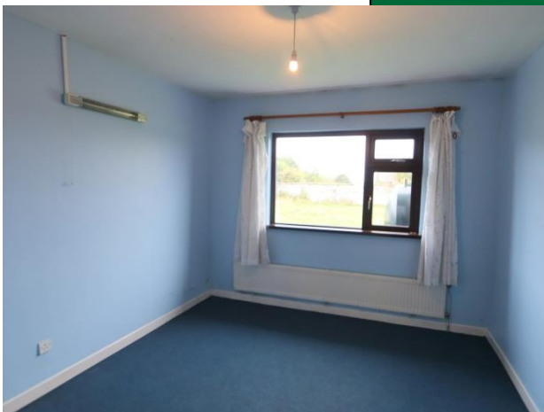
Bedroom No. 4