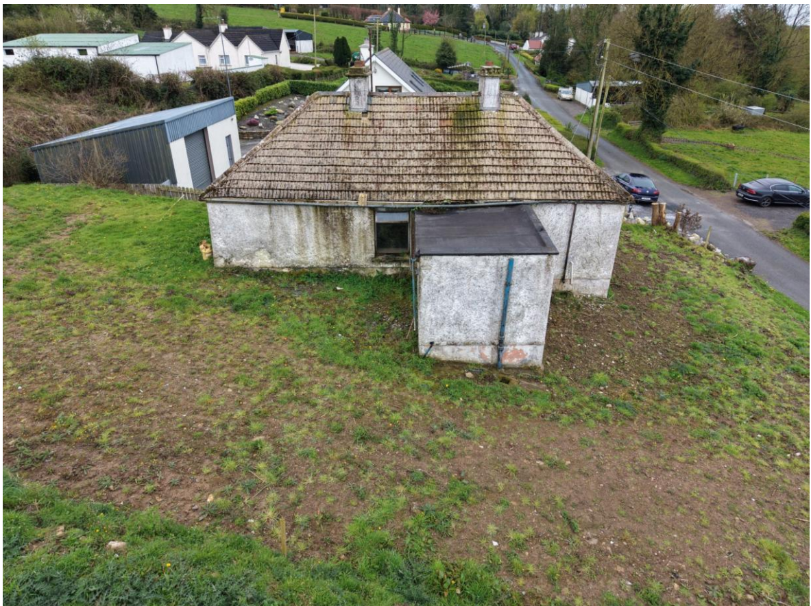
Derelict Residence, Ashbrook, Strokestown, Co. Roscommon