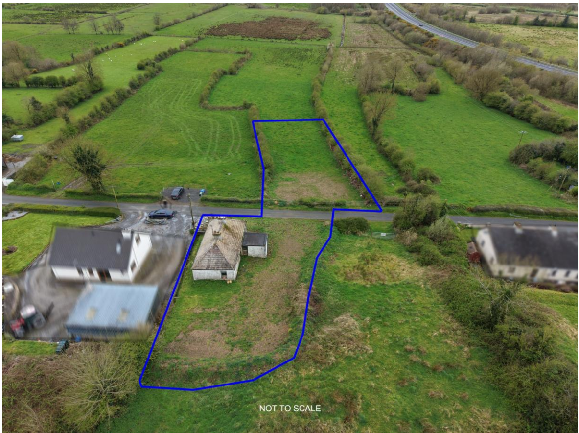
Derelict Residence, Ashbrook, Strokestown, Co. Roscommon