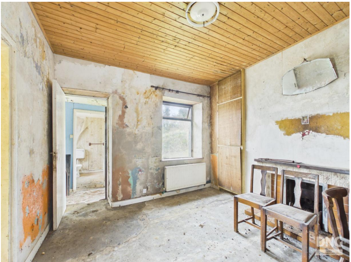
Derelict Residence, Ashbrook, Strokestown, Co. Roscommon