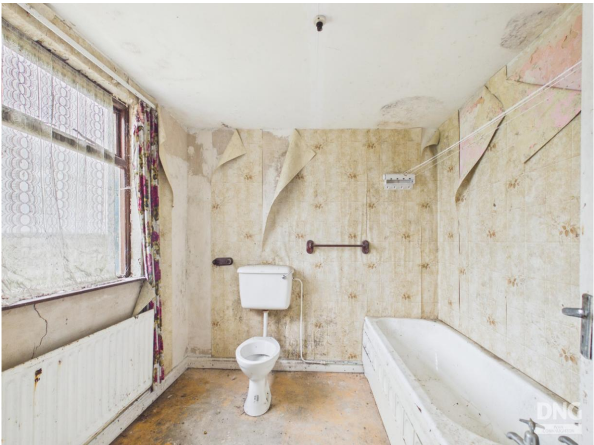
Derelict Residence, Ashbrook, Strokestown, Co. Roscommon