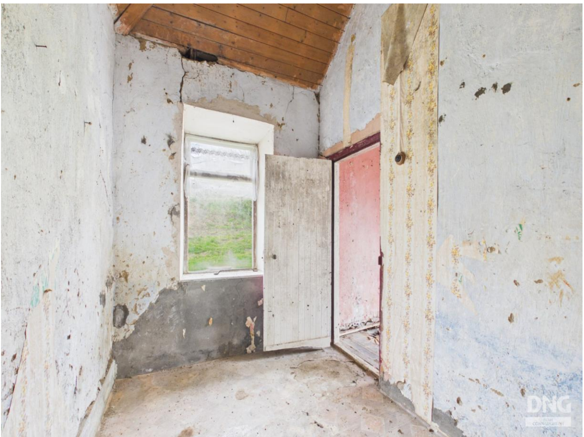
Derelict Residence, Ashbrook, Strokestown, Co. Roscommon