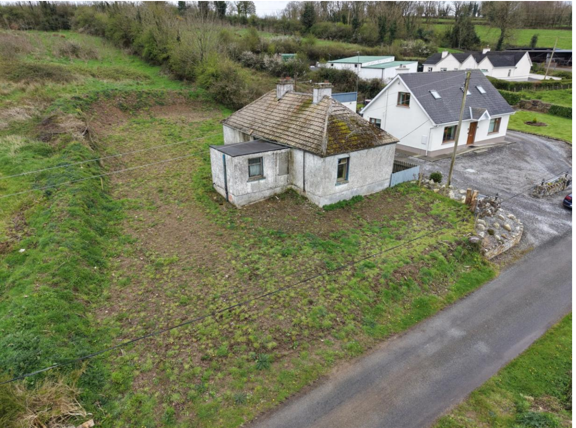
Derelict Residence, Ashbrook, Strokestown, Co. Roscommon