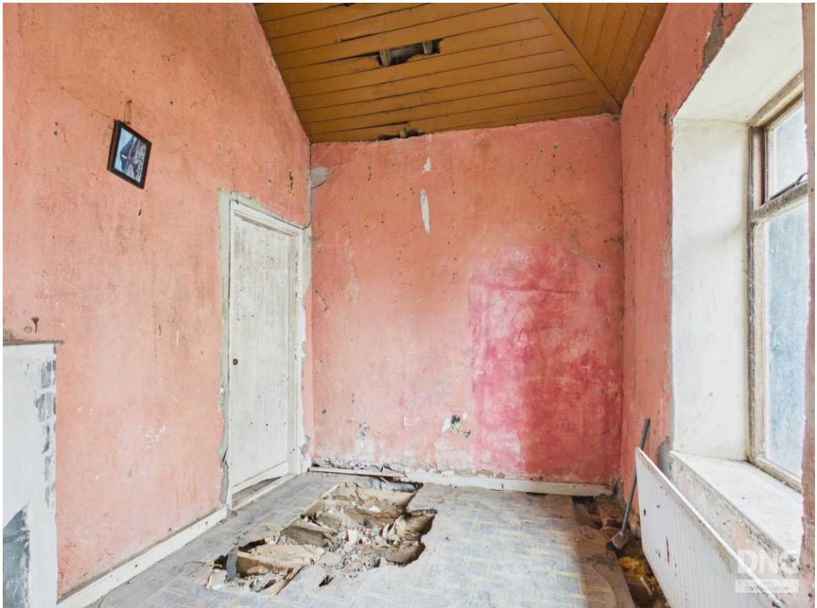
Derelict Residence, Ashbrook, Strokestown, Co. Roscommon