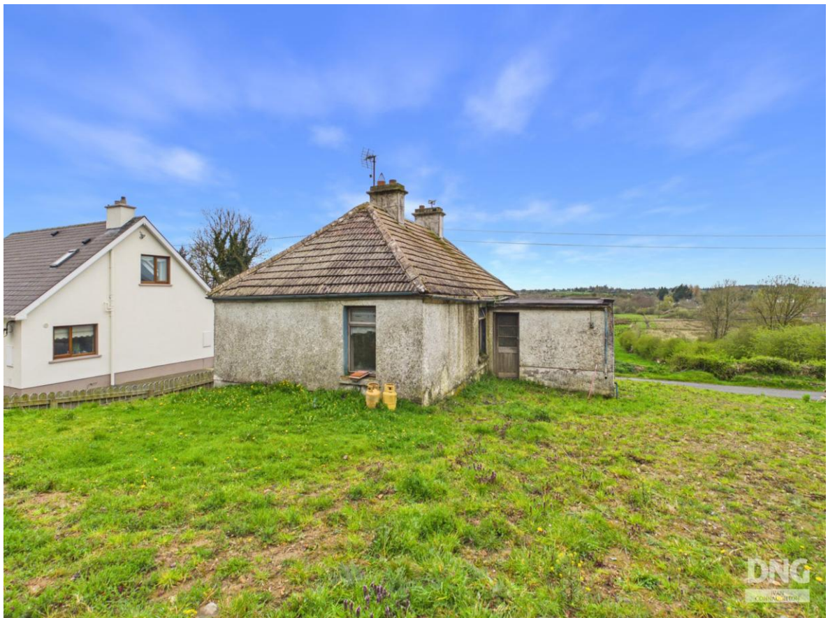
Derelict Residence, Ashbrook, Strokestown, Co. Roscommon