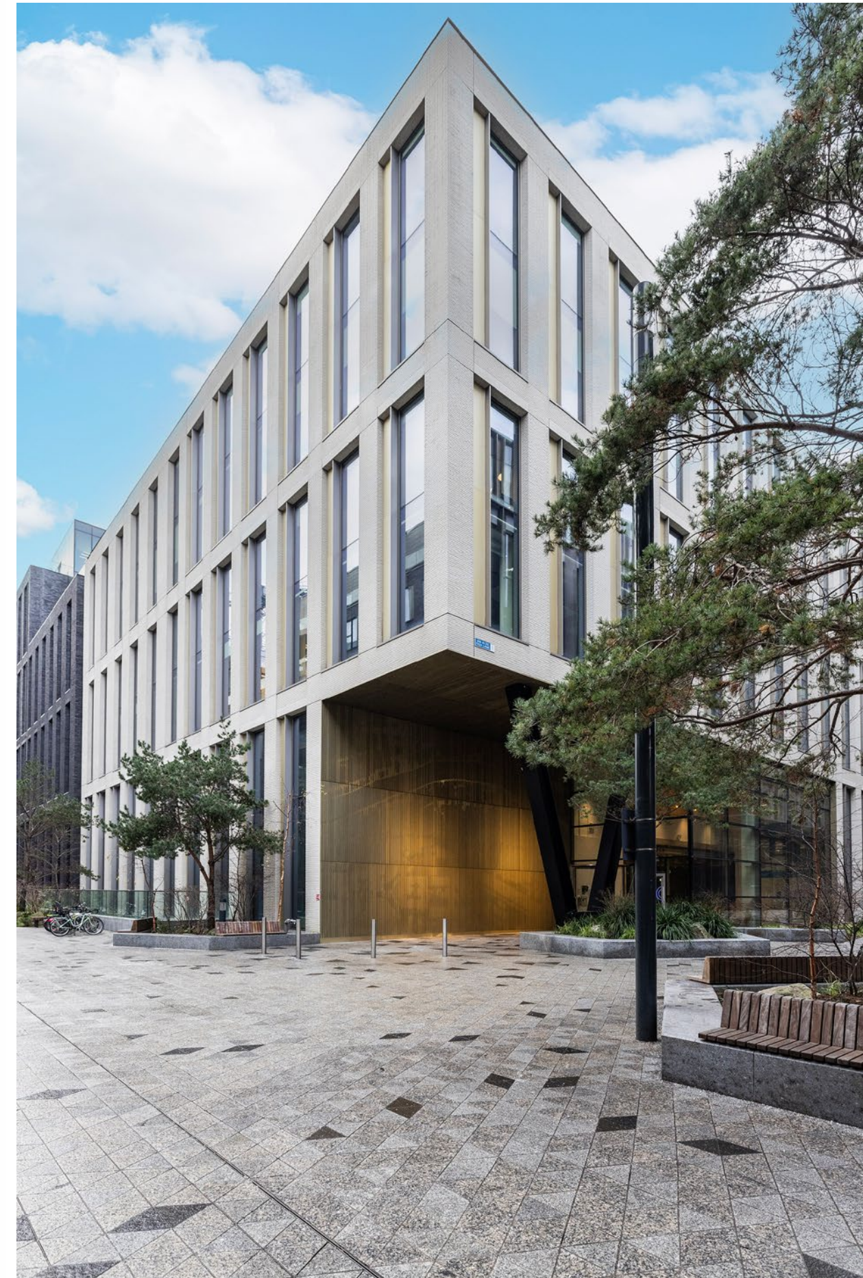
WeWork at Dublin Landings

Neighbours within Dublin Landings include the Central Bank of Ireland, National Treasury Management Agency and WeWork, with Salesforce, PwC, An Post and Citi in the immediate area