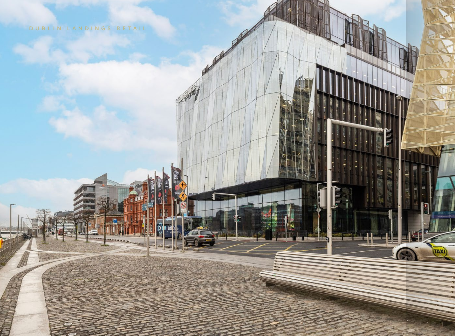
Salesforce European HQ