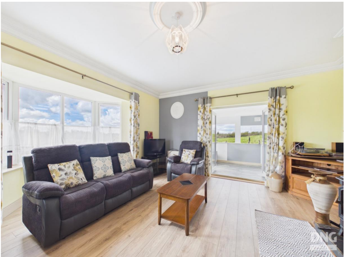
Caher, Castlerea, Co. Roscommon. F45 CK15