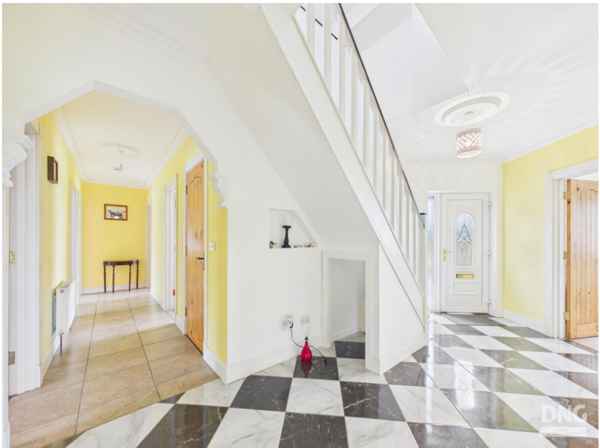
Caher, Castlerea, Co. Roscommon. F45 CK15