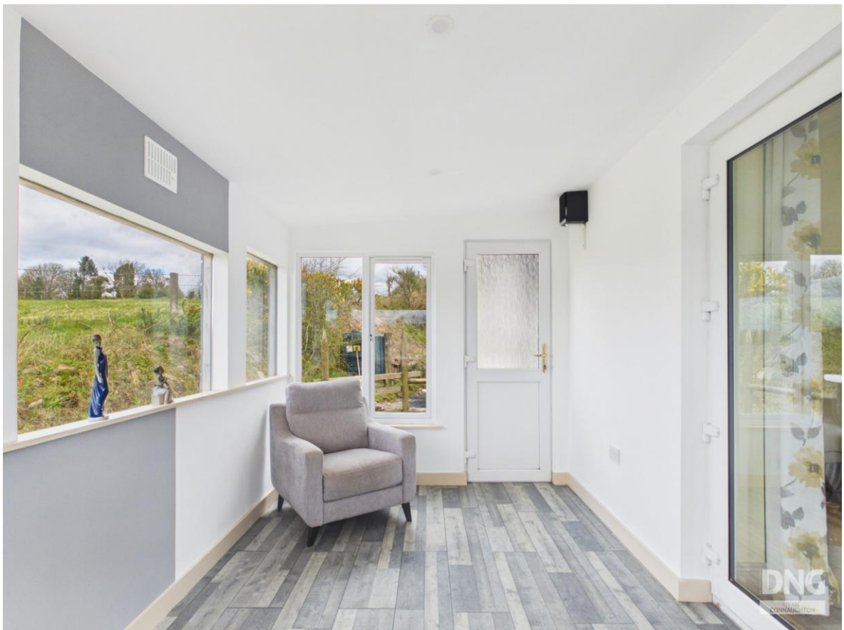
Caher, Castlerea, Co. Roscommon. F45 CK15