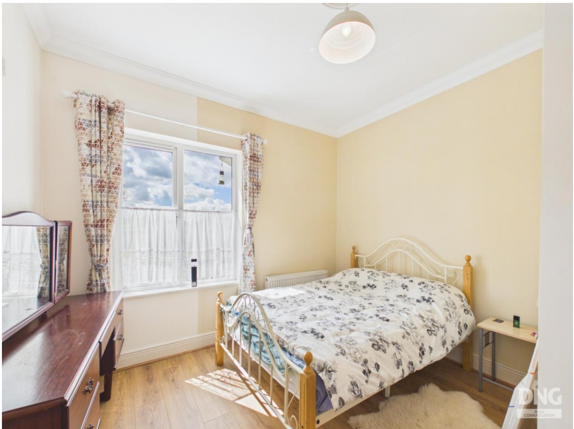
Caher, Castlerea, Co. Roscommon. F45 CK15