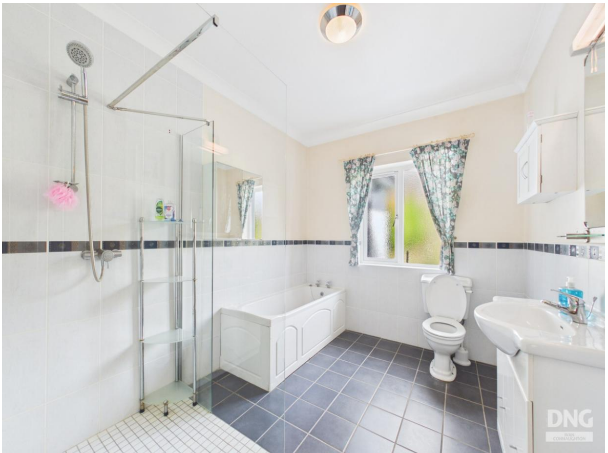
Caher, Castlerea, Co. Roscommon. F45 CK15