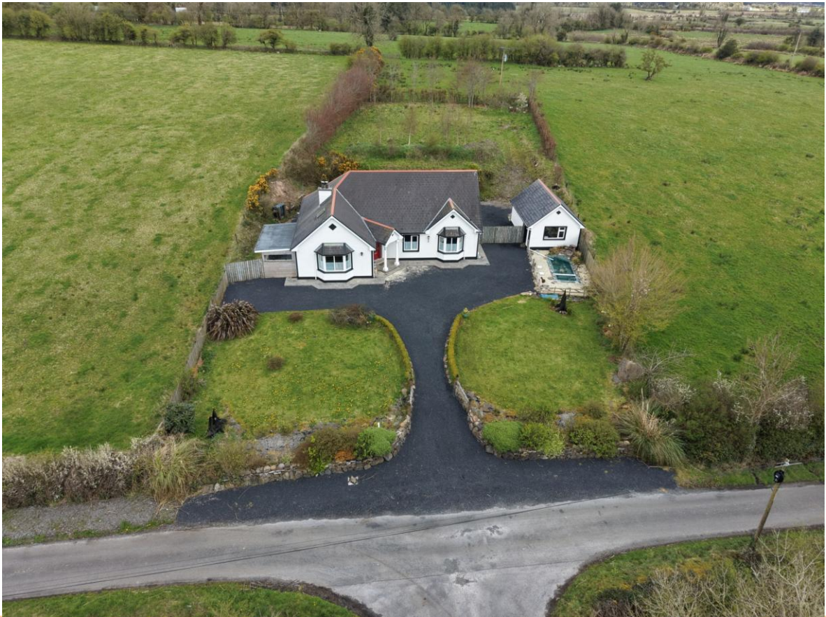
Caher, Castlerea, Co. Roscommon. F45 CK15