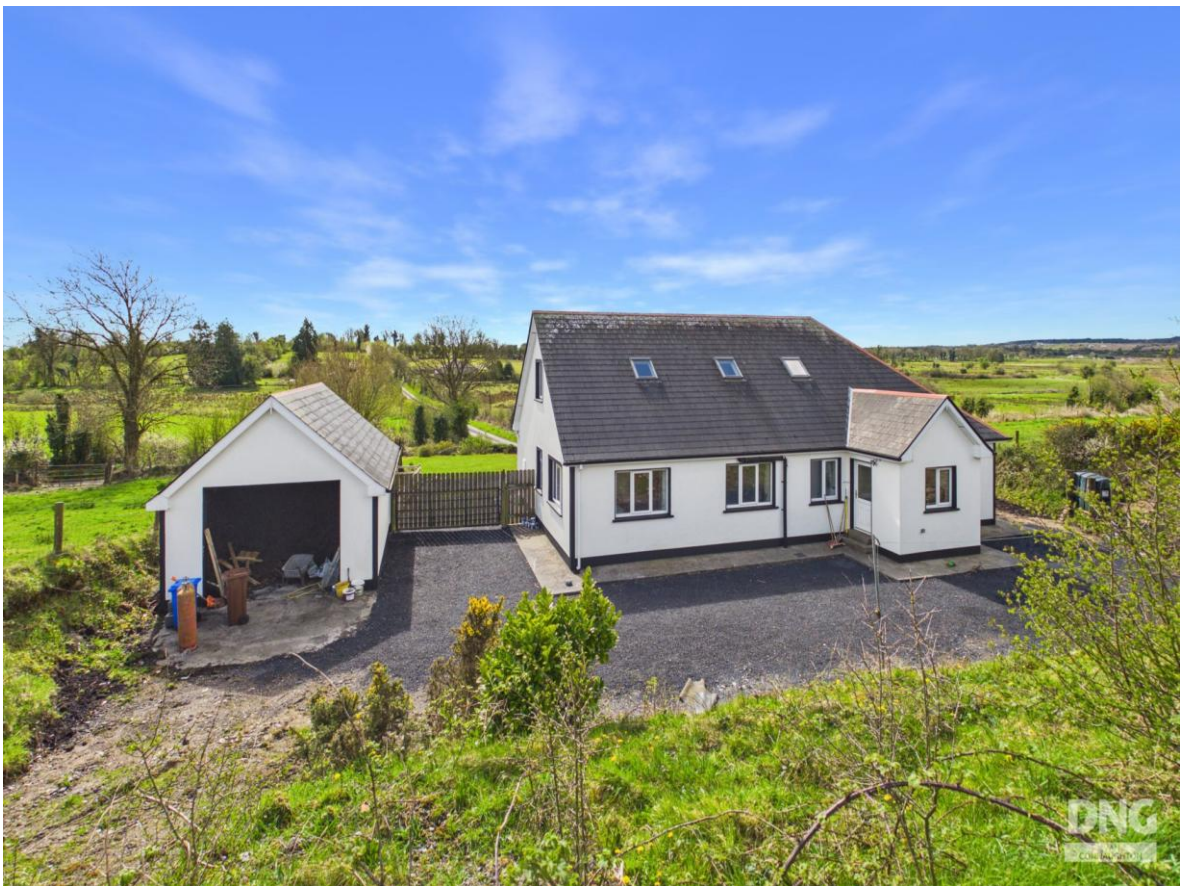
Caher, Castlerea, Co. Roscommon. F45 CK15