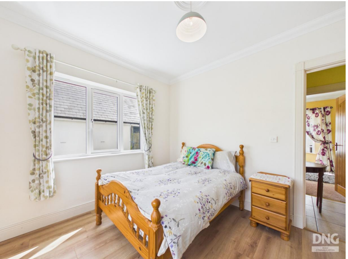
Caher, Castlerea, Co. Roscommon. F45 CK15