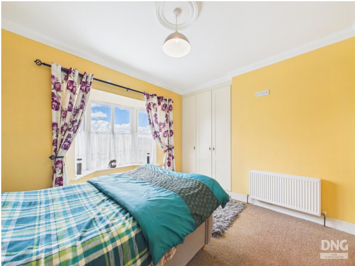
Caher, Castlerea, Co. Roscommon. F45 CK15