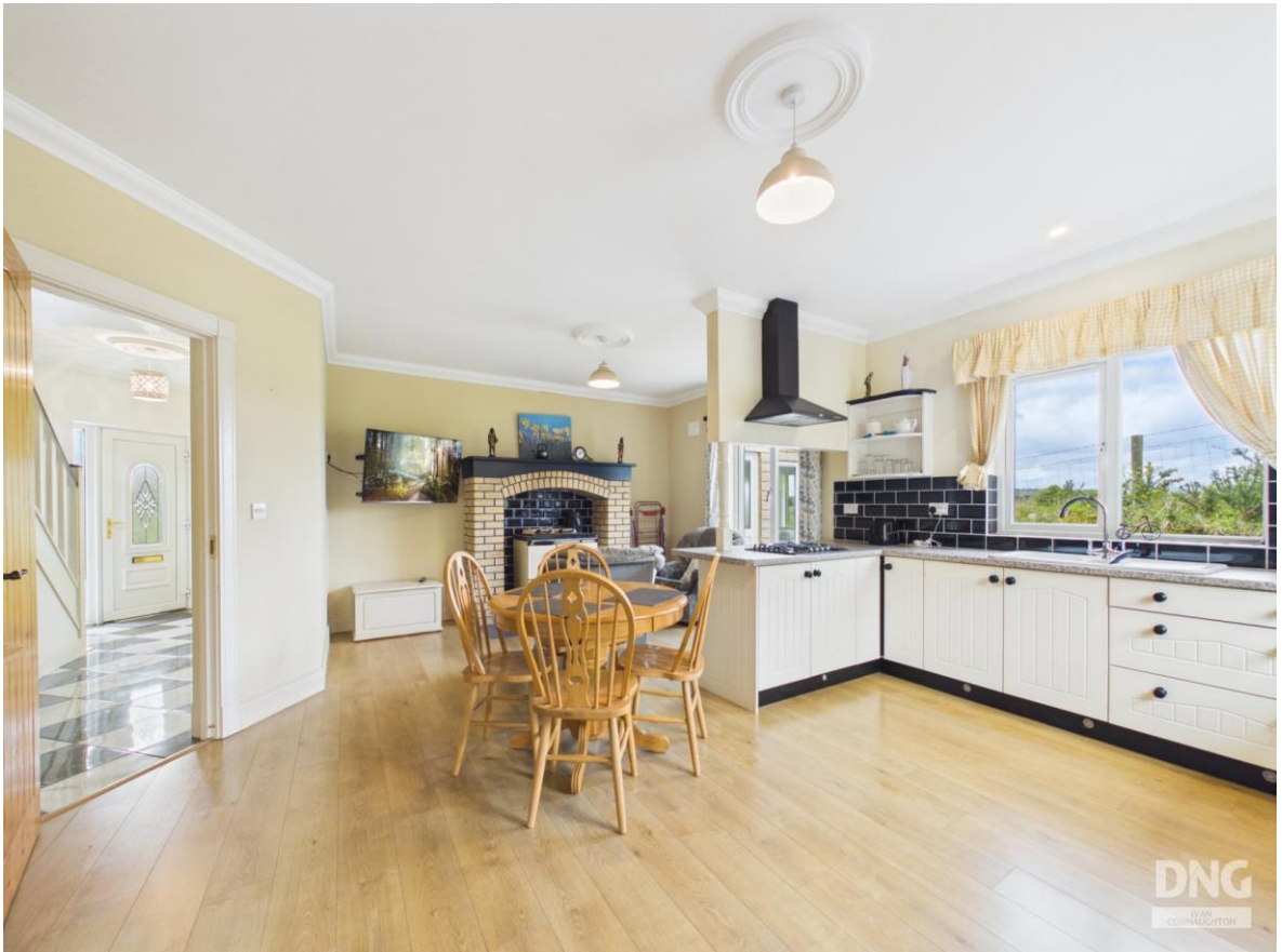
Caher, Castlerea, Co. Roscommon. F45 CK15