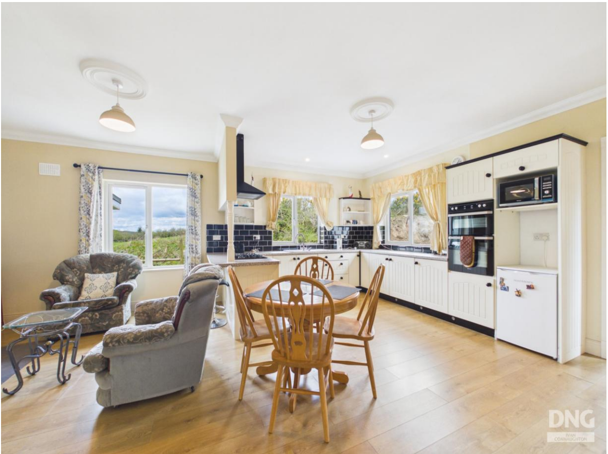
Caher, Castlerea, Co. Roscommon. F45 CK15