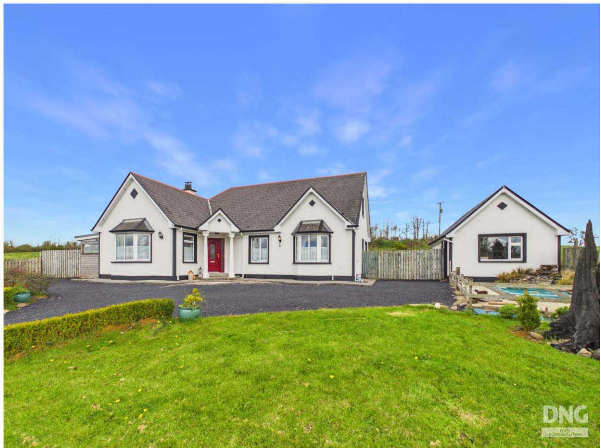
Caher, Castlerea, Co. Roscommon. F45 CK15