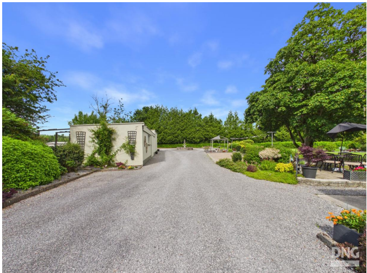
Bogganfin, Ballymurray, Co. Roscommon, F42 KP28