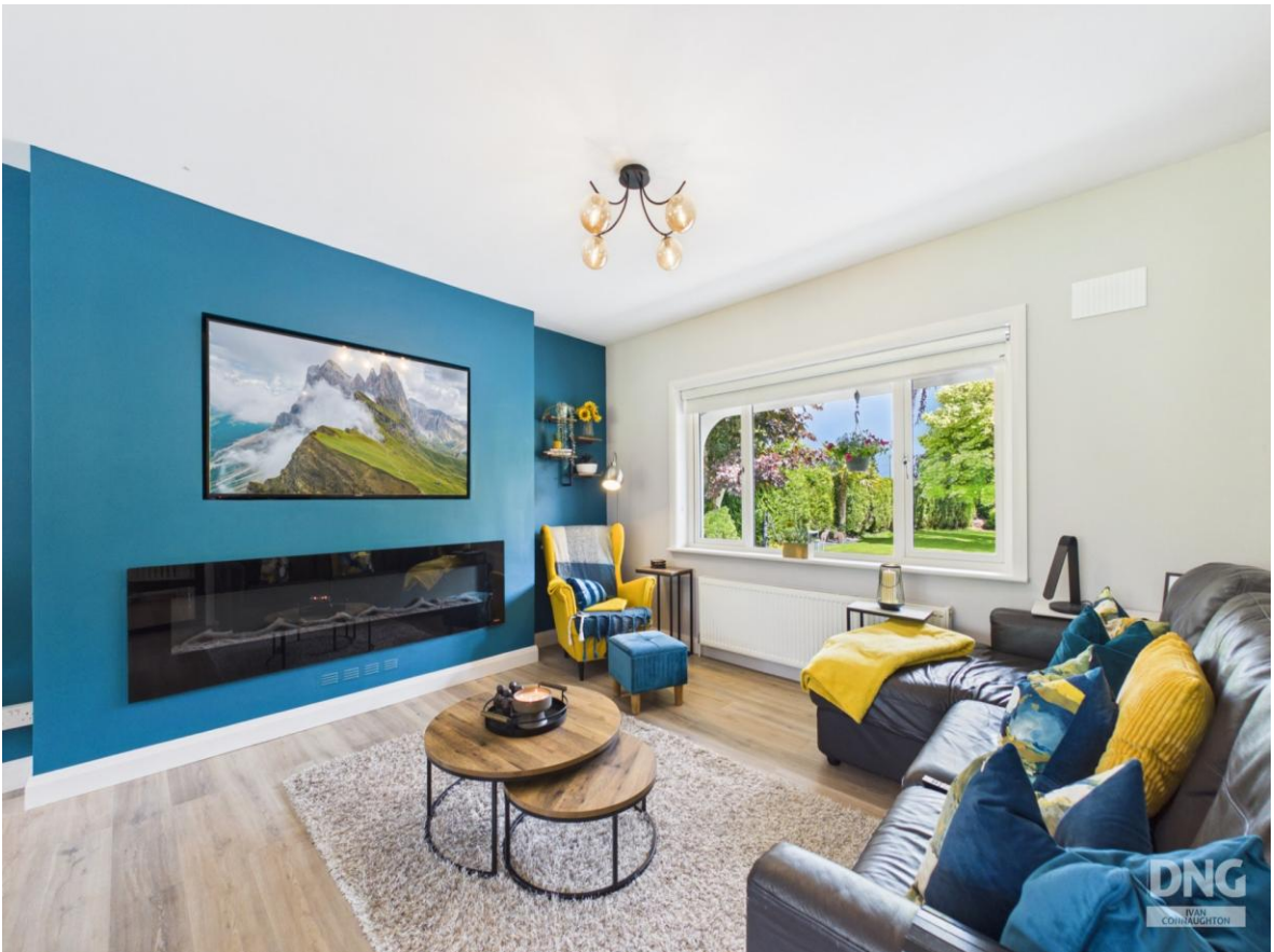
Bogganfin, Ballymurray, Co. Roscommon, F42 KP28