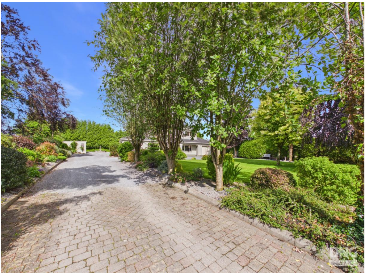
Bogganfin, Ballymurray, Co. Roscommon, F42 KP28