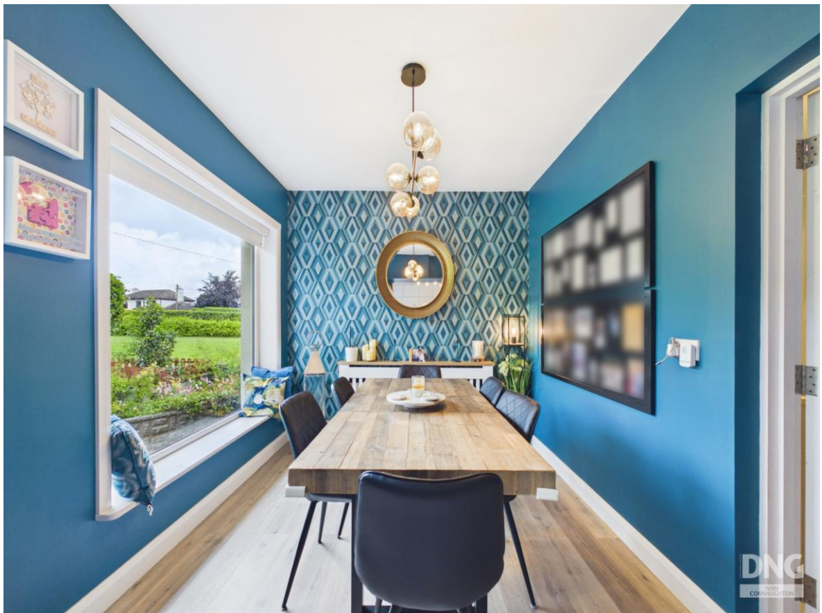
Bogganfin, Ballymurray, Co. Roscommon, F42 KP28