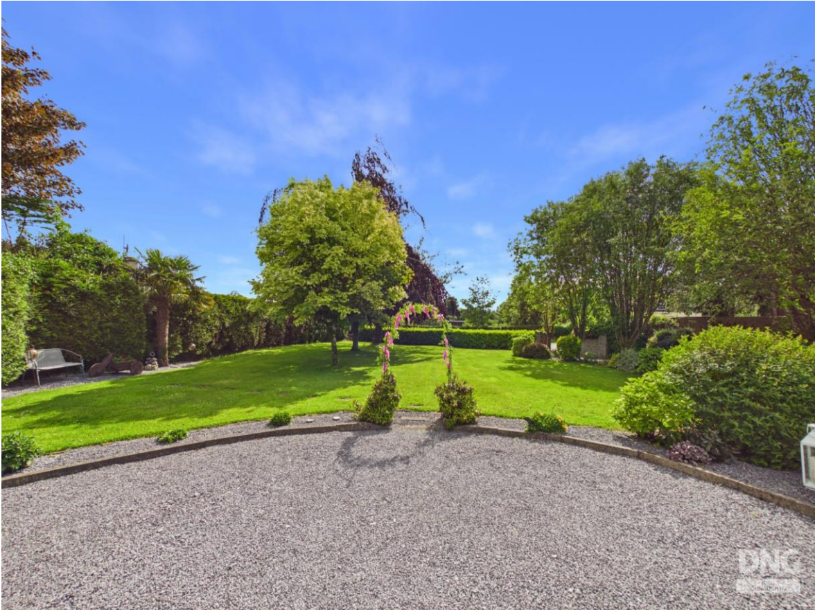
Bogganfin, Ballymurray, Co. Roscommon, F42 KP28