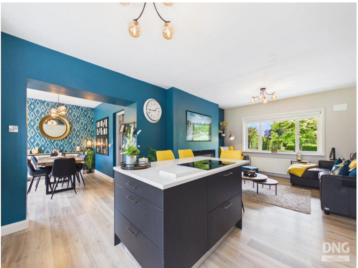
Bogganfin, Ballymurray, Co. Roscommon, F42 KP28