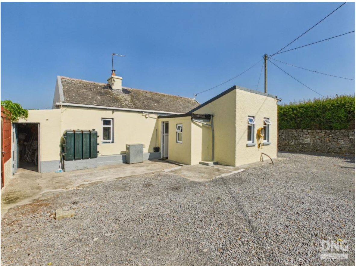
Killeroran, Ballygar, Co. Galway. F42 YC94