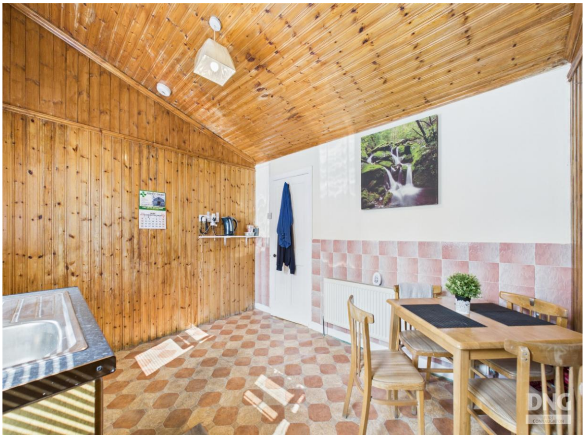
Killeroran, Ballygar, Co. Galway. F42 YC94