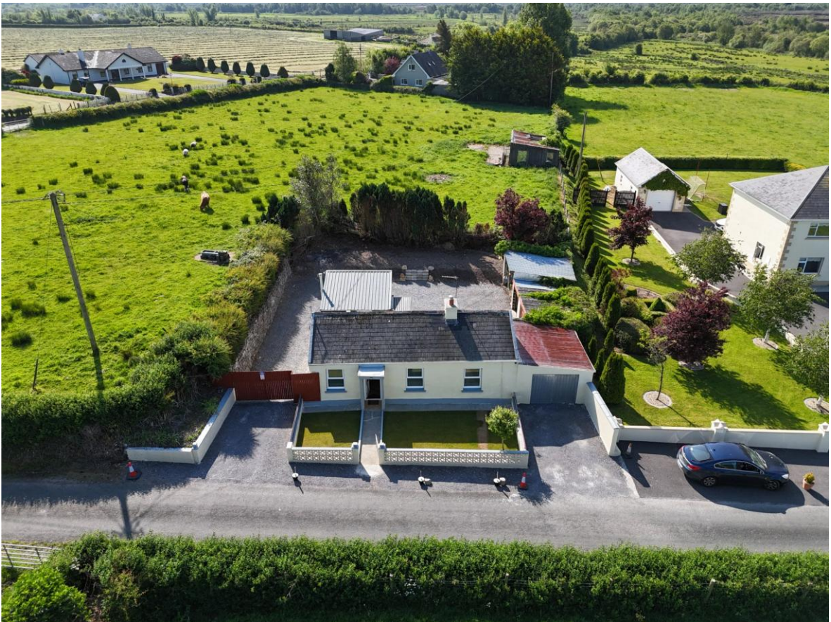
Killeroran, Ballygar, Co. Galway. F42 YC94