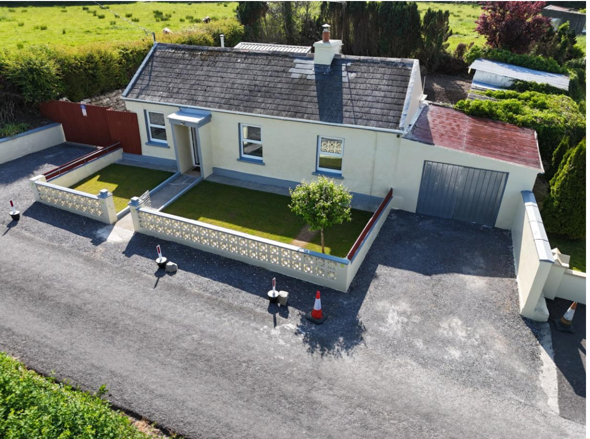
Killieroran, Ballygar, Co. Galway. F42 YC94