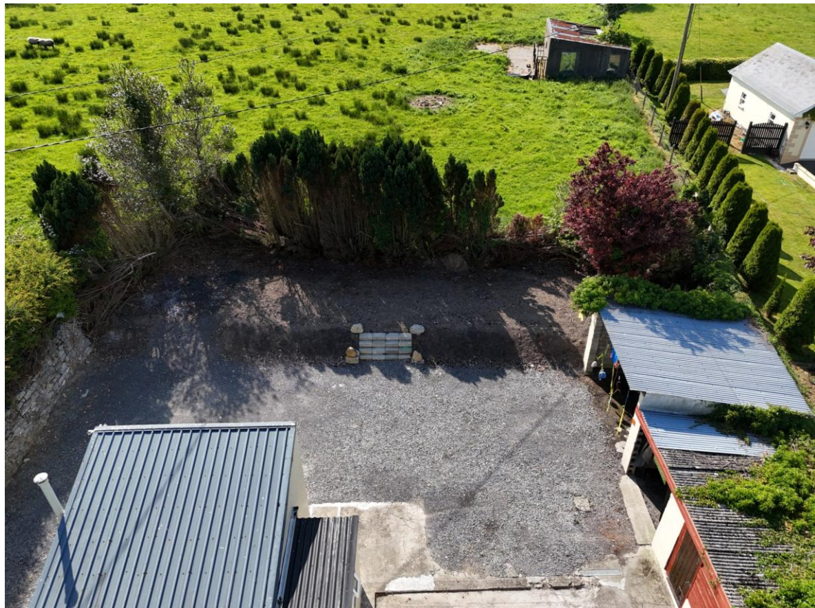
Killieroran, Ballygar, Co. Galway. F42 YC94