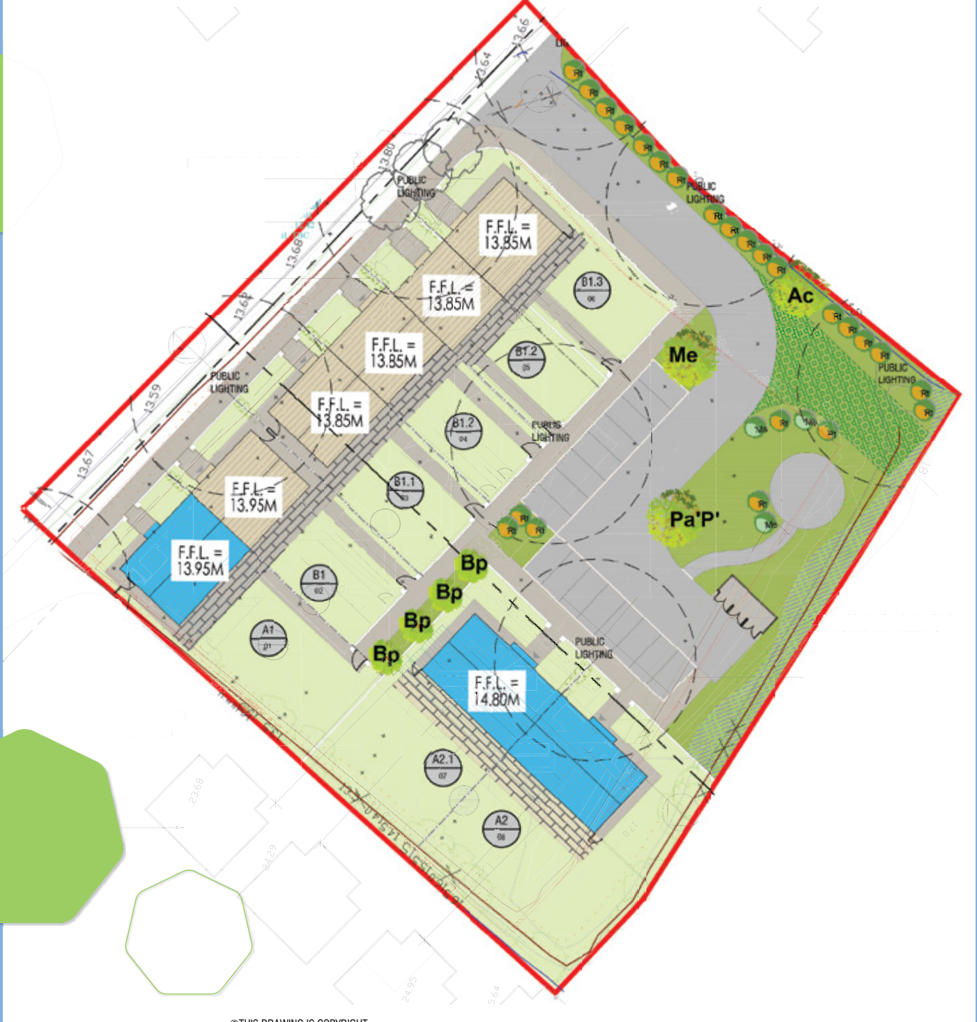
©THIS DRAWING IS COPYRIGHT THIS DRAWING IS FOR PLANNING PURPOSES ONLY