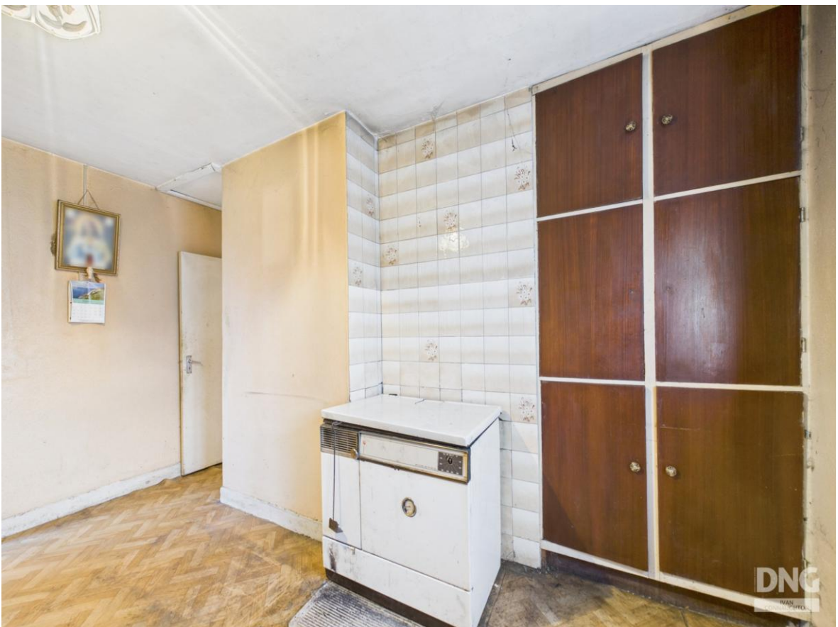
Residence & Lands On C. 26.00 Acres, Cloonlaughnan, Mount Talbot, Co. Roscommon, F42 C665