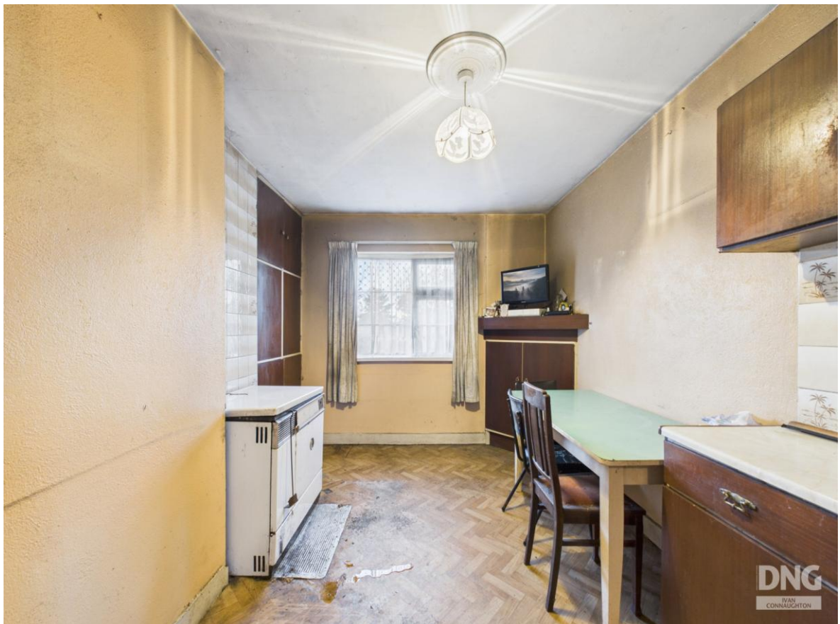
Residence & Lands On C. 26.00 Acres, Cloonlaughnan, Mount Talbot, Co. Roscommon, F42 C665