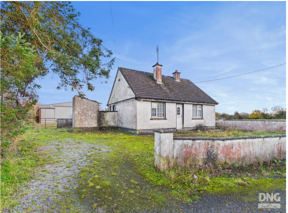
Residence & Lands On C. 26.00 Acres, Cloonlaughnan, Mount Talbot, Co. Roscommon, F42 C665