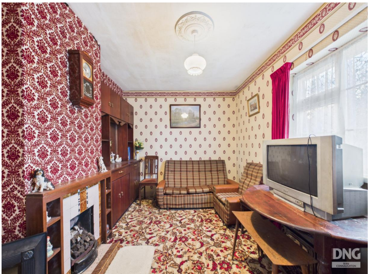
Residence & Lands On C. 26.00 Acres, Cloonlaughnan, Mount Talbot, Co. Roscommon, F42 C665