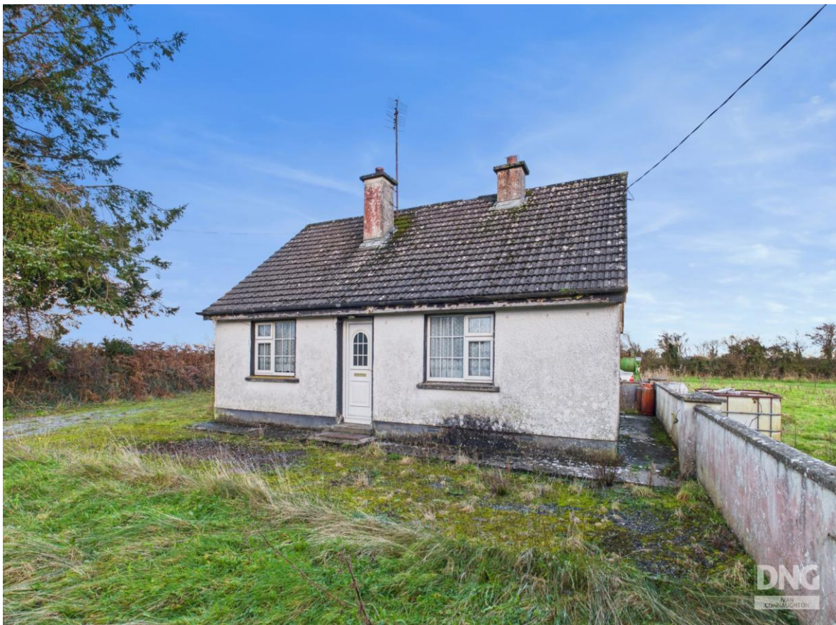
Residence & Lands On C. 26.00 Acres, Cloonlaughnan, Mount Talbot, Co. Roscommon, F42 C665