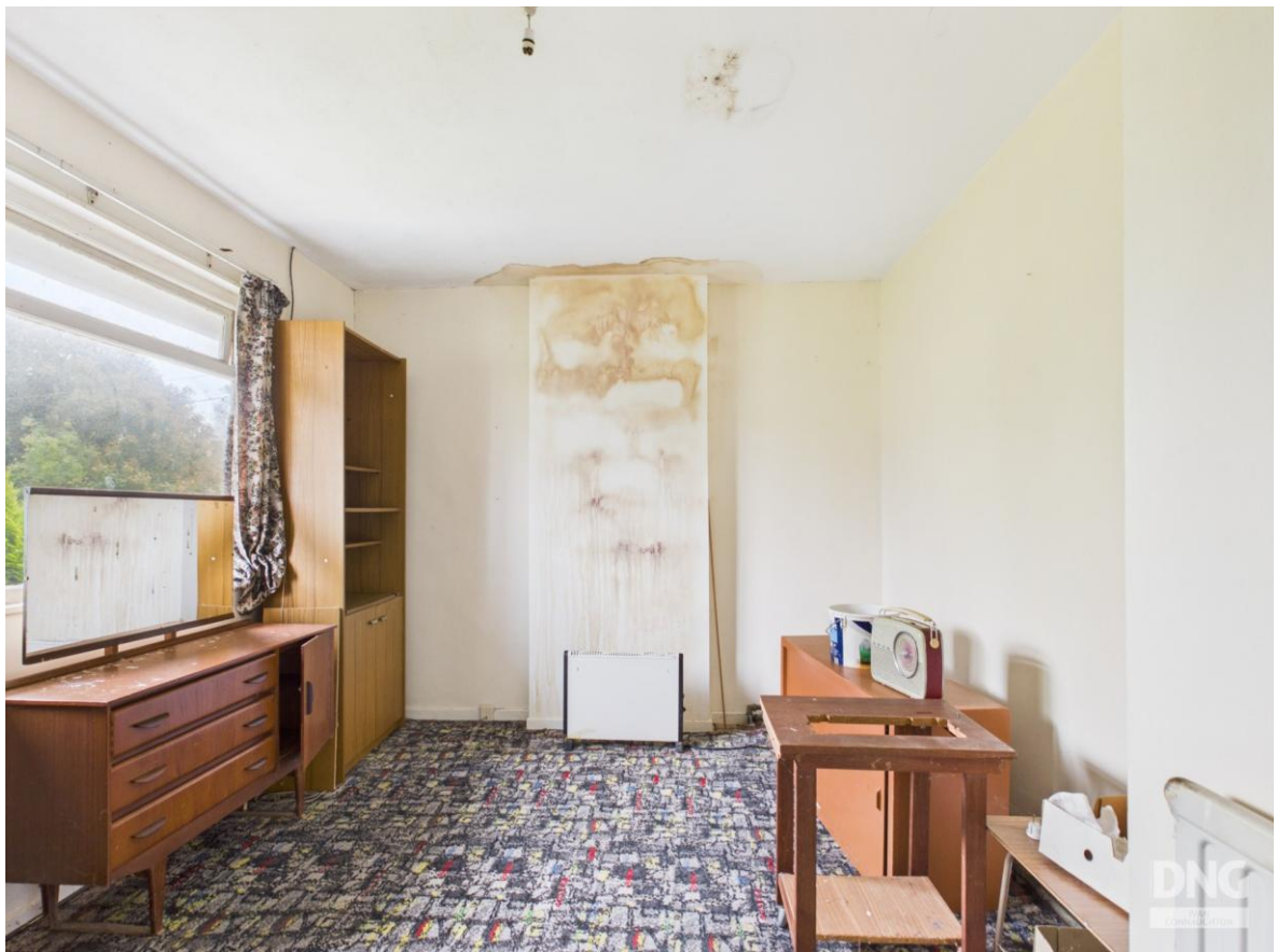
No. 4 Strokestown Road, Ballyleague, Co. Roscommon. N39 D279