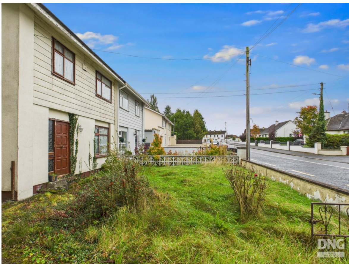
No. 4 Strokestown Road, Ballyleague, Co. Roscommon. N39 D279