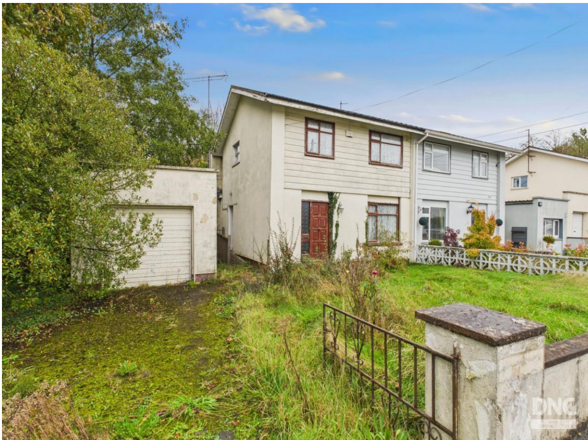
No. 4 Strokestown Road, Ballyleague, Co. Roscommon. N39 D279