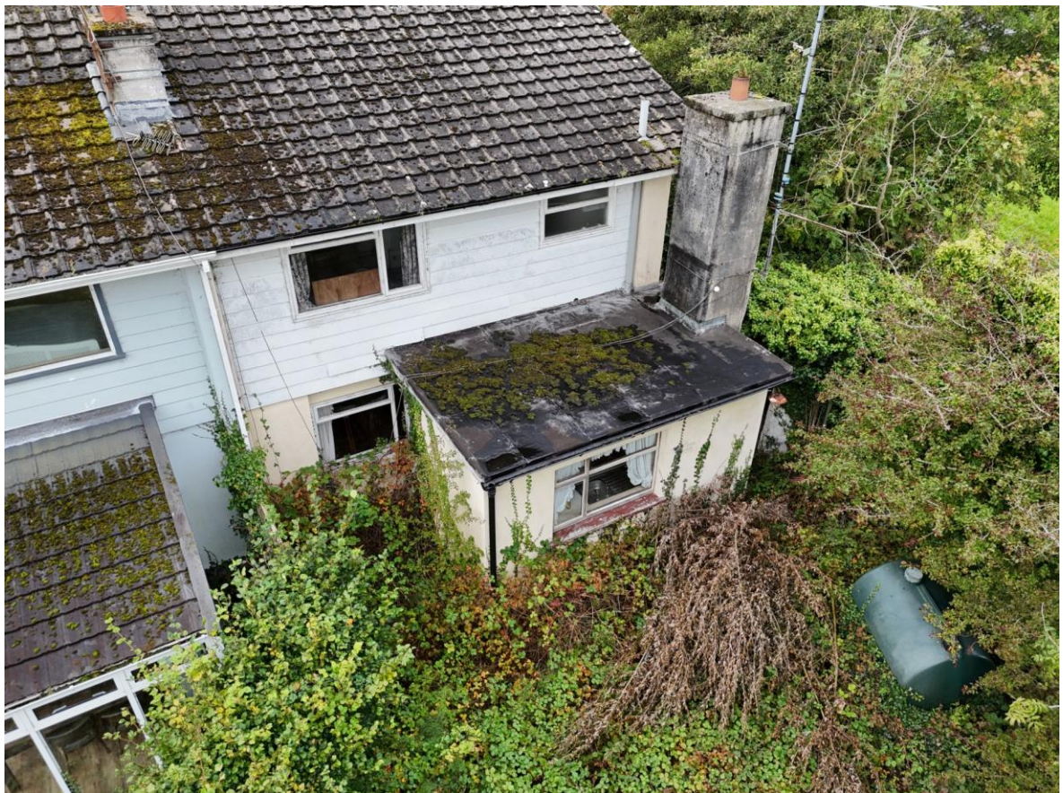
No. 4 Strokestown Road, Ballyleague, Co. Roscommon. N39 D279