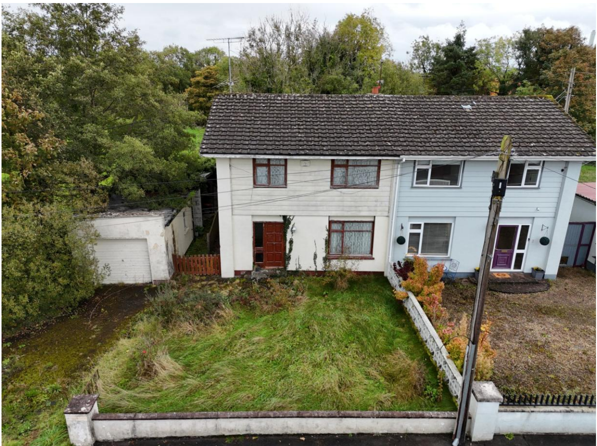
No. 4 Strokestown Road, Ballyleague, Co. Roscommon. N39 D279