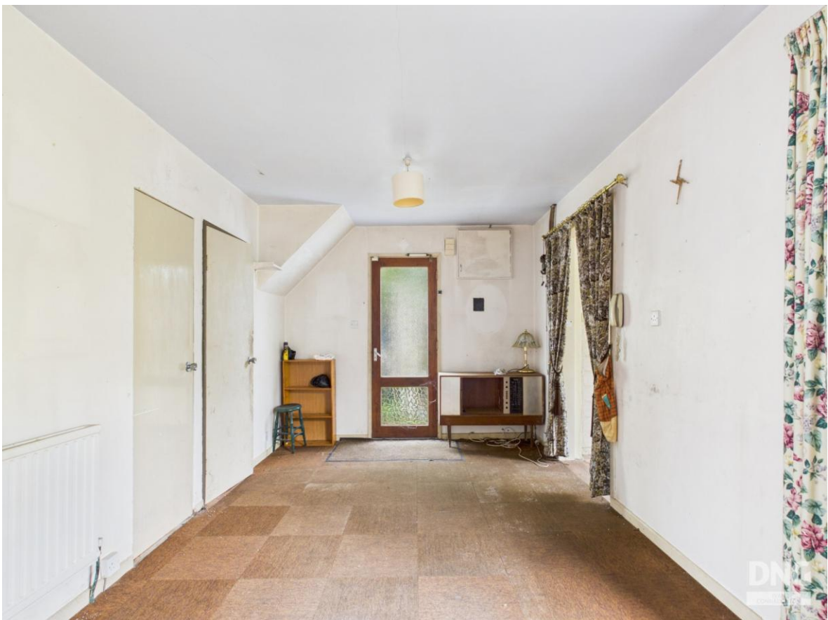
No. 4 Strokestown Road, Ballyleague, Co. Roscommon. N39 D279