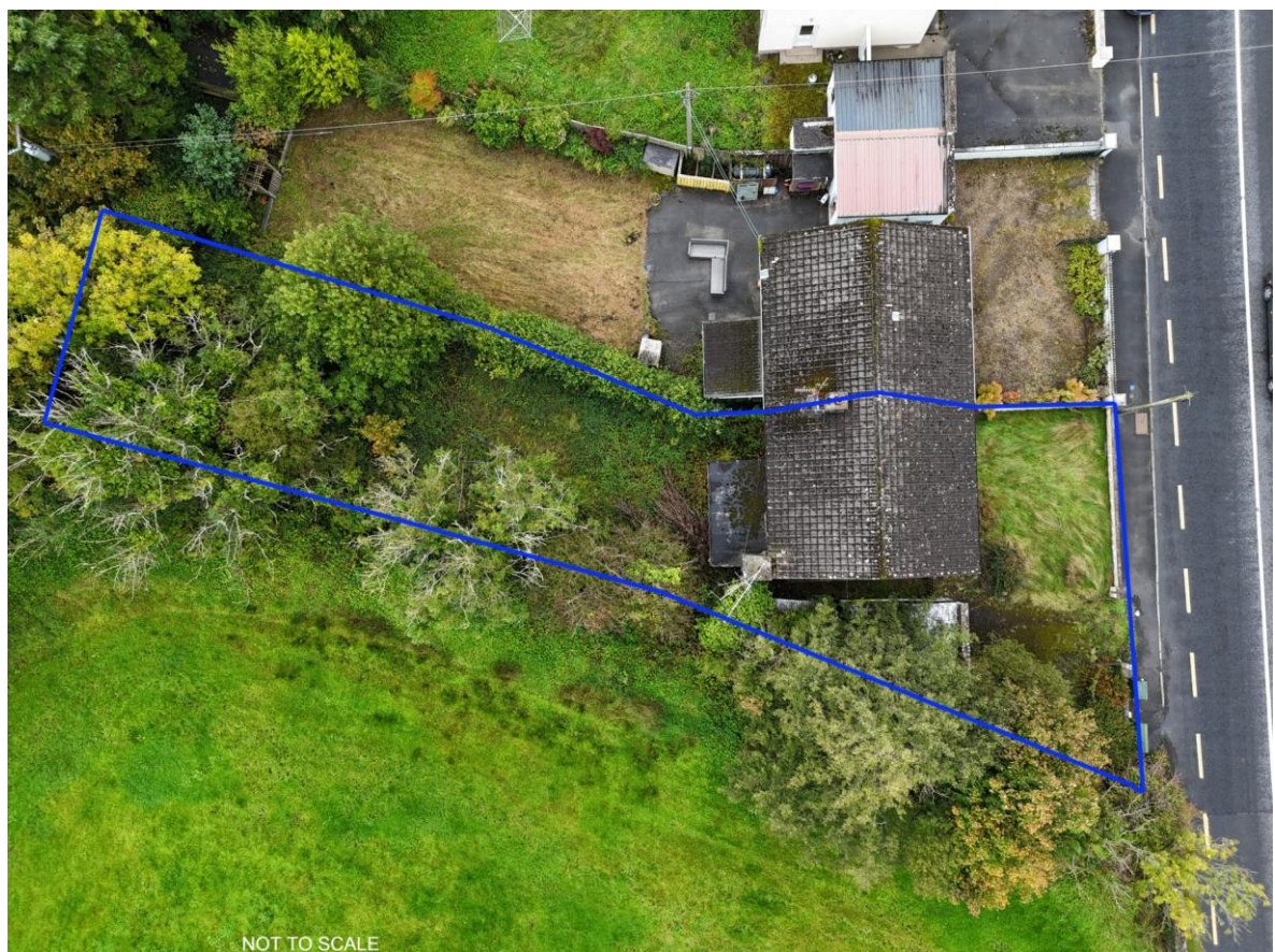
No. 4 Strokestown Road, Ballyleague, Co. Roscommon. N39 D279