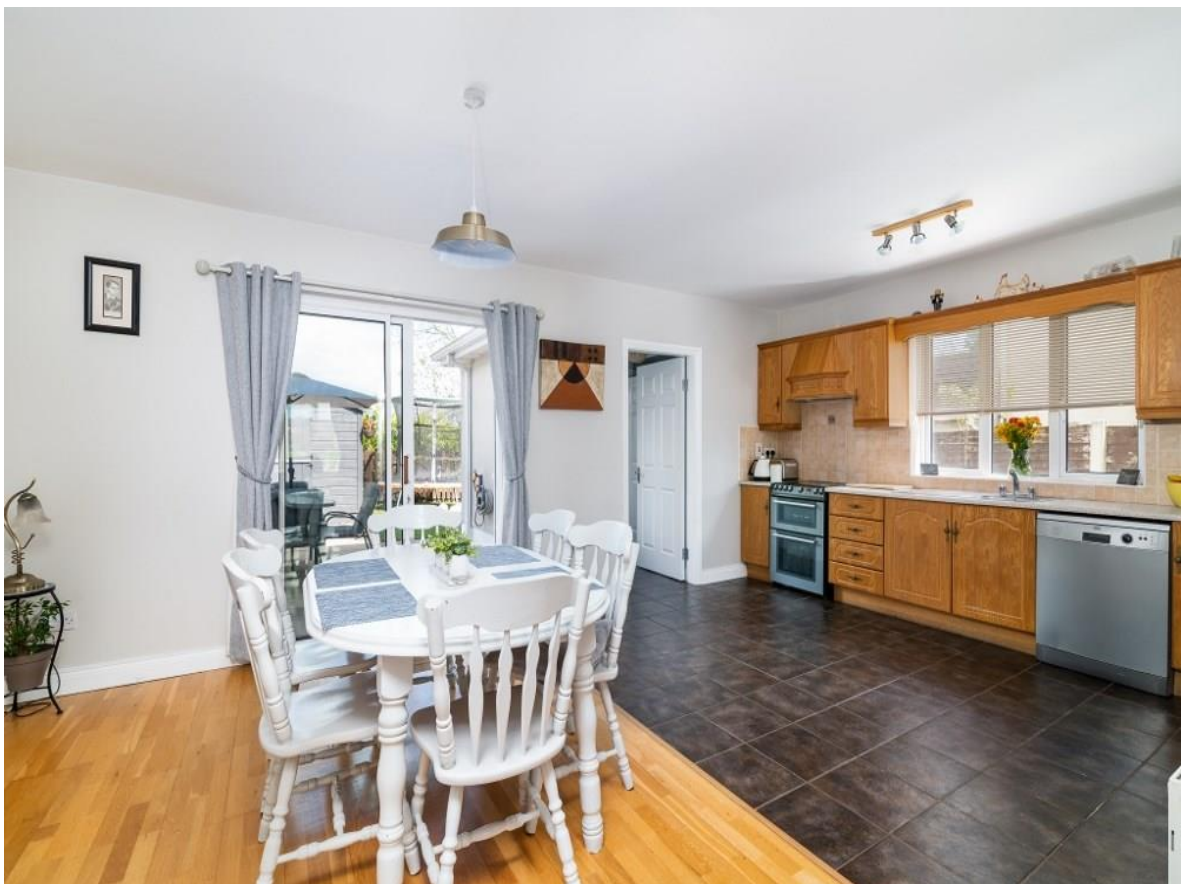
16 Cluain Fraoigh, Lanesboro Road, Roscommon Town, F42 XF64