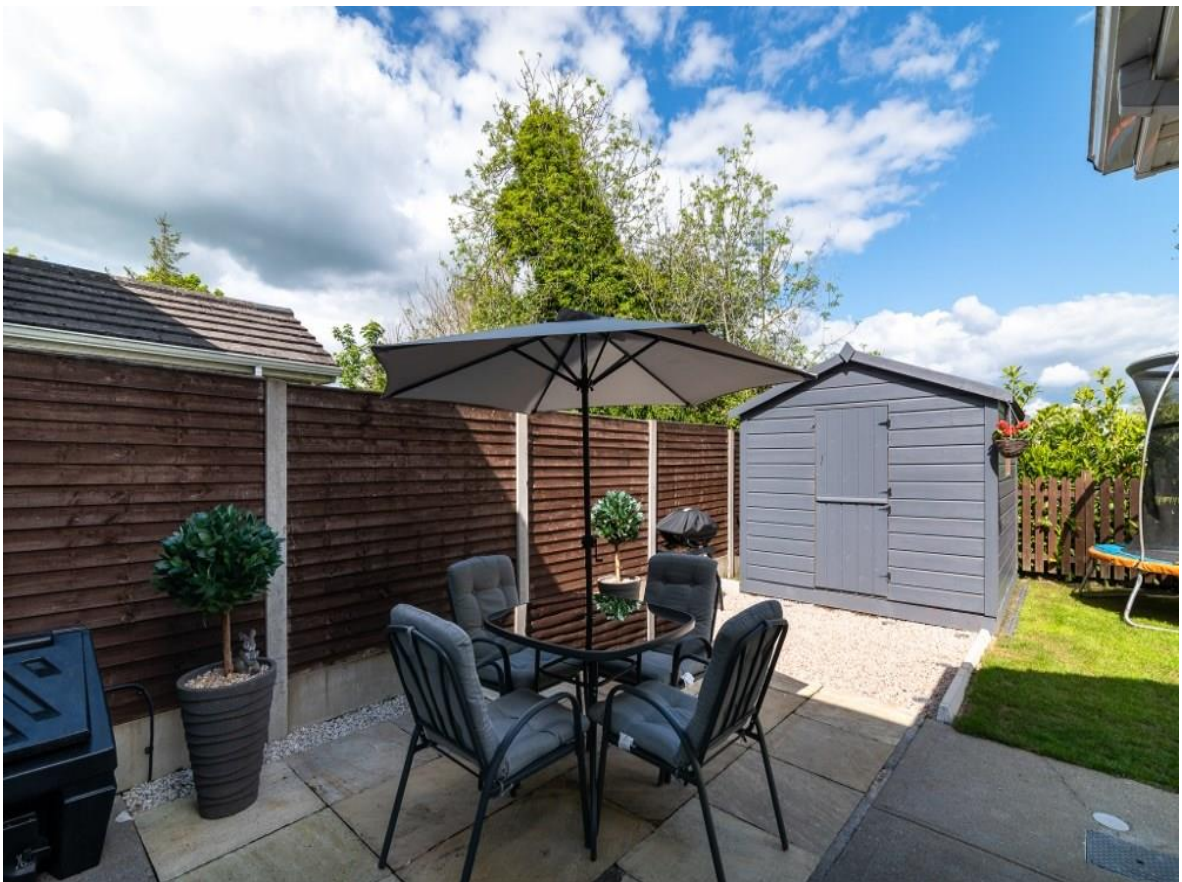
16 Cluain Fraoigh, Lanesboro Road, Roscommon Town, F42 XF64