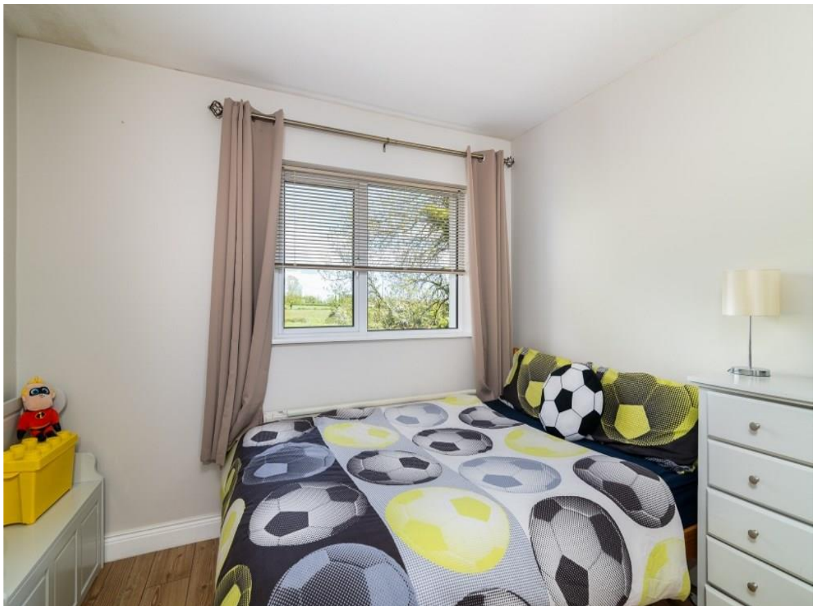
16 Cluain Fraoigh, Lanesboro Road, Roscommon Town, F42 XF64