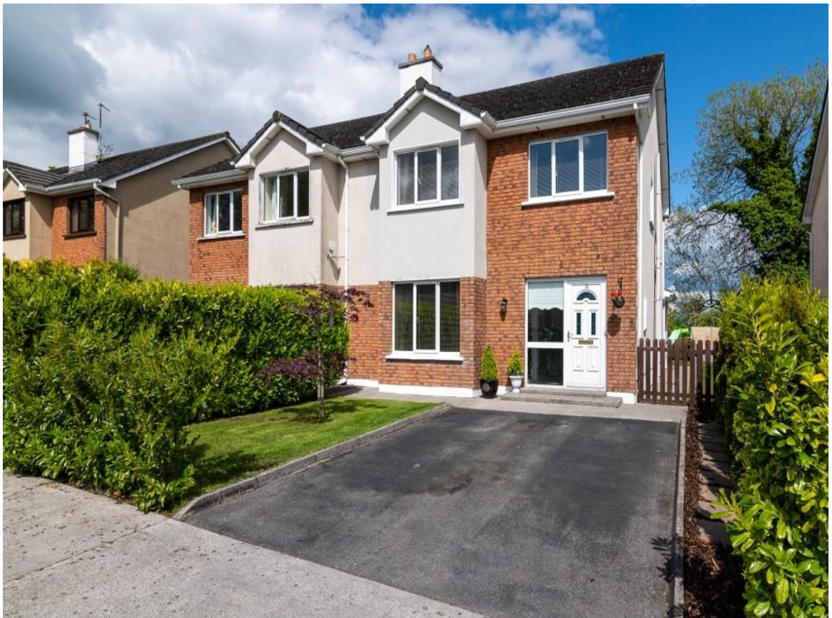
16 Cluain Fraoigh, Lanesboro Road, Roscommon Town, F42 XF64