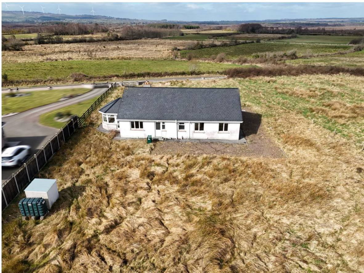
Drinagh, Tarmonbarry, Co. Roscommon. F42 NP93