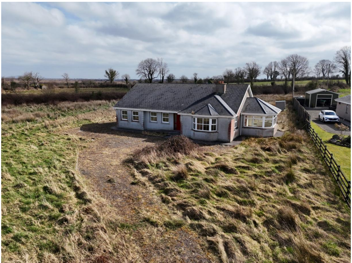
Drinagh, Tarmonbarry, Co. Roscommon. F42 NP93