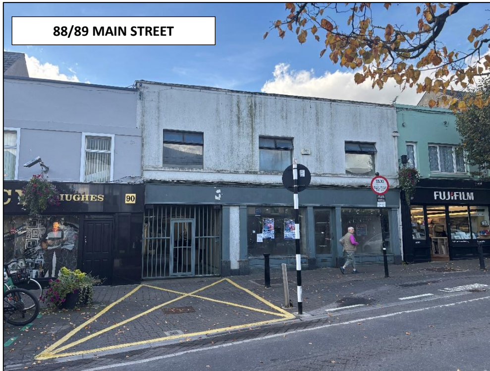
(For Identification Purposes Only)