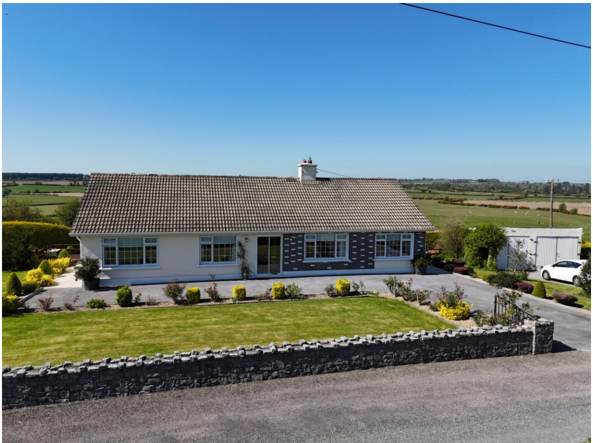
Barnacullen, Knockcroghery, Co. Roscommon. F42 VK38