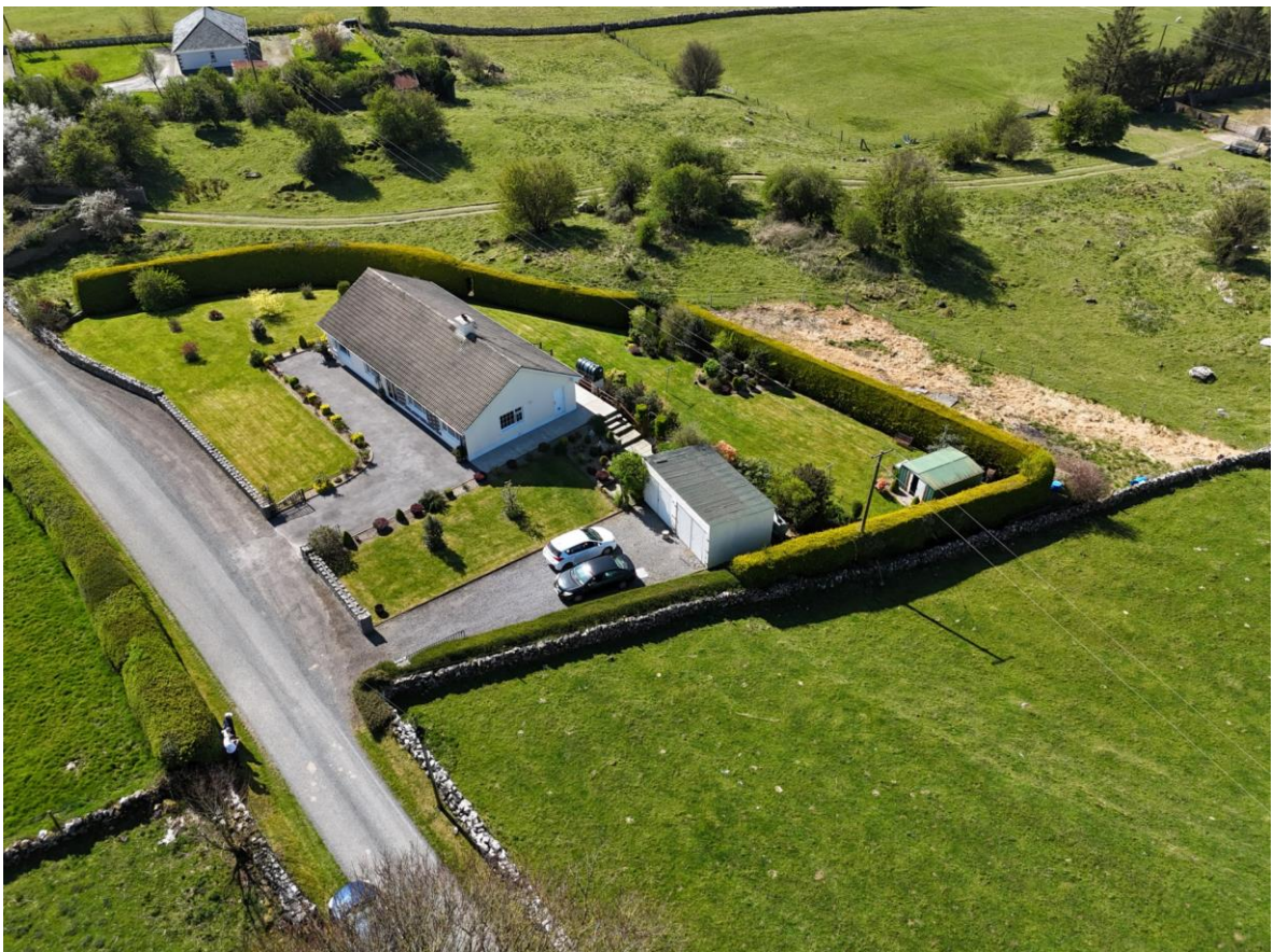
Barnacullen, Knockcroghery, Co. Roscommon. F42 VK38