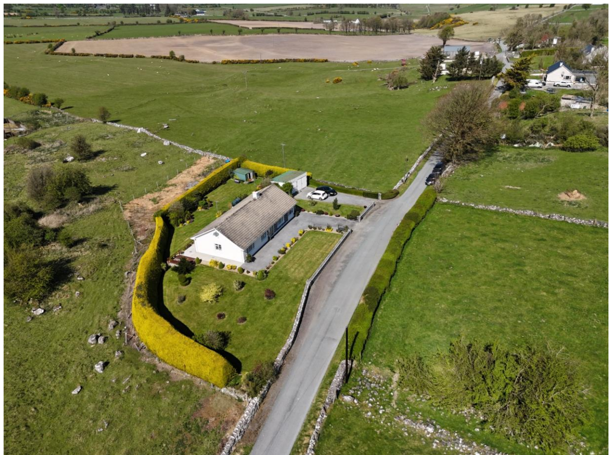
Barnacullen, Knockcroghery, Co. Roscommon. F42 VK38