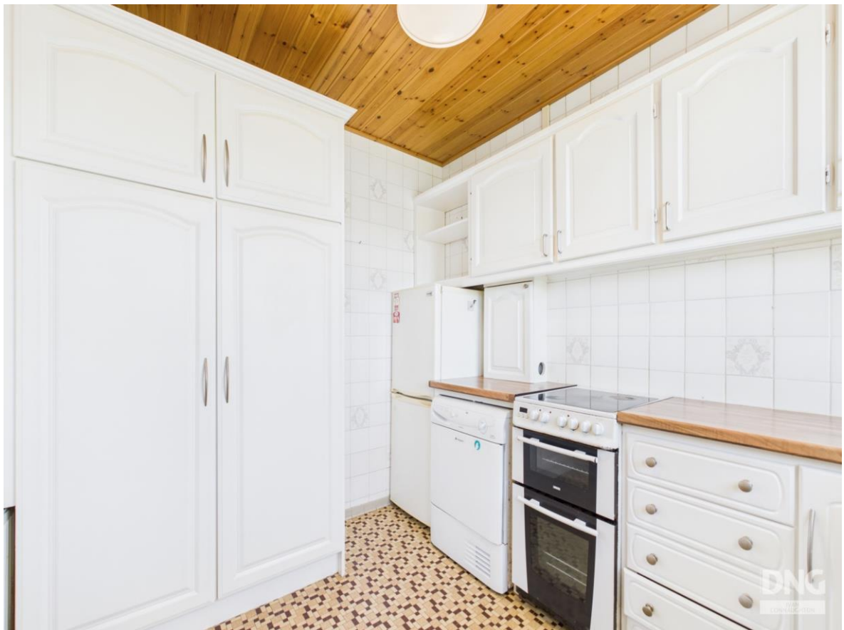
Barnacullen, Knockcroghery, Co. Roscommon. F42 VK38