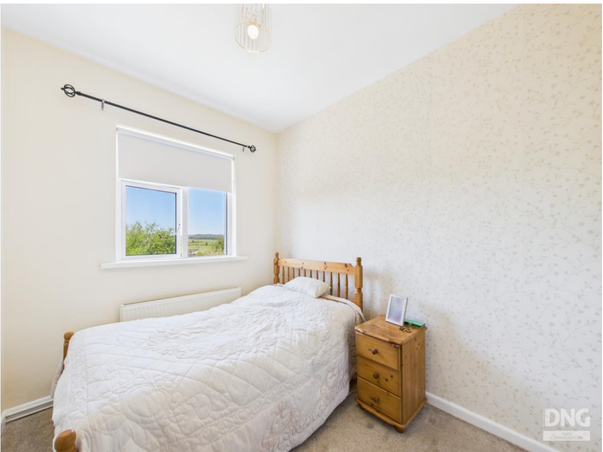
Barnacullen, Knockcroghery, Co. Roscommon. F42 VK38