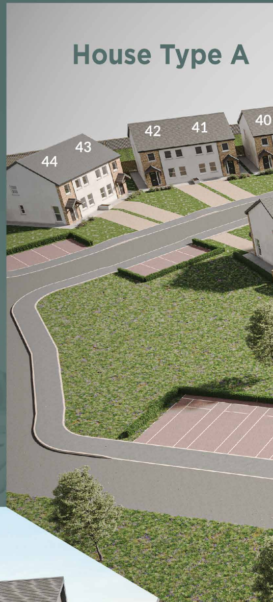
House Type A

The Roche Group are delighted to introduce Cois Currán, an exceptional turnkey development of 30 new A-Rated 3 bed semi detached and townhouses in the vibrant and welcoming village of Pallaskenry, Co. Limerick.