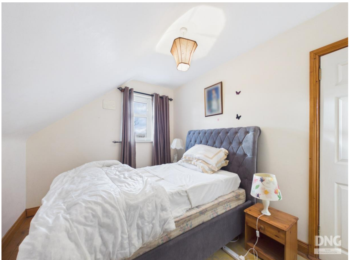
10 Quinn Villas, Ballaghaderreen, Co. Roscommon. F45 XE33