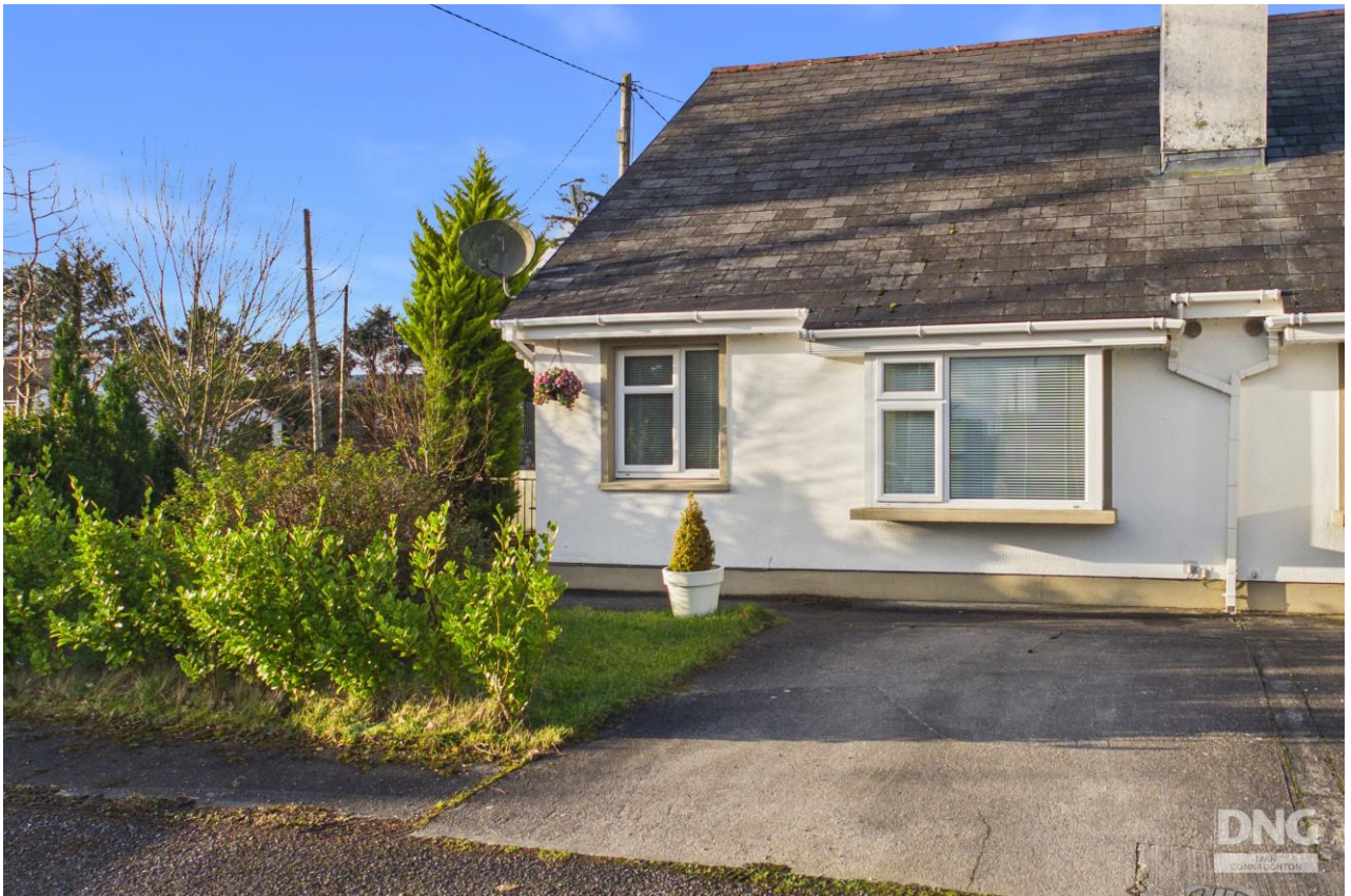
10 Quinn Villas, Ballaghaderreen, Co. Roscommon. F45 XE33