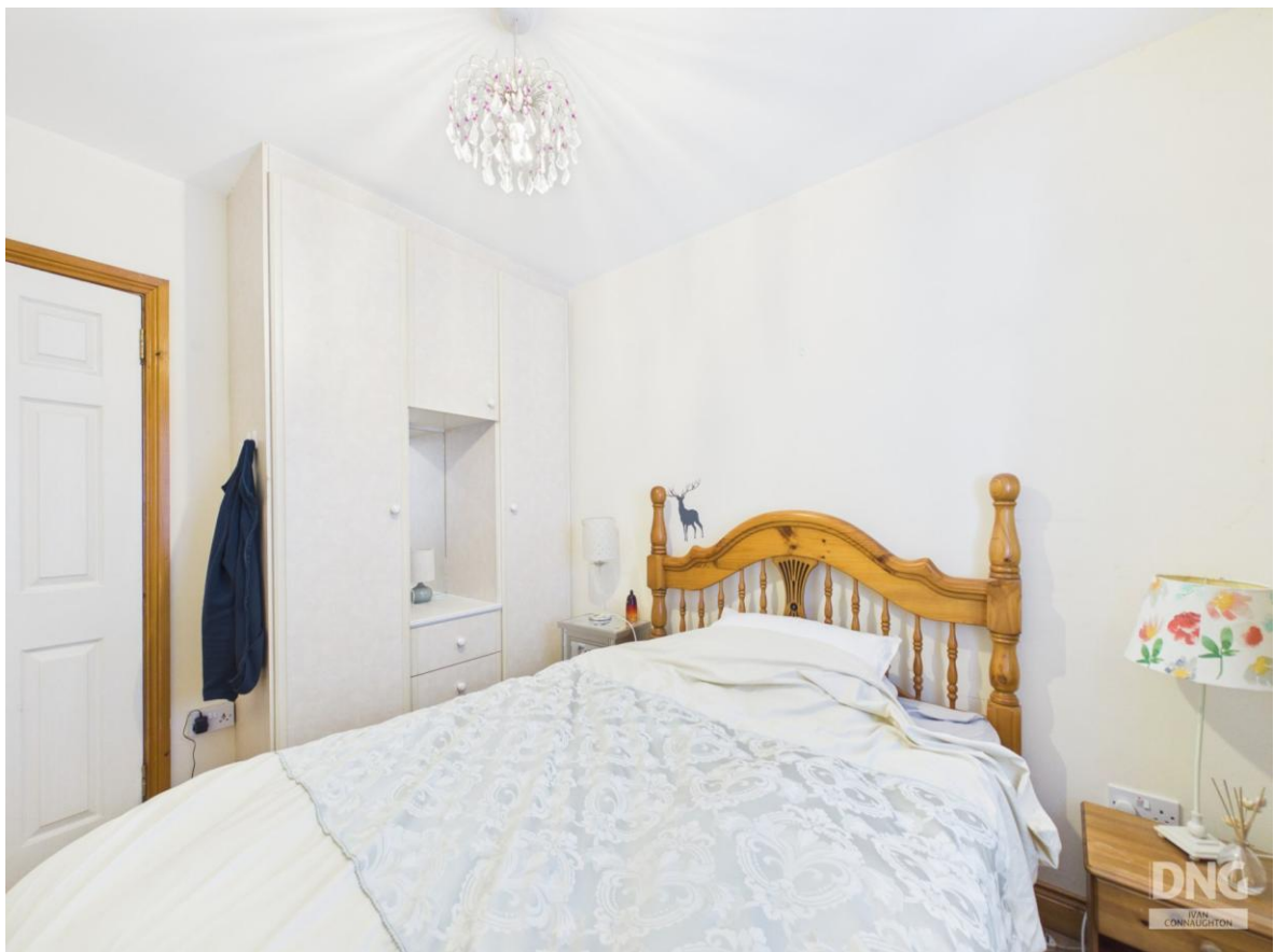
10 Quinn Villas, Ballaghaderreen, Co. Roscommon. F45 XE33