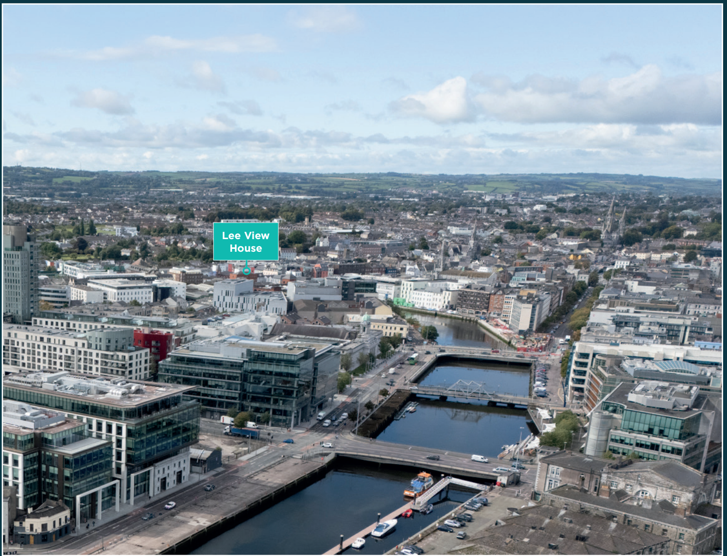
Lee View House