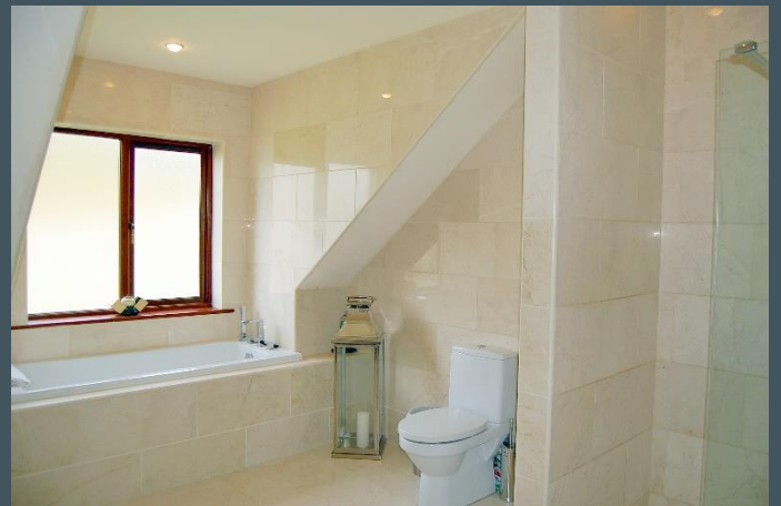
| Family Bathroom