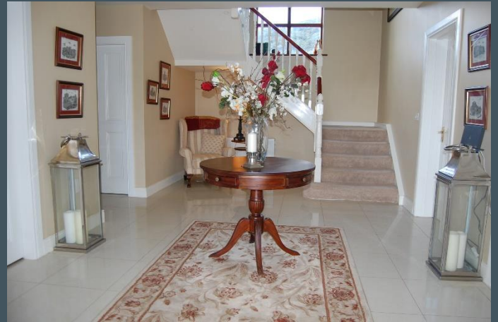
Bright Elegant Hall