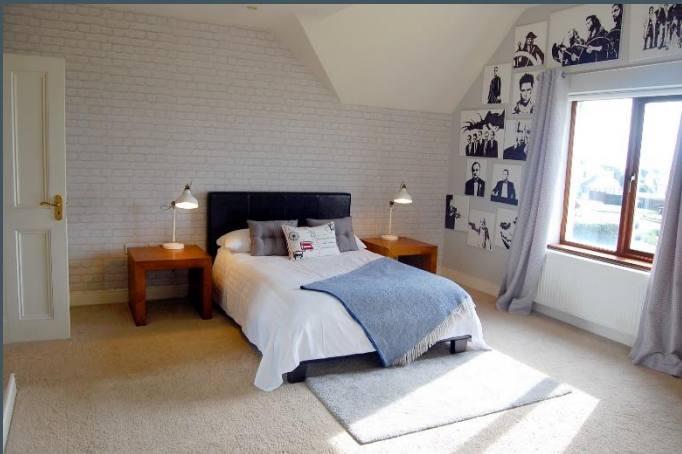
| Bedroom 4