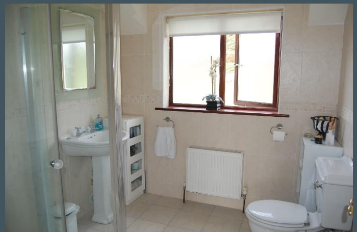
| En suite