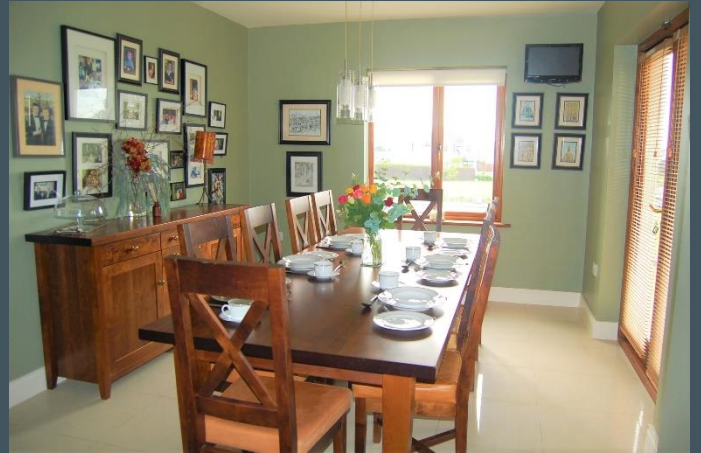
| Dining area