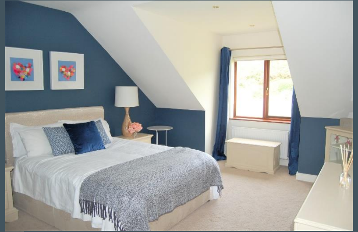
| Bedroom 3