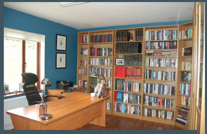
Home office / 5 th Bedroom