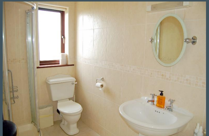
| En suite