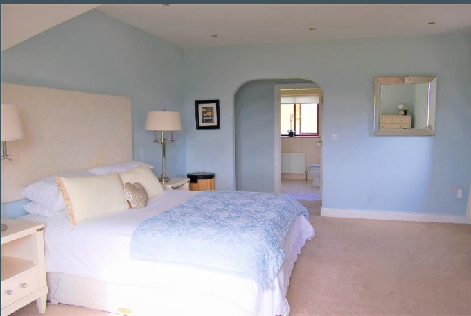
| Bedroom 1