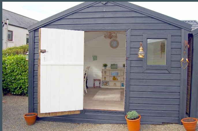
Serviced Garden House