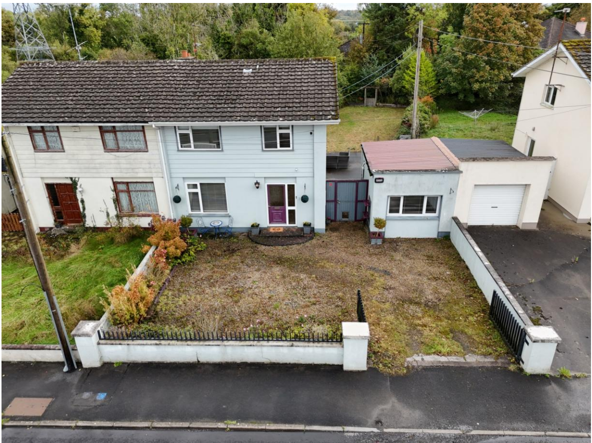
No. 3 Strokestown Road, Ballyleague, Co. Roscommon. N39 DE77