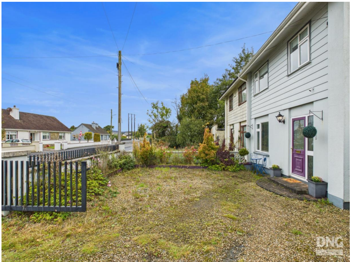
No. 3 Strokestown Road, Ballyleague, Co. Roscommon. N39 DE77