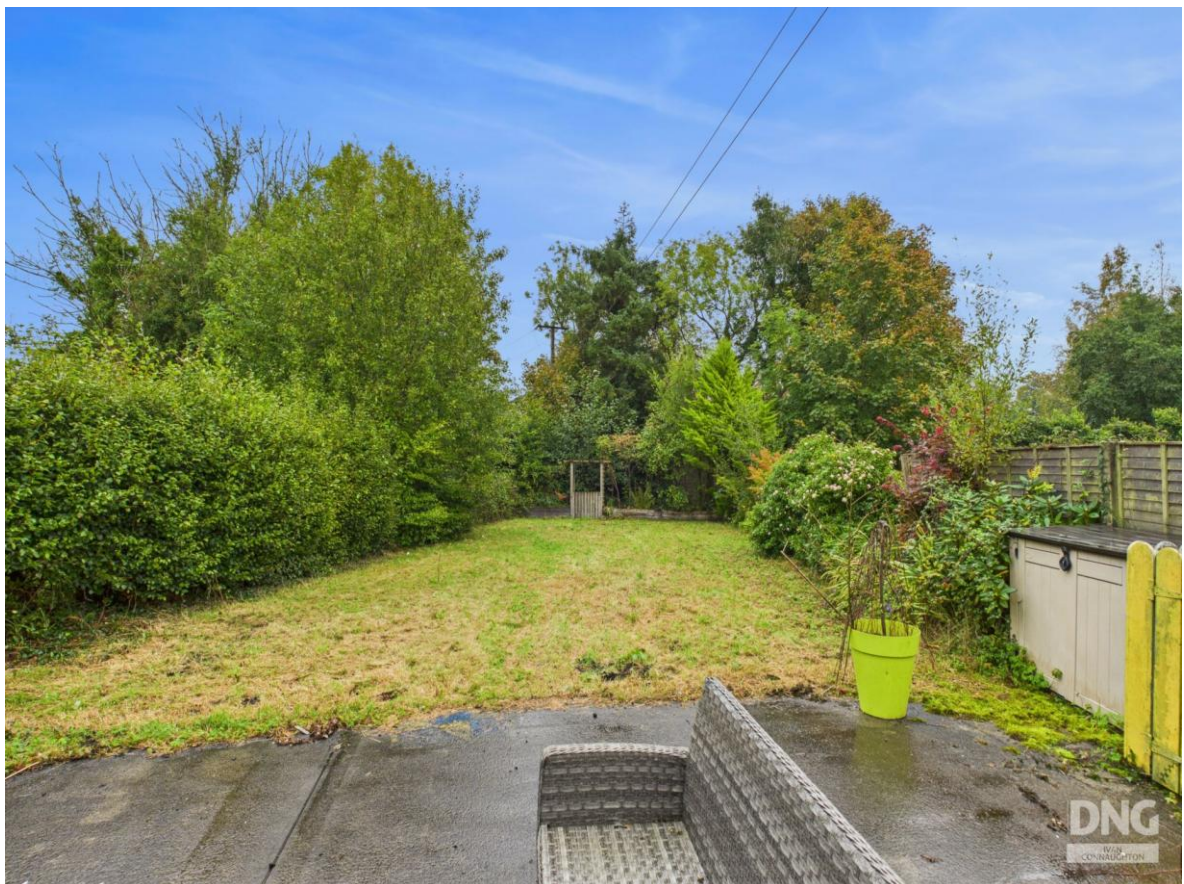
No. 3 Strokestown Road, Ballyleague, Co. Roscommon. N39 DE77