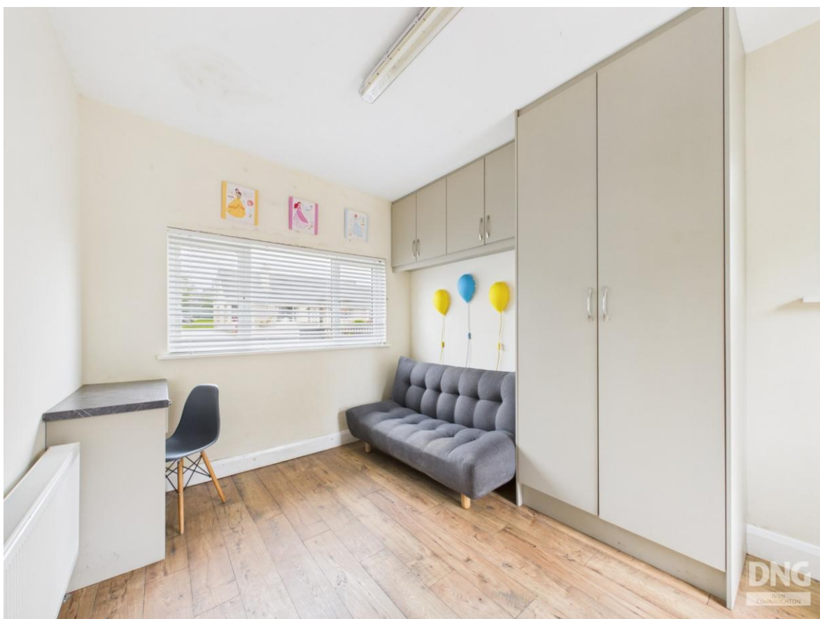
No. 3 Strokestown Road, Ballyleague, Co. Roscommon. N39 DE77