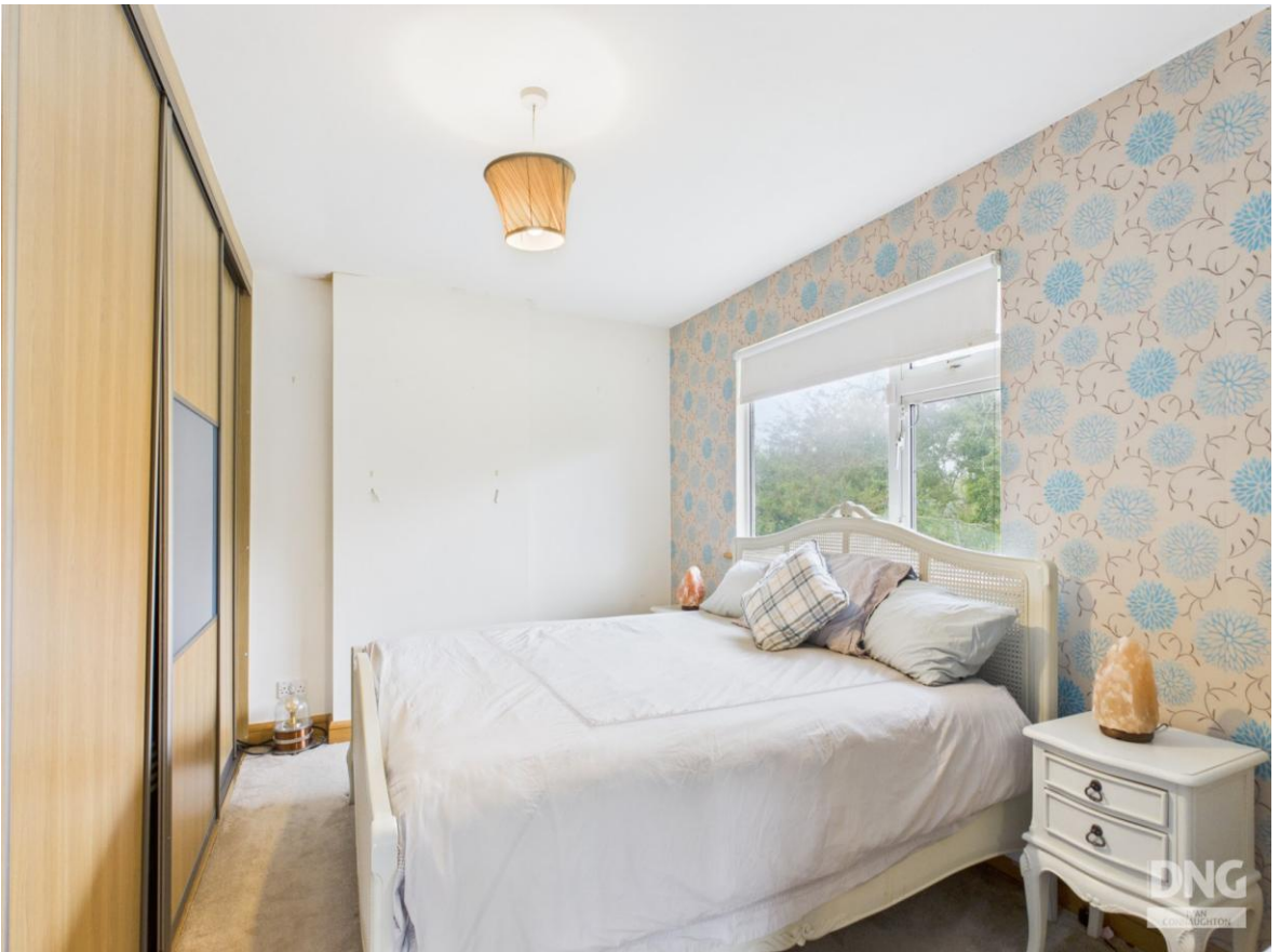
No. 3 Strokestown Road, Ballyleague, Co. Roscommon. N39 DE77