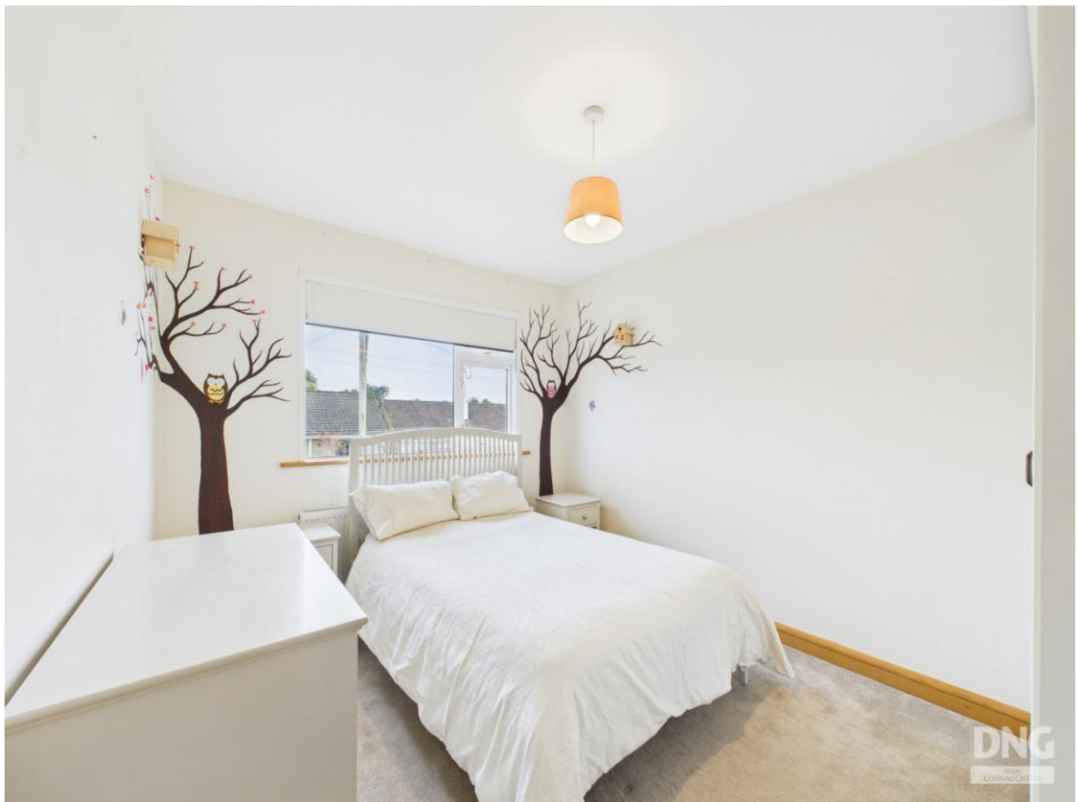
No. 3 Strokestown Road, Ballyleague, Co. Roscommon. N39 DE77