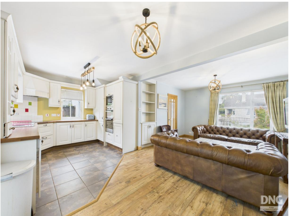
No. 3 Strokestown Road, Ballyleague, Co. Roscommon. N39 DE77