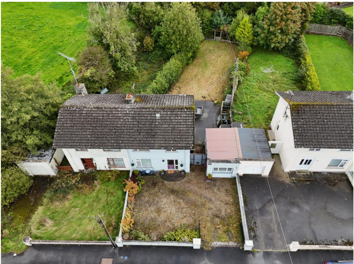
No. 3 Strokestown Road, Ballyleague, Co. Roscommon. N39 DE77