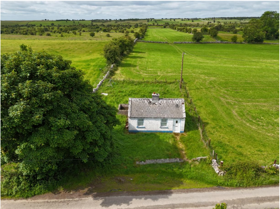
Turrock, Dysart, Co. Roscommon