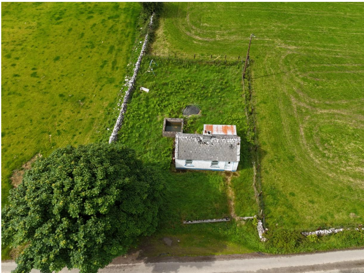
Turrock, Dysart, Co. Roscommon