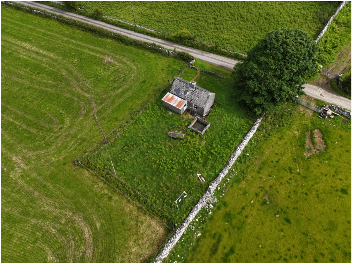
Turrock, Dysart, Co. Roscommon