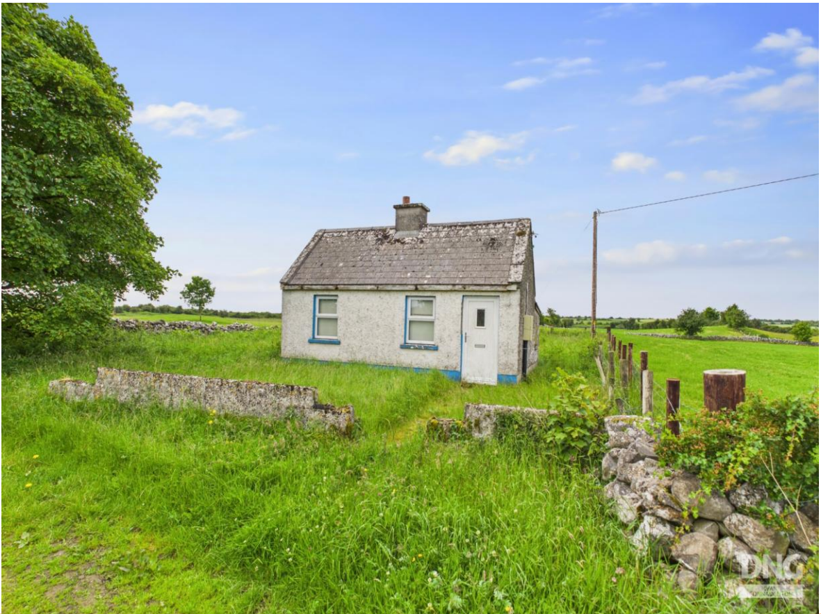
Turrock, Dysart, Co. Roscommon