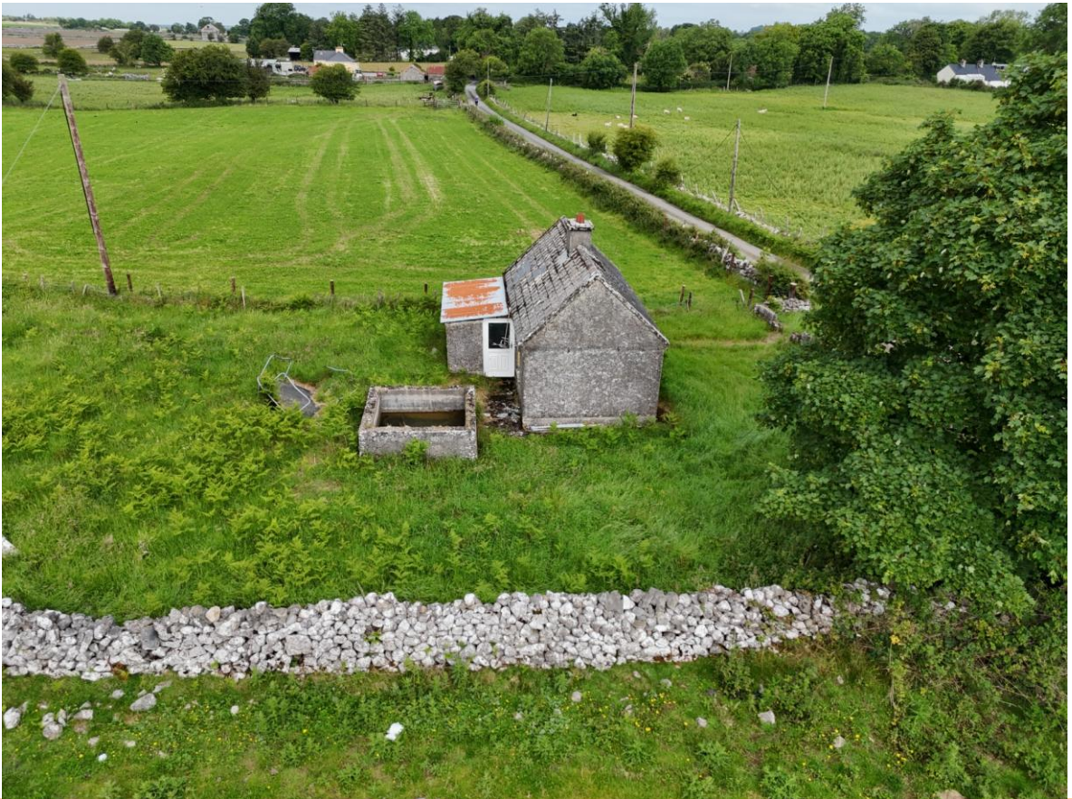
Turrock, Dysart, Co. Roscommon