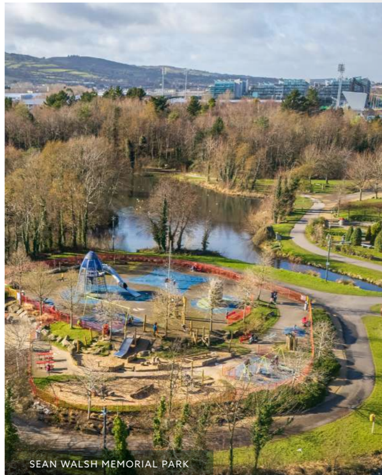
SEAN WALSH MEMORIAL PARK