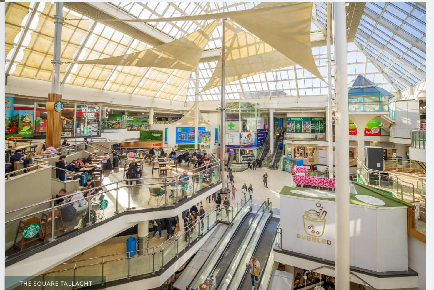
THE SQUARE TALLAGHT