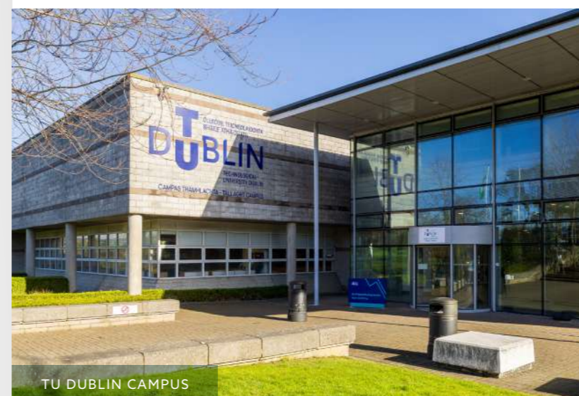
TU DUBLIN CAMPUS