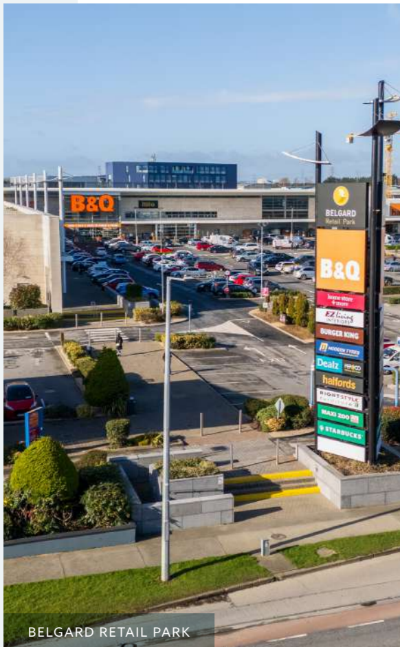
BELGARD RETAIL PARK