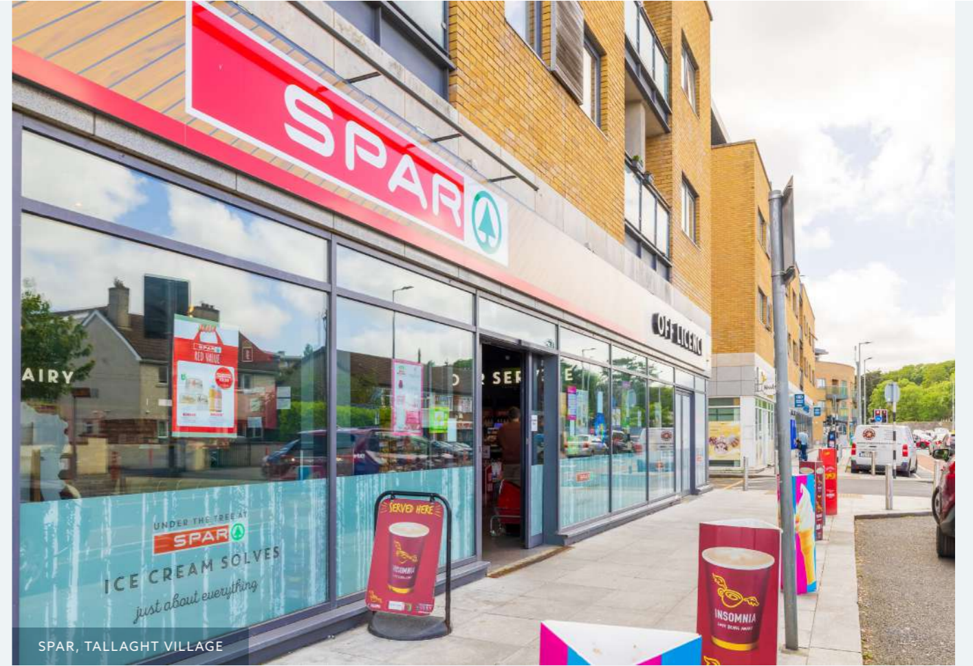
SPAR, TALLAGHT VILLAGE