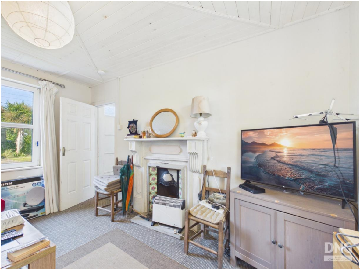
Residence On C. 0.67 Acres, Moneymore, Knockcroghery, Co. Roscommon, F42 YE28