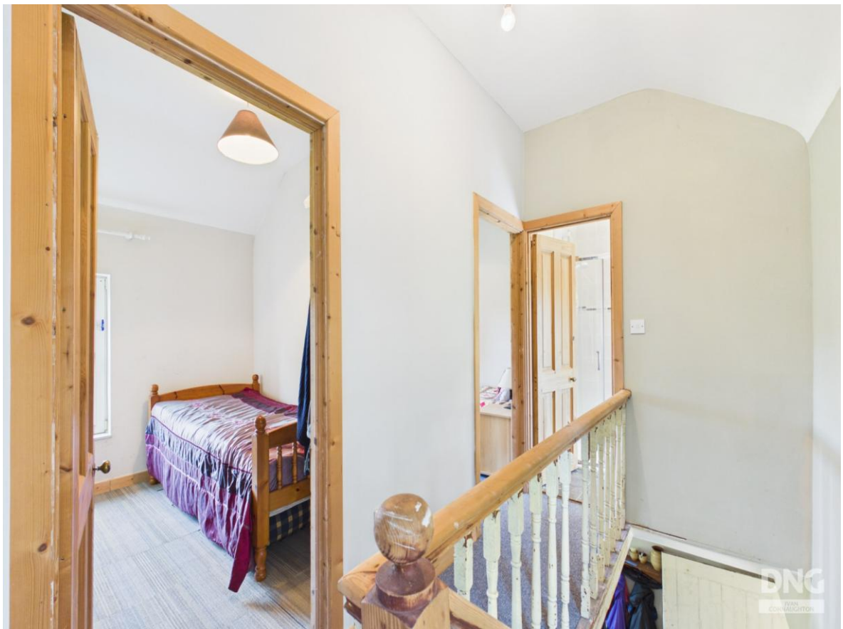
Residence On C. 0.67 Acres, Moneymore, Knockcroghery, Co. Roscommon, F42 YE28