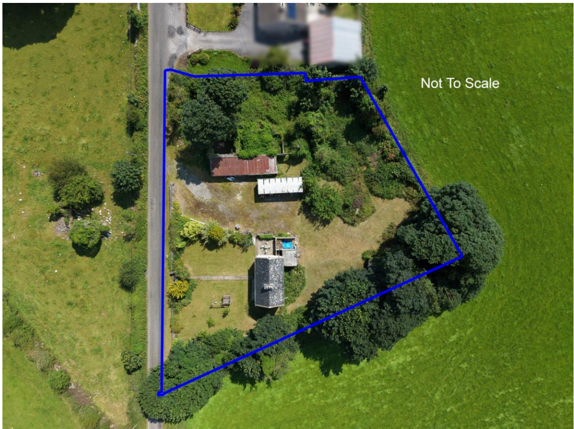
Residence On C. 0.67 Acres, Moneymore, Knockcroghery, Co. Roscommon, F42 YE28