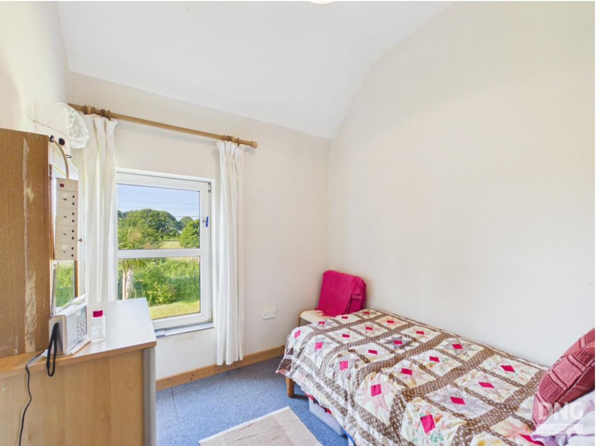
Residence On C. 0.67 Acres, Moneymore, Knockcroghery, Co. Roscommon, F42 YE28