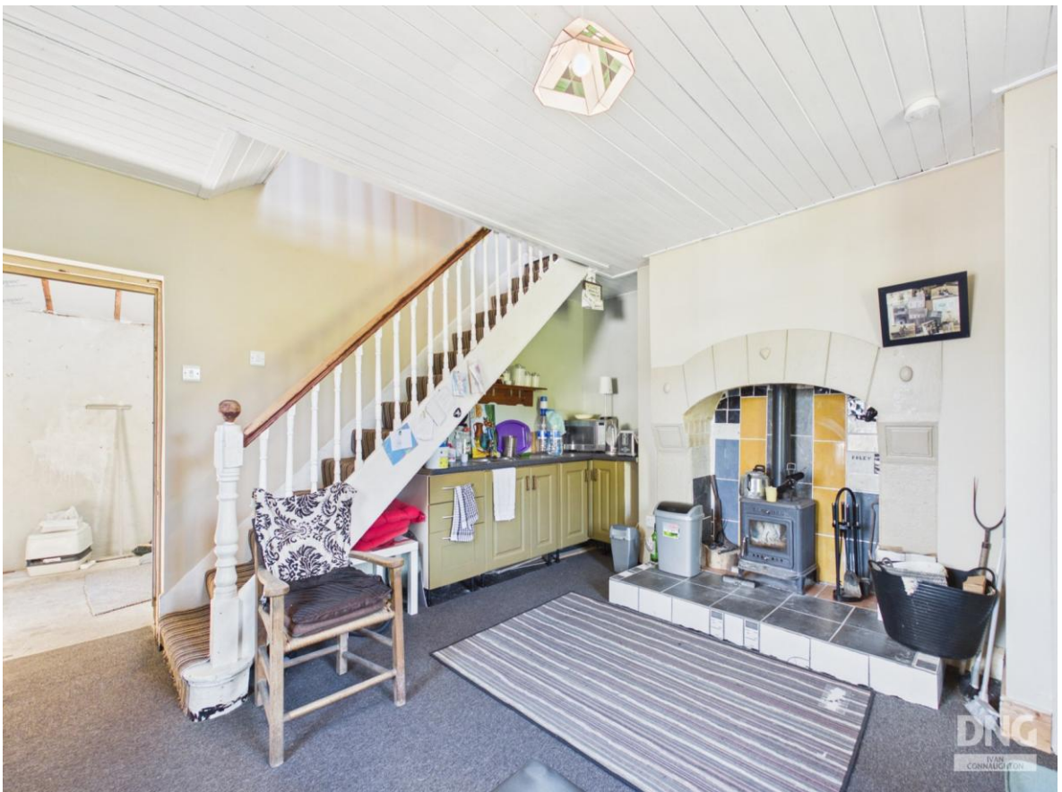
Residence On C. 0.67 Acres, Moneymore, Knockcroghery, Co. Roscommon, F42 YE28