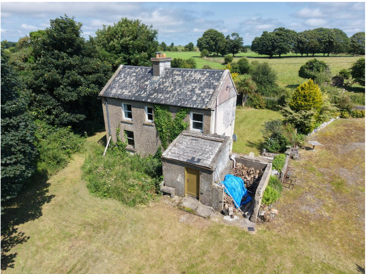
Residence On C. 0.67 Acres, Moneymore, Knockcroghery, Co. Roscommon, F42 YE28