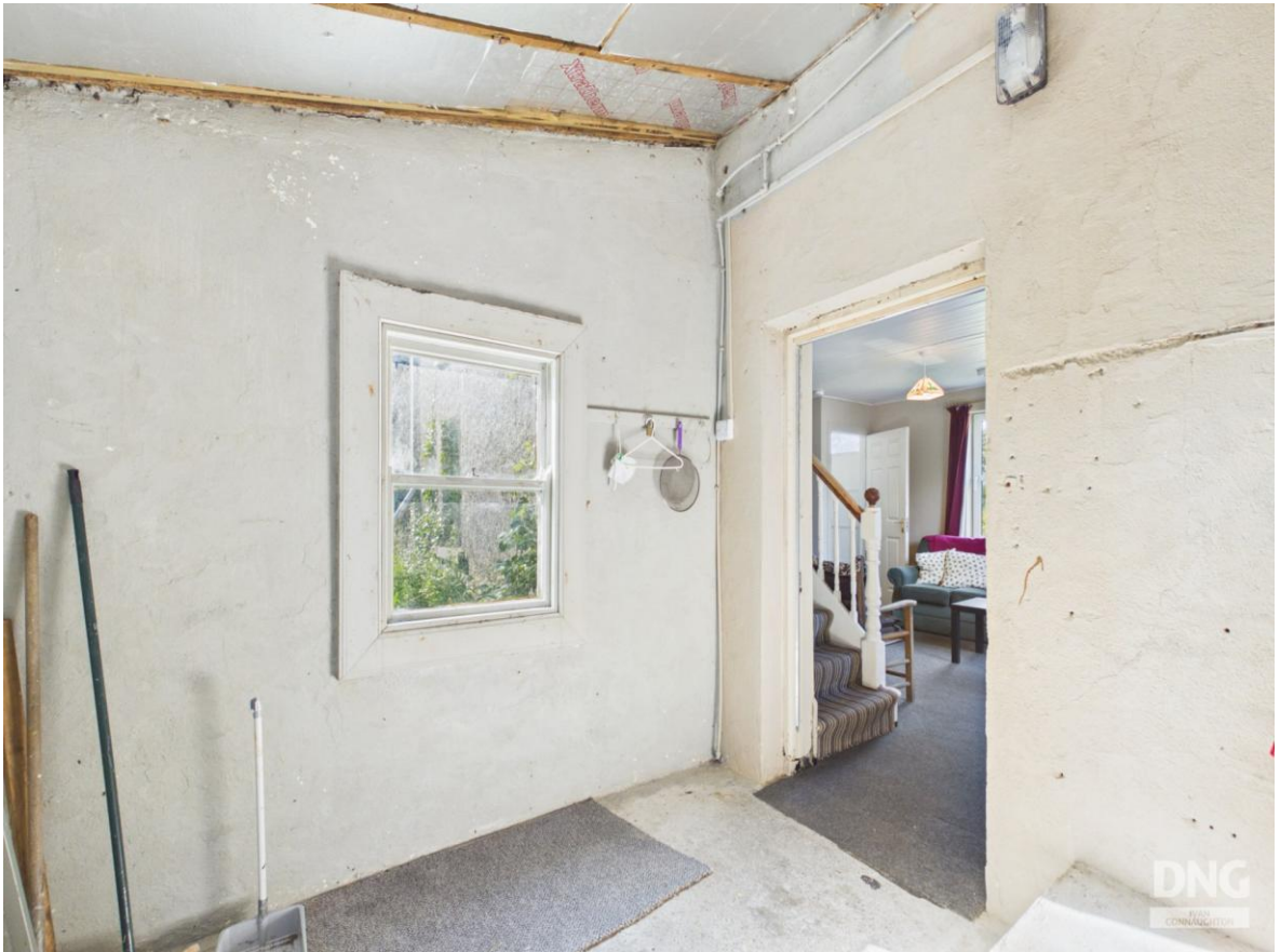
Residence On C. 0.67 Acres, Moneymore, Knockcroghery, Co. Roscommon, F42 YE28