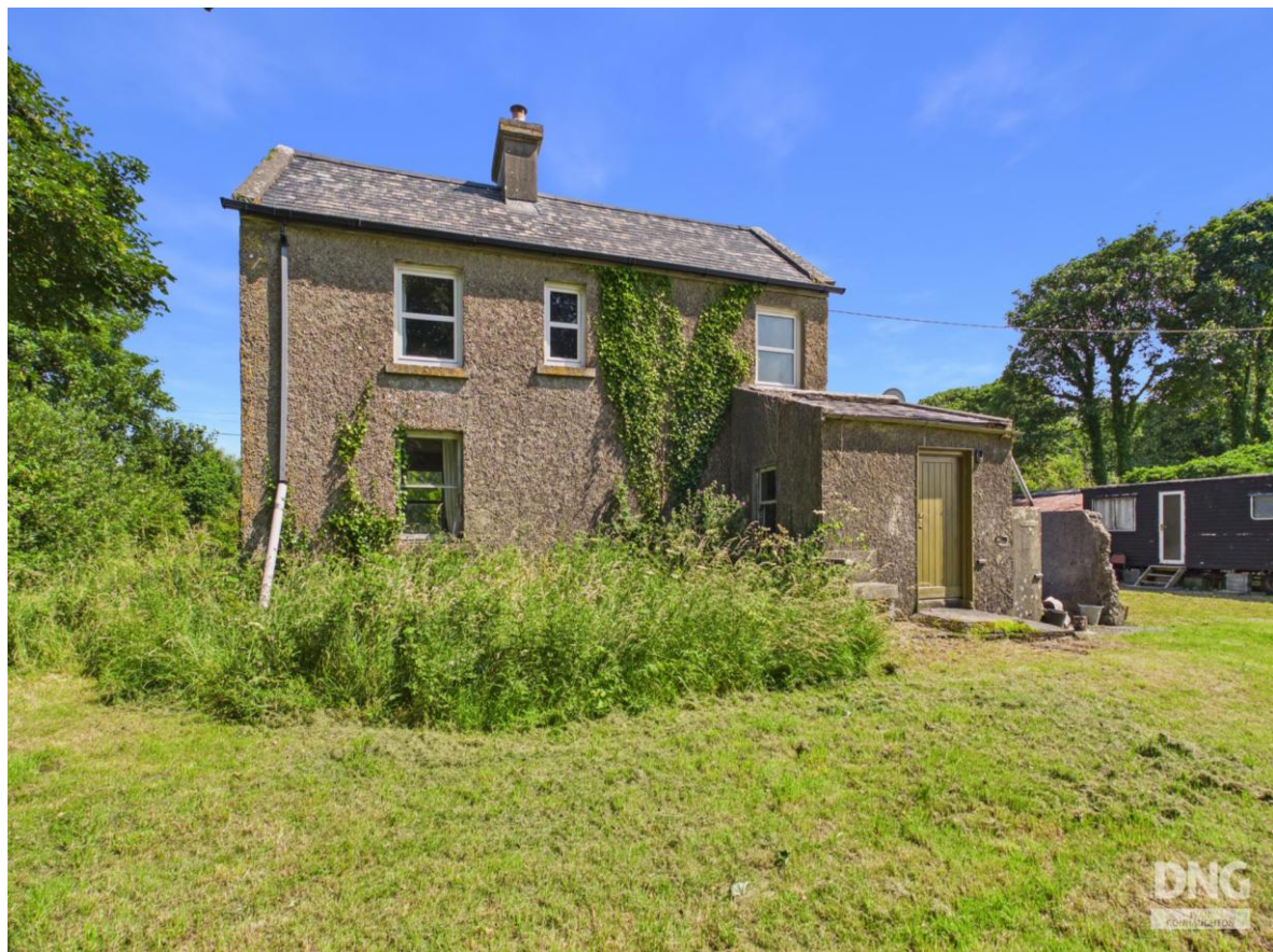
Residence On C. 0.67 Acres, Moneymore, Knockcroghery, Co. Roscommon, F42 YE28