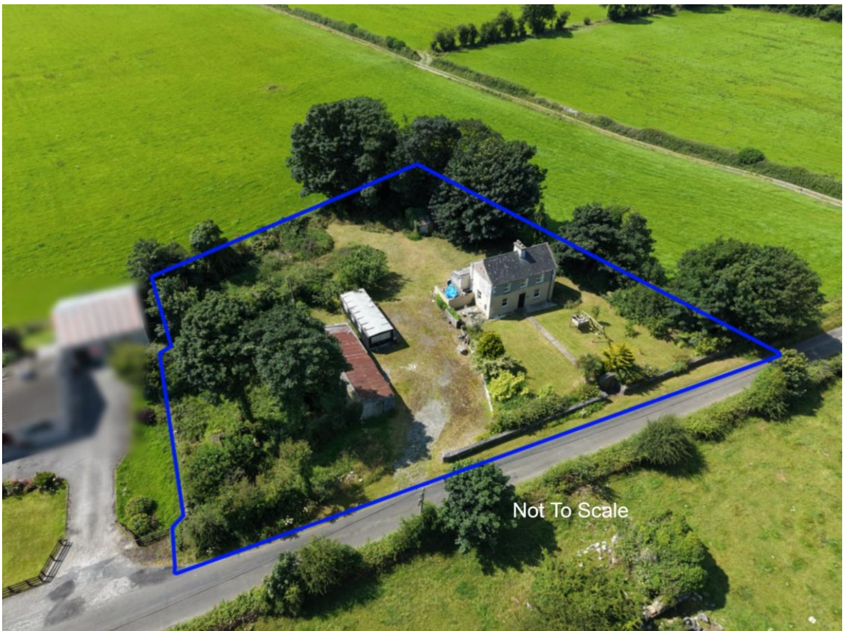
Residence On C. 0.67 Acres, Moneymore, Knockcroghery, Co. Roscommon, F42 YE28