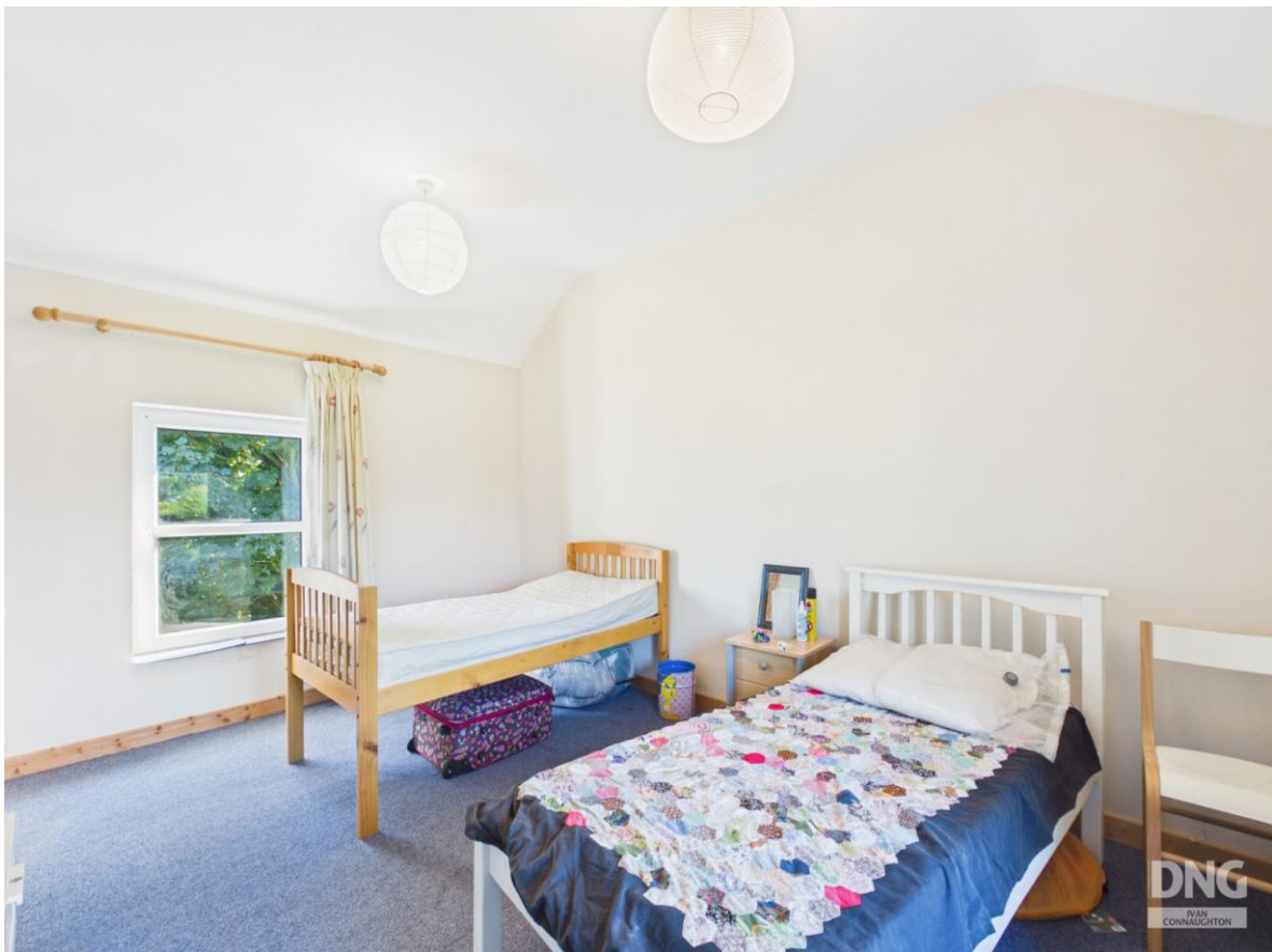
Residence On C. 0.67 Acres, Moneymore, Knockcroghery, Co. Roscommon, F42 YE28