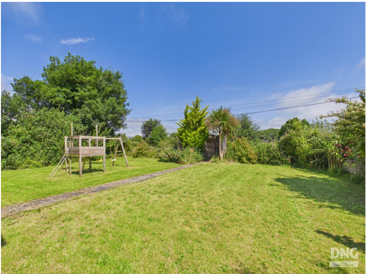
Residence On C. 0.67 Acres, Moneymore, Knockcroghery, Co. Roscommon, F42 YE28