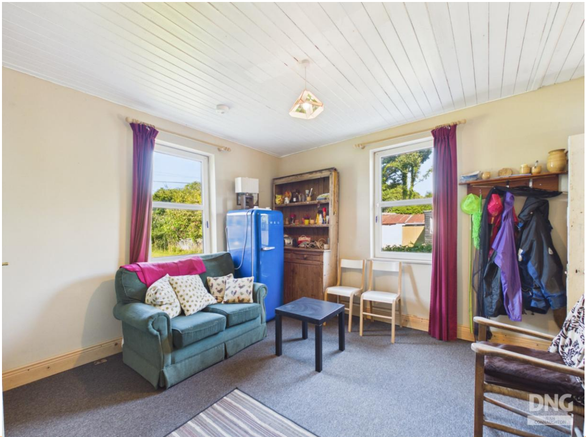
Residence On C. 0.67 Acres, Moneymore, Knockcroghery, Co. Roscommon, F42 YE28