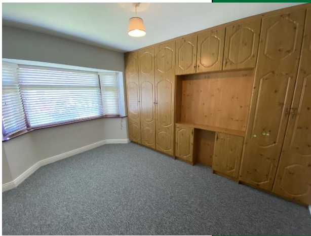
Bedroom 1 : Single with built in wardrobes