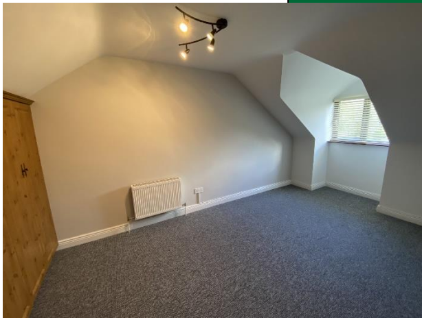
Bedroom 4 : Double with built in wardrobes