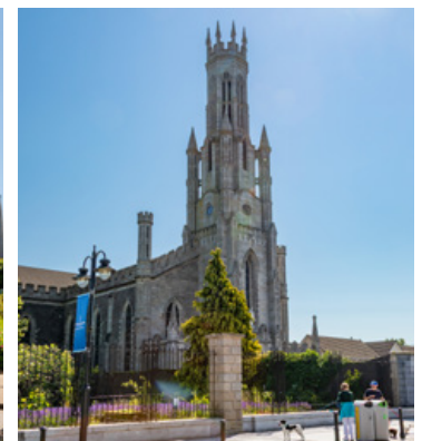
Hadden's Centre, Tullow Street, Carlow