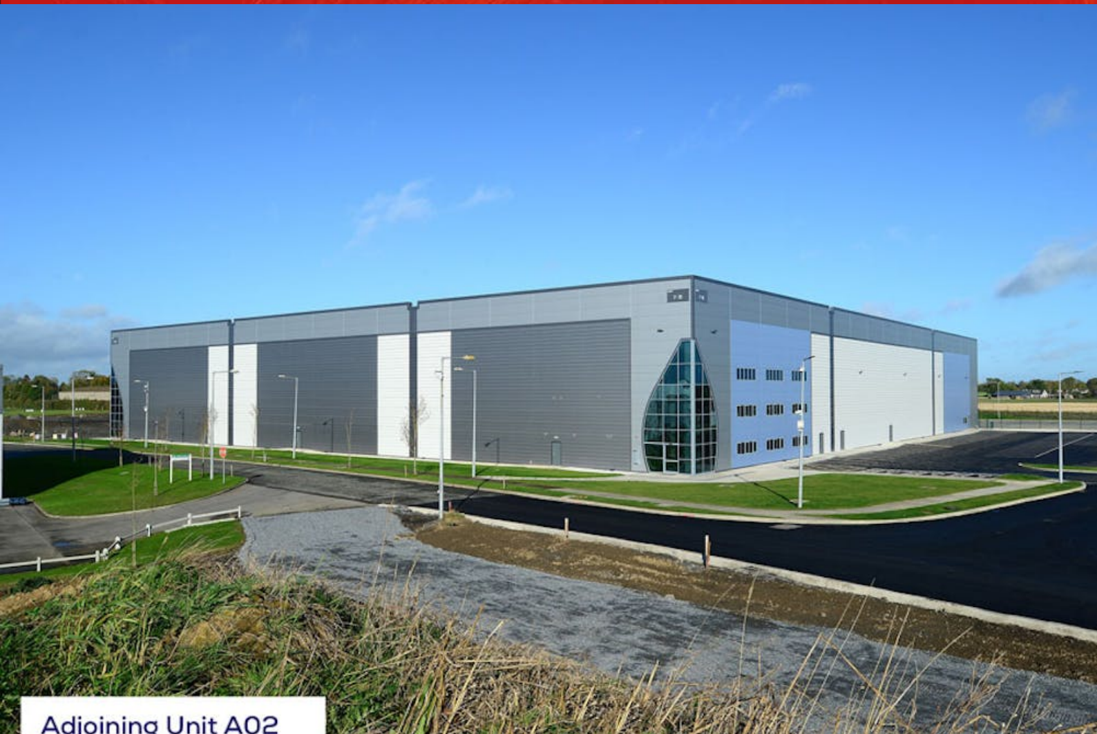
Adjoining Unit A02