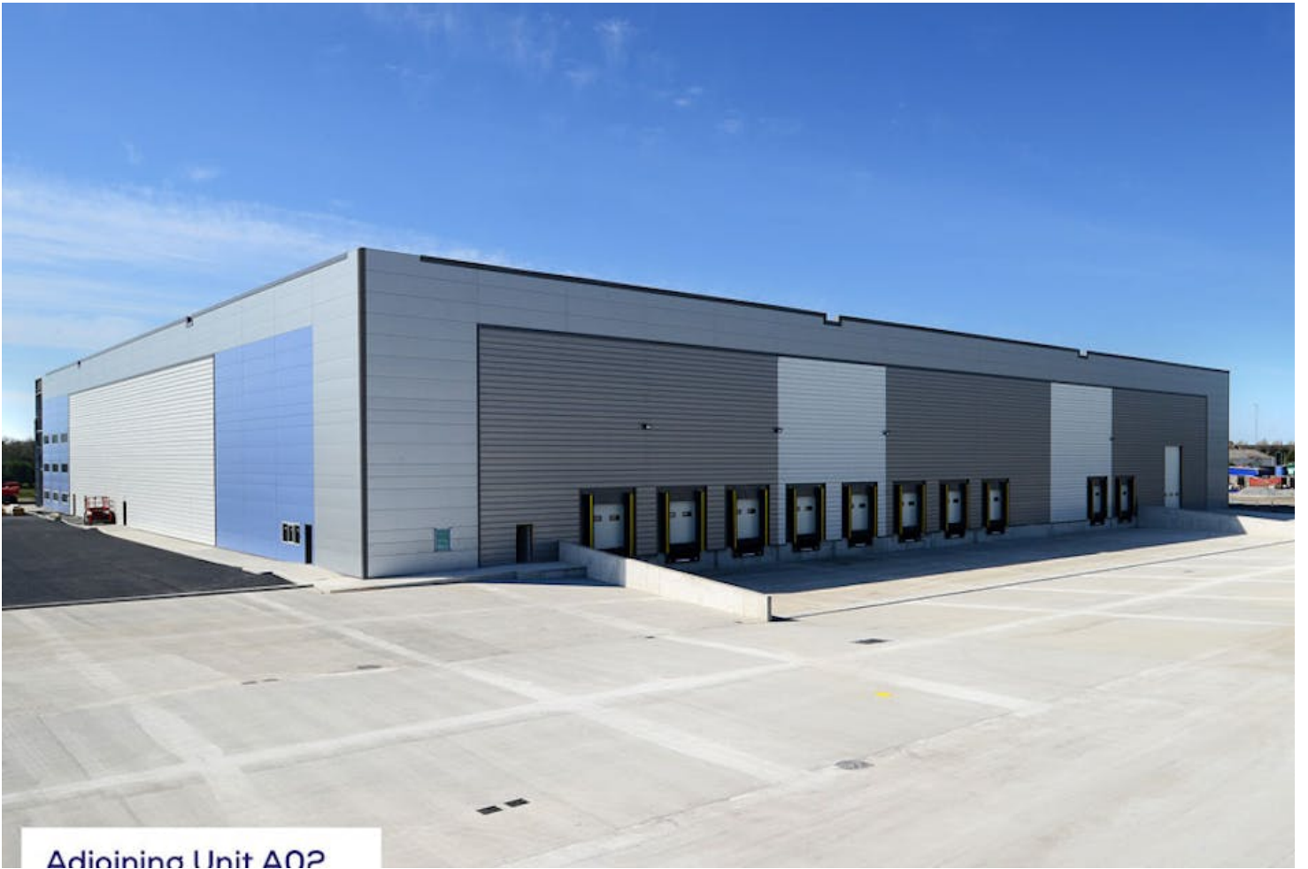
Adjoining Unit A02