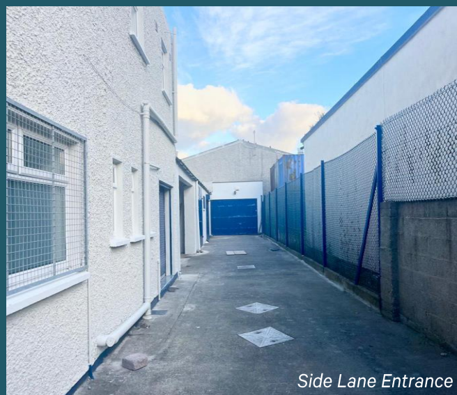
Side Lane Entrance