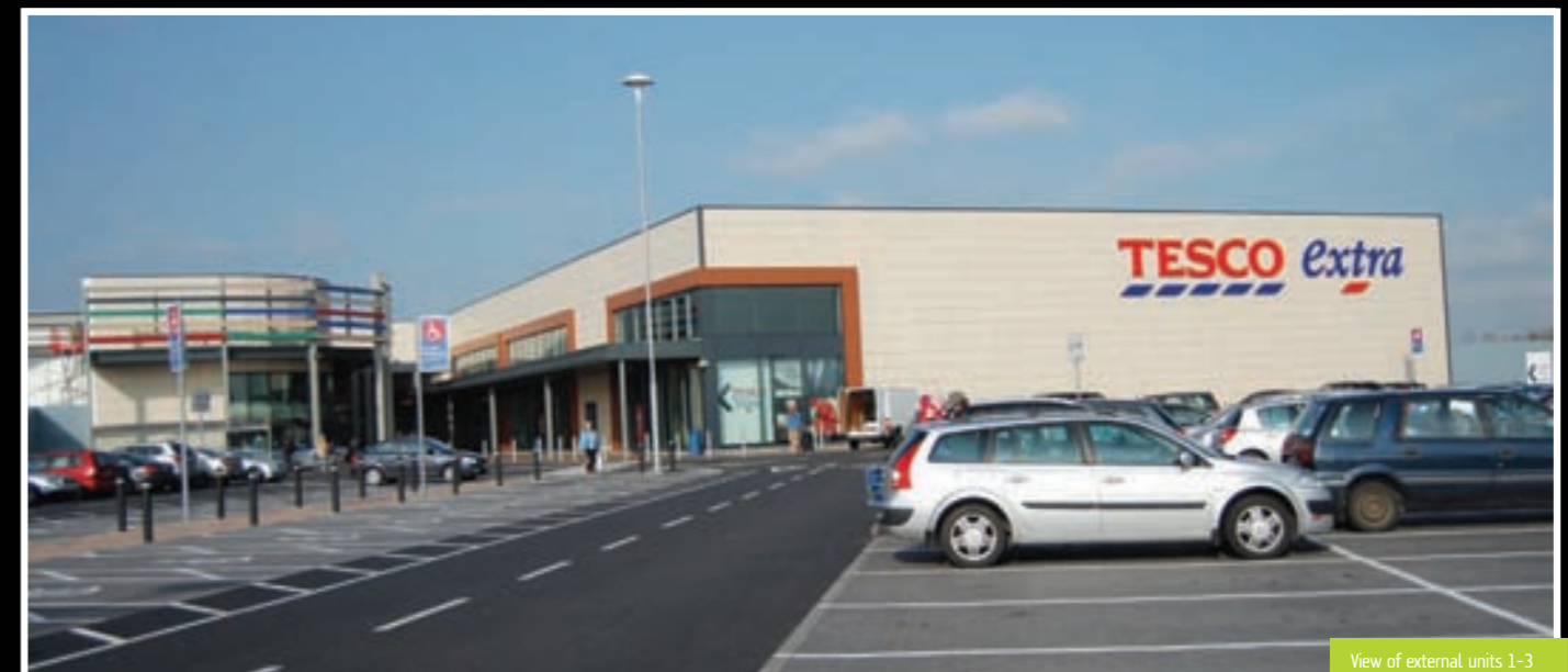
View of external units 1-3