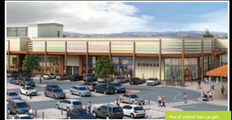
View of scheme from car park

In addition it will comprise of approximately 425 sq m of office accommodation.