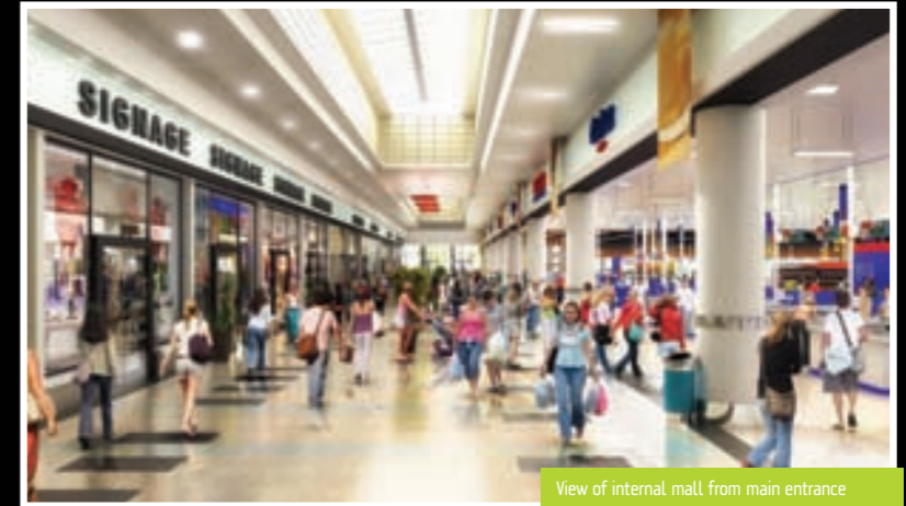
View of internal mall from main entrance

The scheme will be provided to the highest standard of design and will represent a retail experience that will delight customers and surpass expectations.