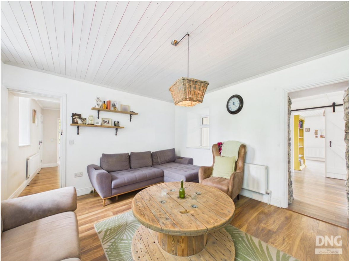
Residence on c. 5.26 Acres, Gorteenclough Or Corra More, Athleague, F42 HK35