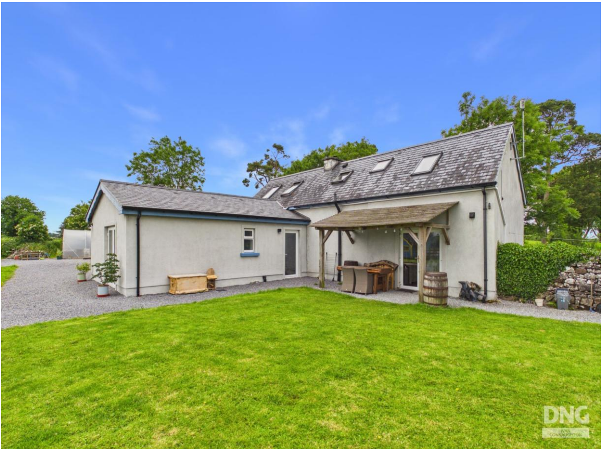
Residence on c. 5.26 Acres, Gorteenclough Or Corra More, Athleague, F42 HK35