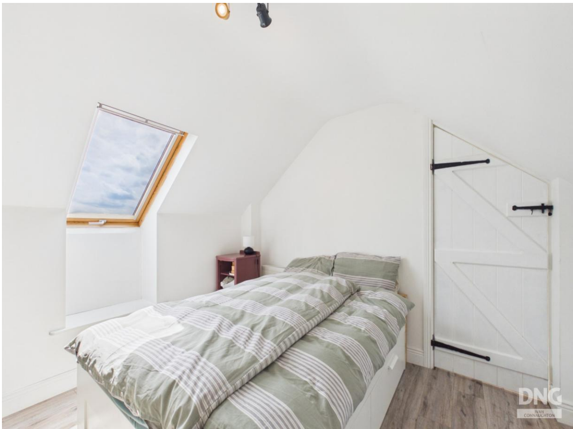
Residence on c. 5.26 Acres, Gortencloagh Or Corra More, Athleague, F42 HK35