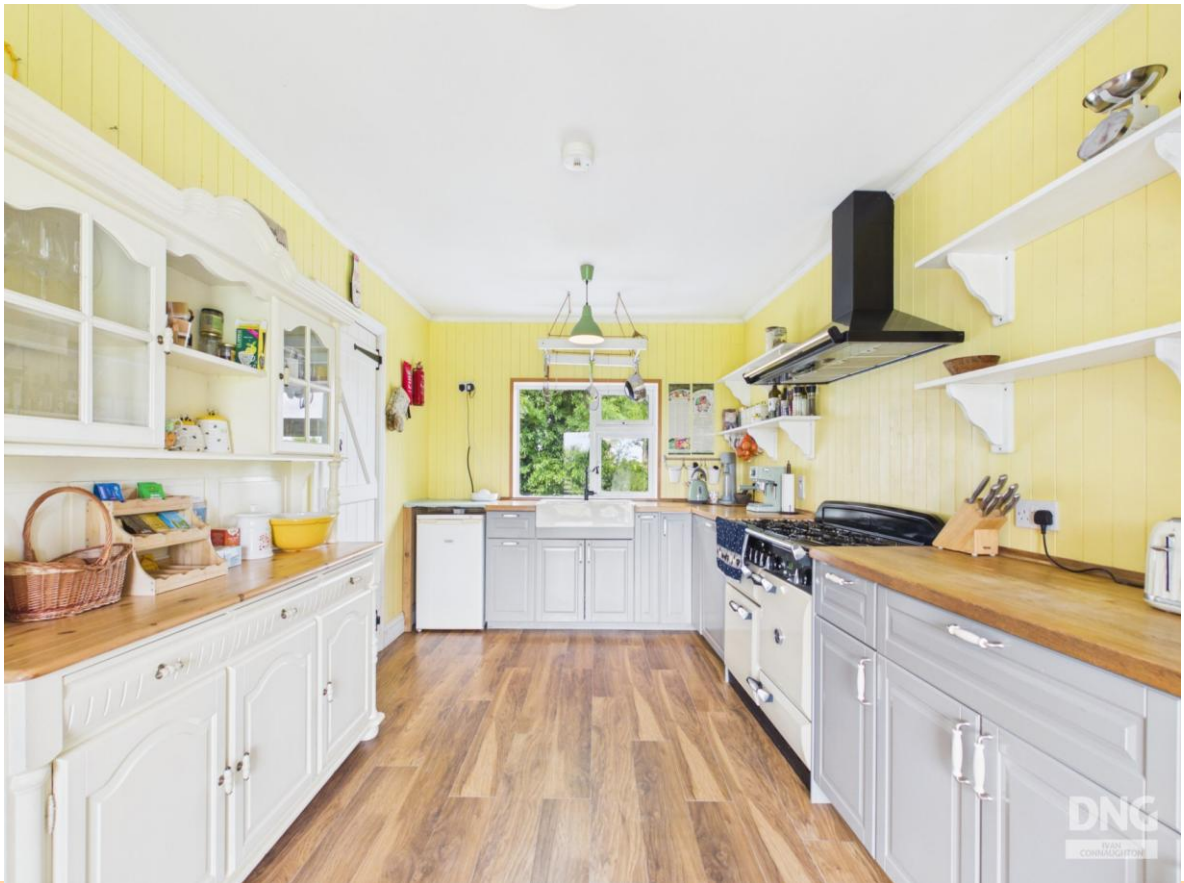
Residence on c. 5.26 Acres, Gortencloagh Or Corra More, Athleague, F42 HK35