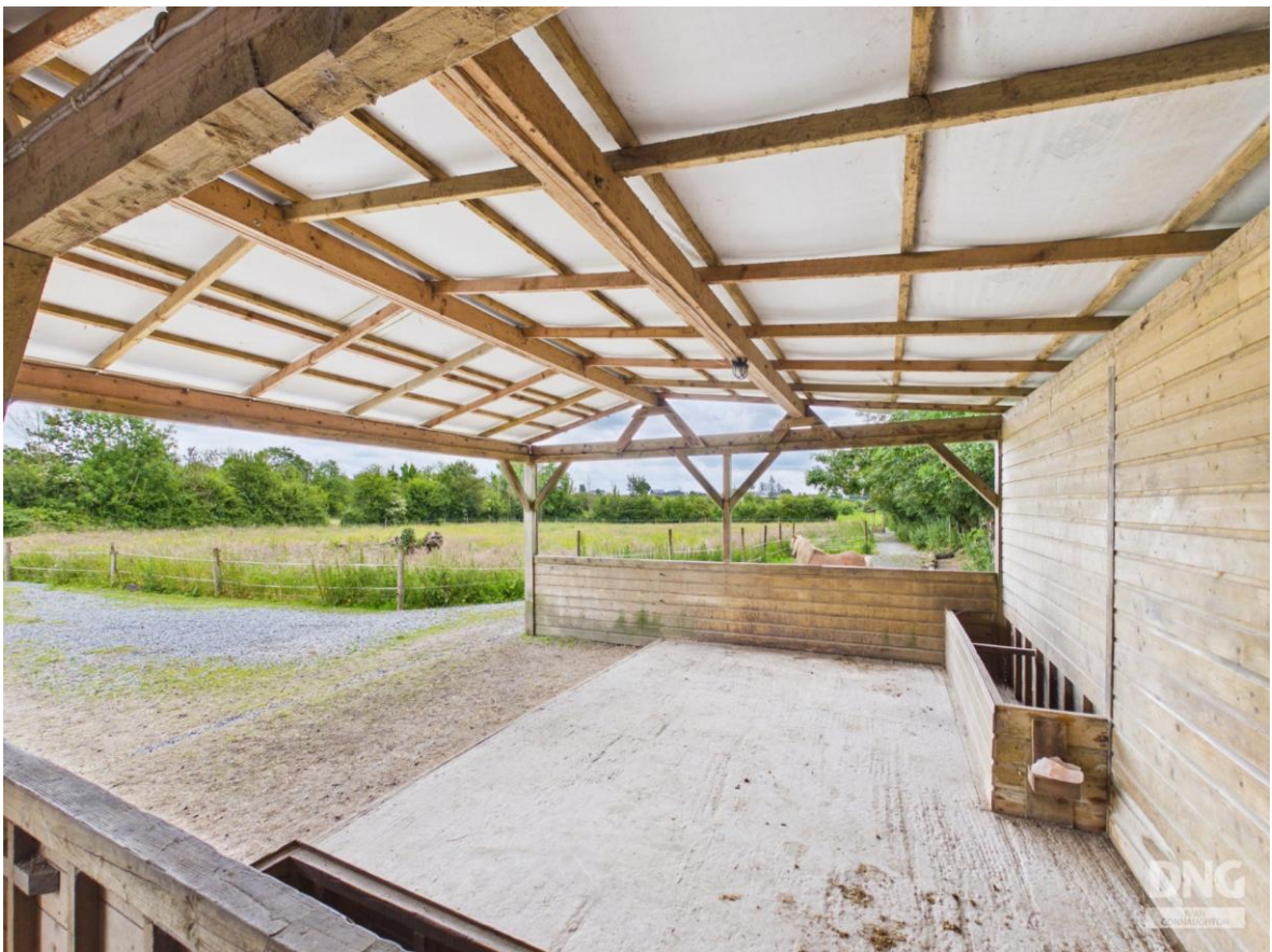
Residence on c. 5.26 Acres, Gortencloogh Or Corra More, Athleague, F42 HK35