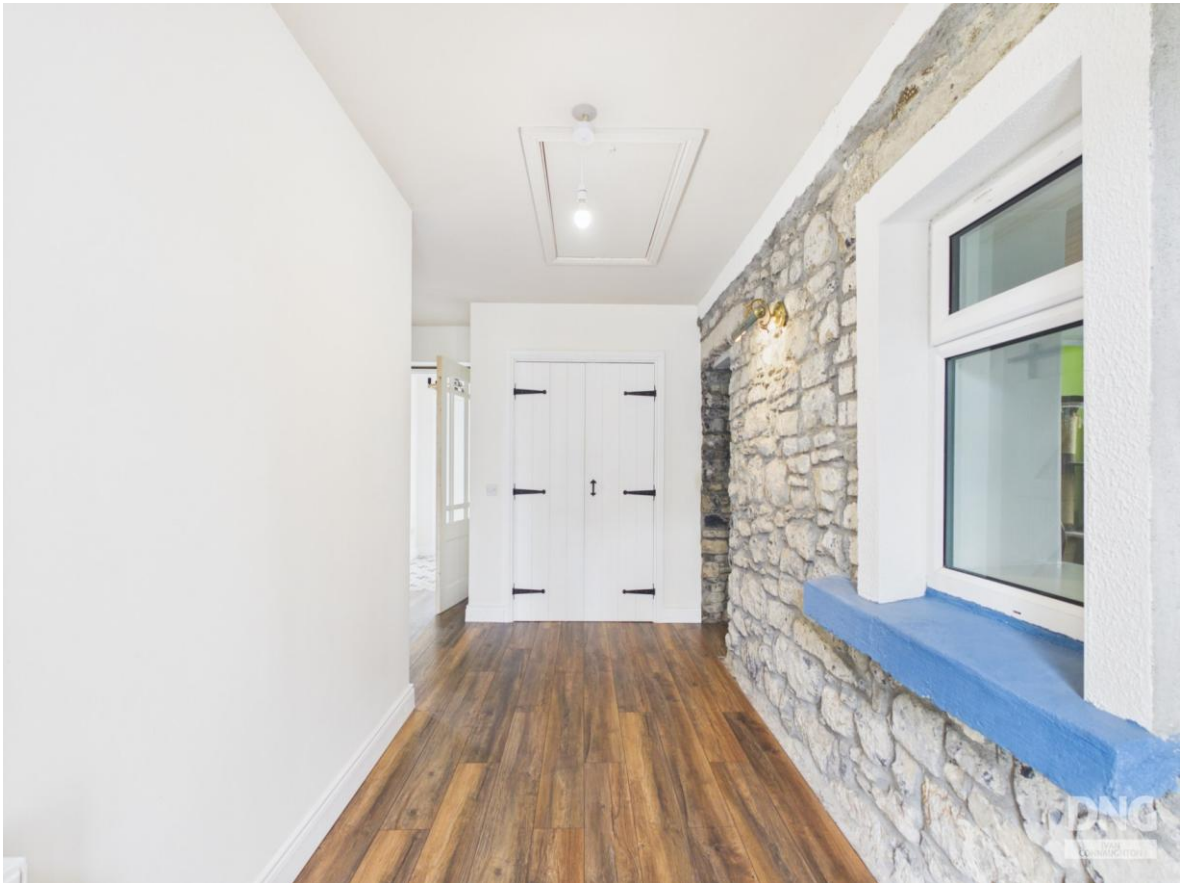
Residence on c. 5.26 Acres, Gorteenclough Or Corra More, Athleague, F42 HK35