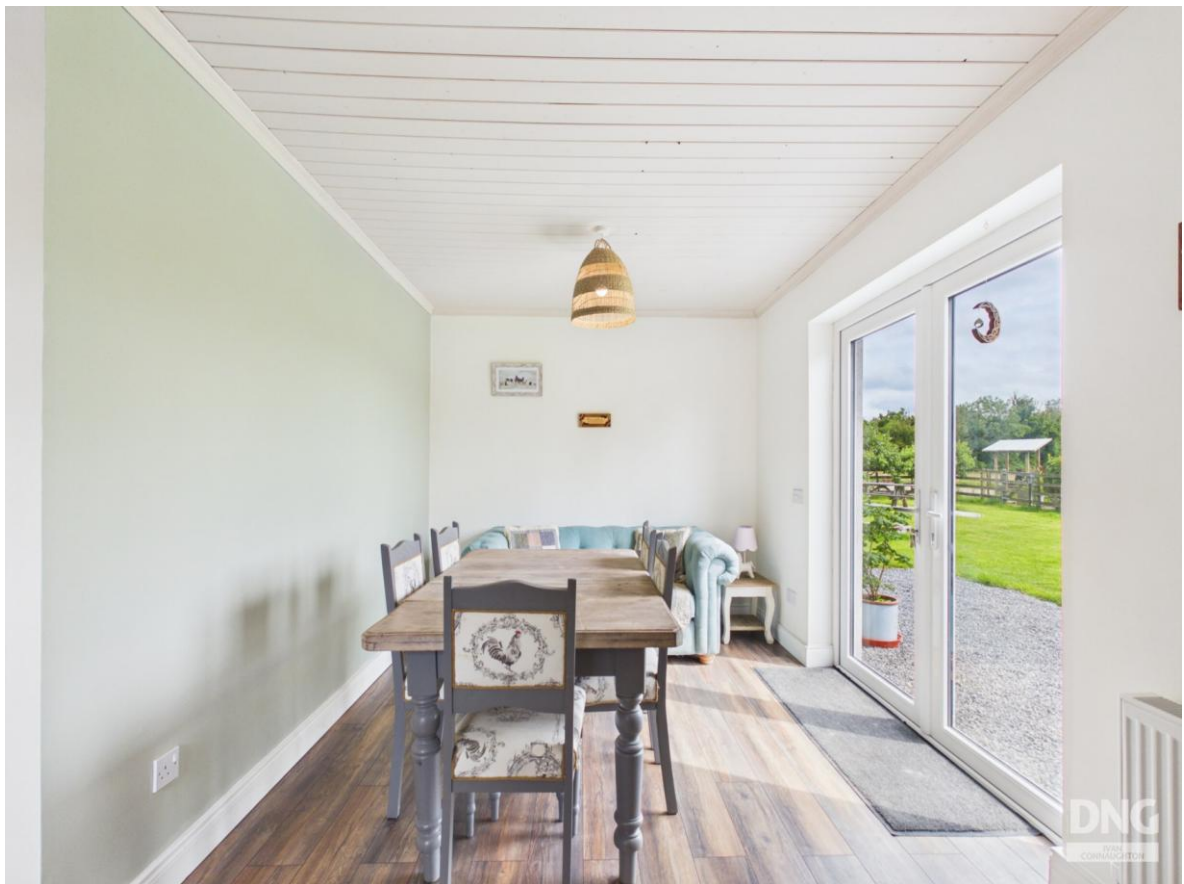
Residence on c. 5.26 Acres, Gortencloogh Or Corra More, Athleague, F42 HK35