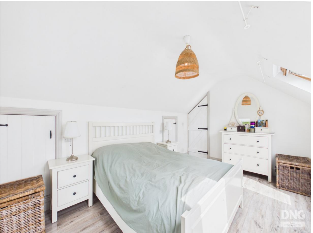
Residence on c. 5.26 Acres, Gortencloogh Or Corra More, Athleague, F42 HK35