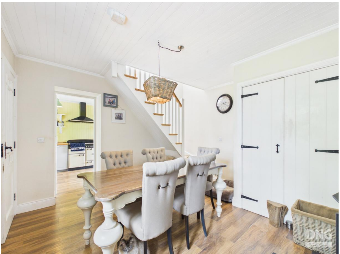
Residence on c. 5.26 Acres, Gortencloogh Or Corra More, Athleague, F42 HK35