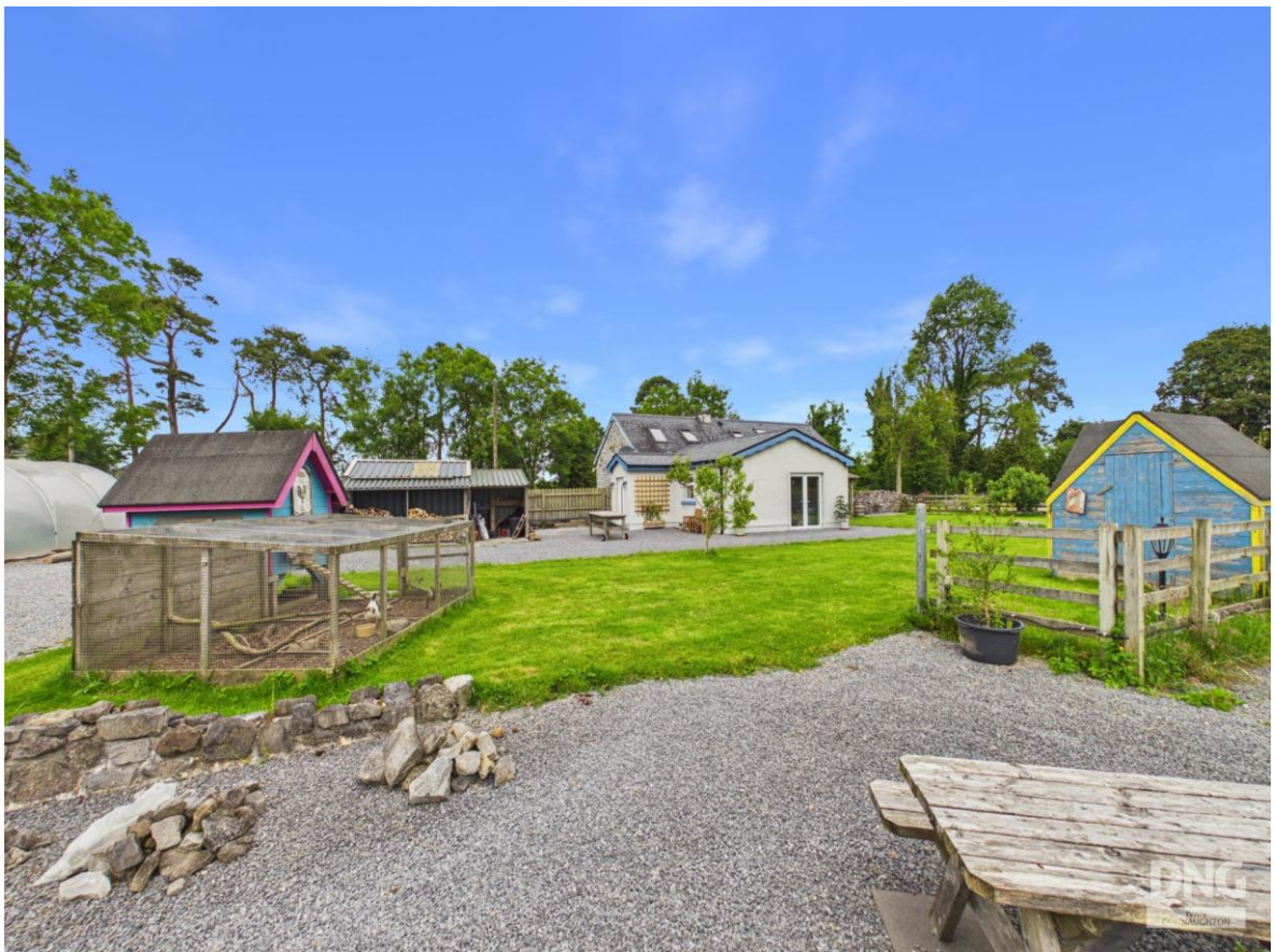
Residence on c. 5.26 Acres, Gortencloogh Or Corra More, Athleague, F42 HK35