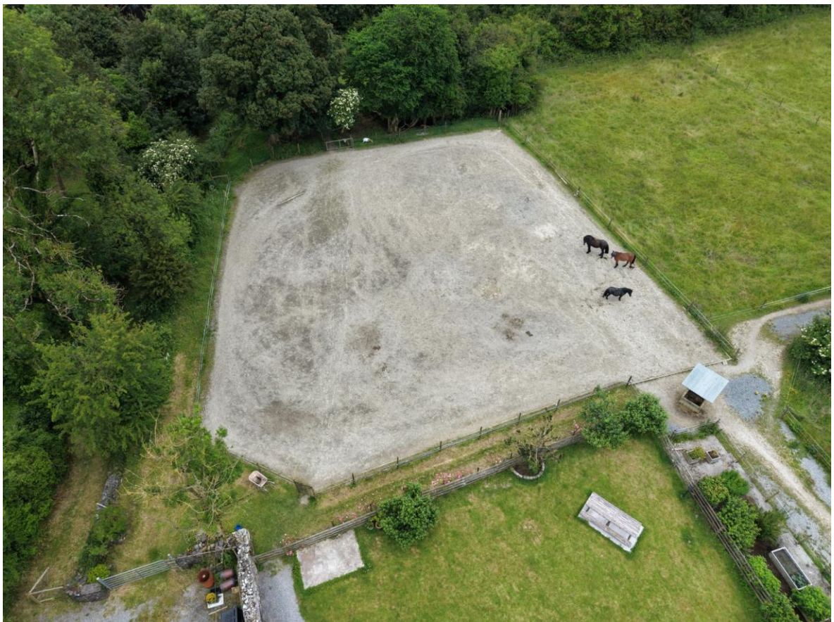
Residence on c. 5.26 Acres, Gortencloagh Or Corra More, Athleague, F42 HK35