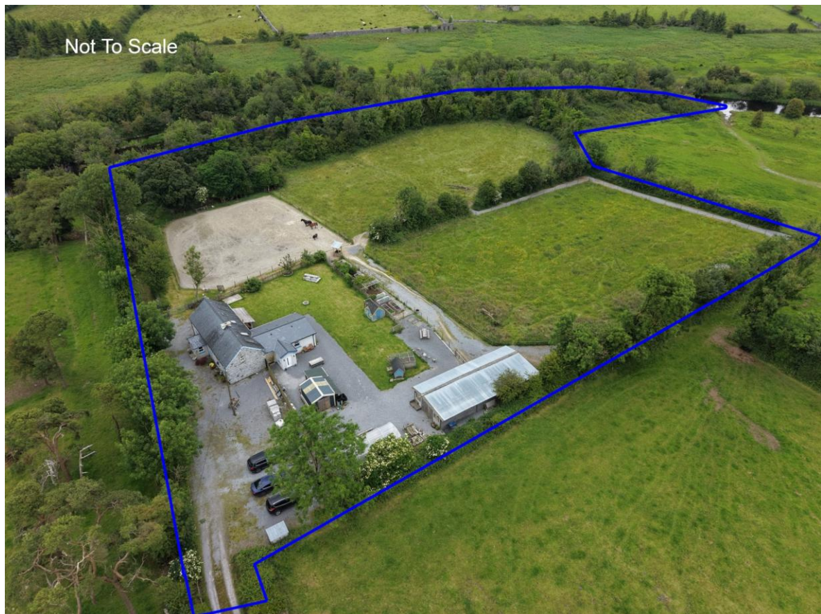
Residence on c. 5.26 Acres, Gortencloogh Or Corra More, Athleague, F42 HK35