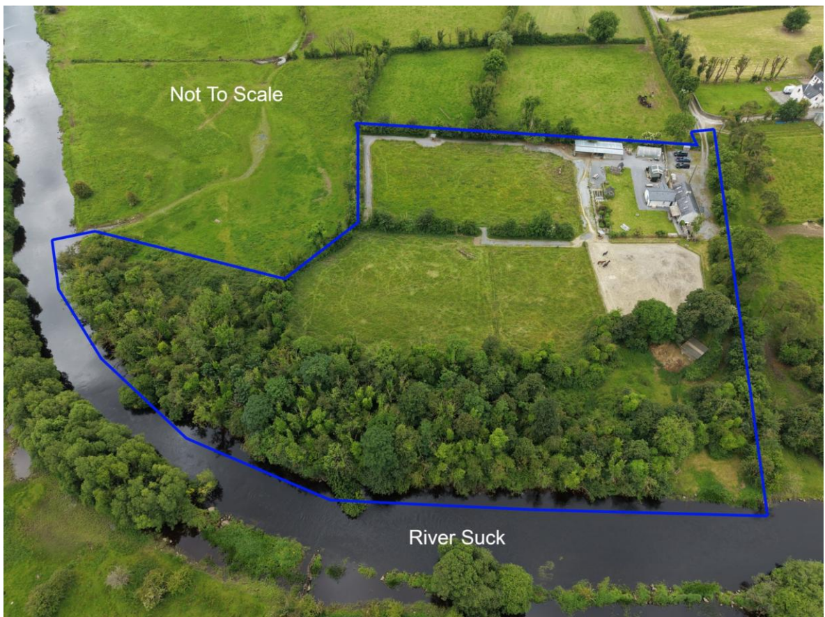
Residence on c. 5.26 Acres, Gortencloogh Or Corra More, Athleague, F42 HK35