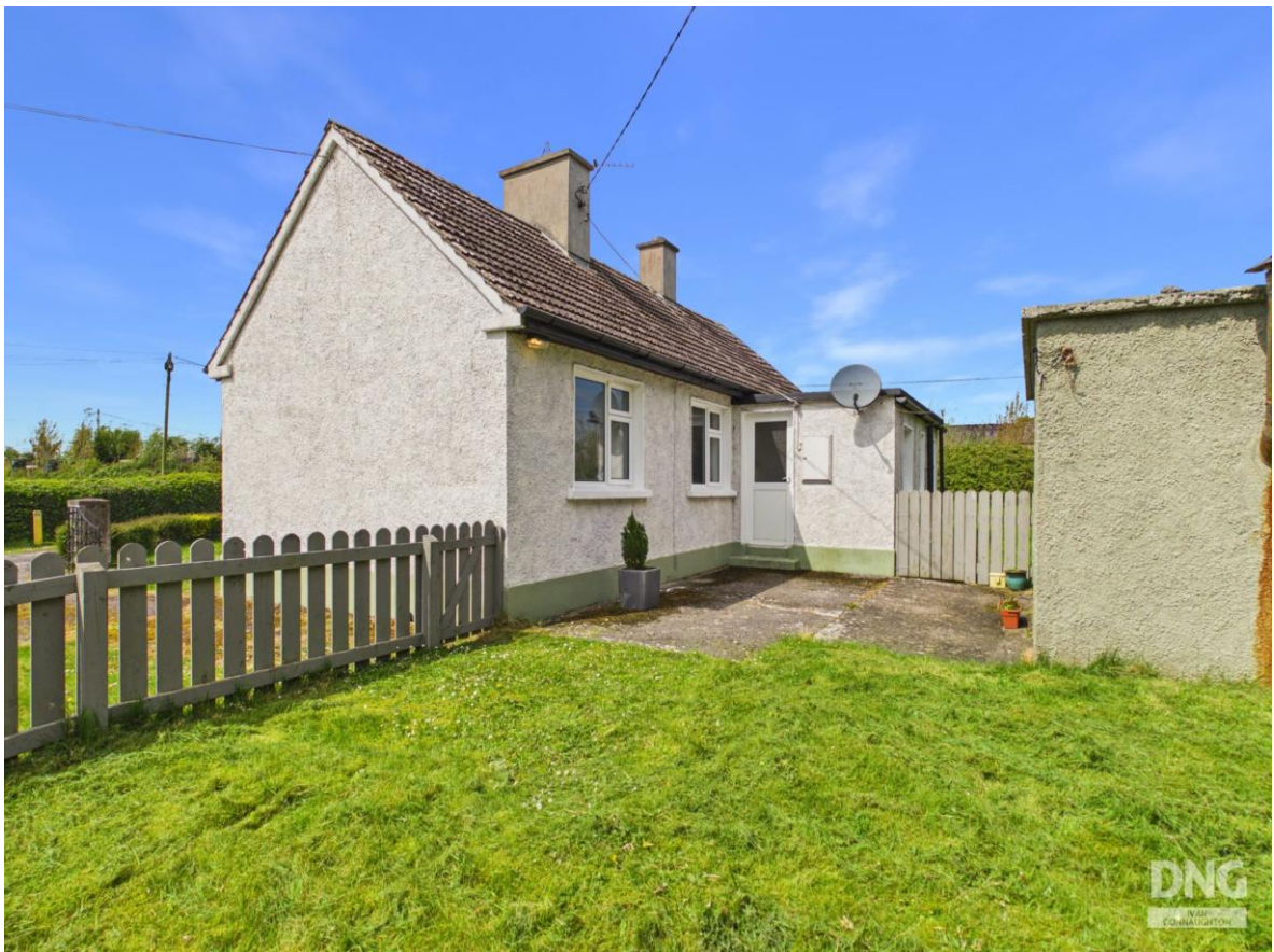
1 Ballyglass, Lanesborough, N39 P8C3