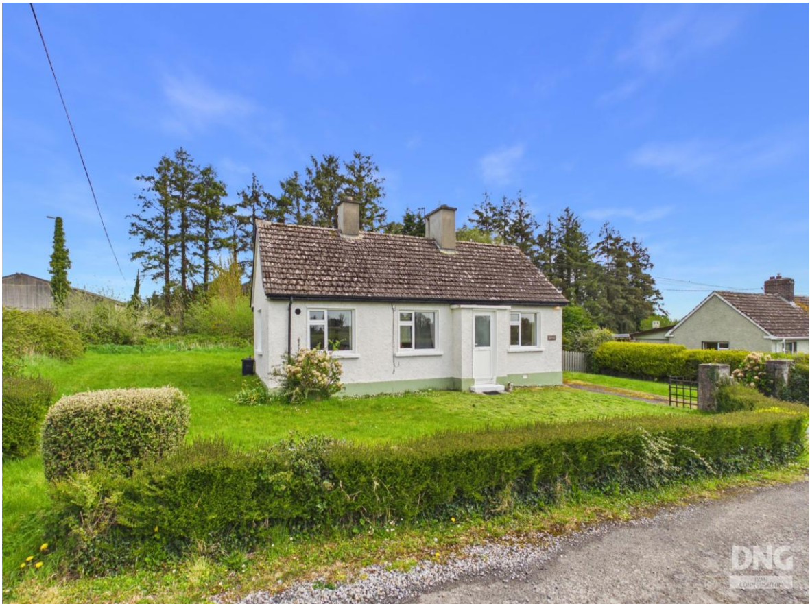
1 Ballyglass, Lanesborough, N39 P8C3