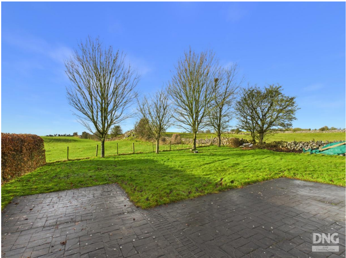
Ardcolman, Dysart, Ballinasloe, Co. Roscommon. H53 DK88