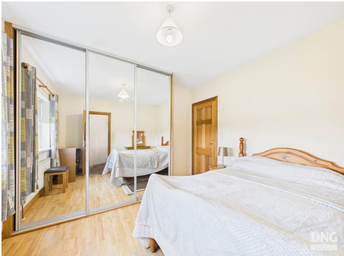
Ardcolman, Dysart, Ballinasloe, Co. Roscommon. H53 DK88