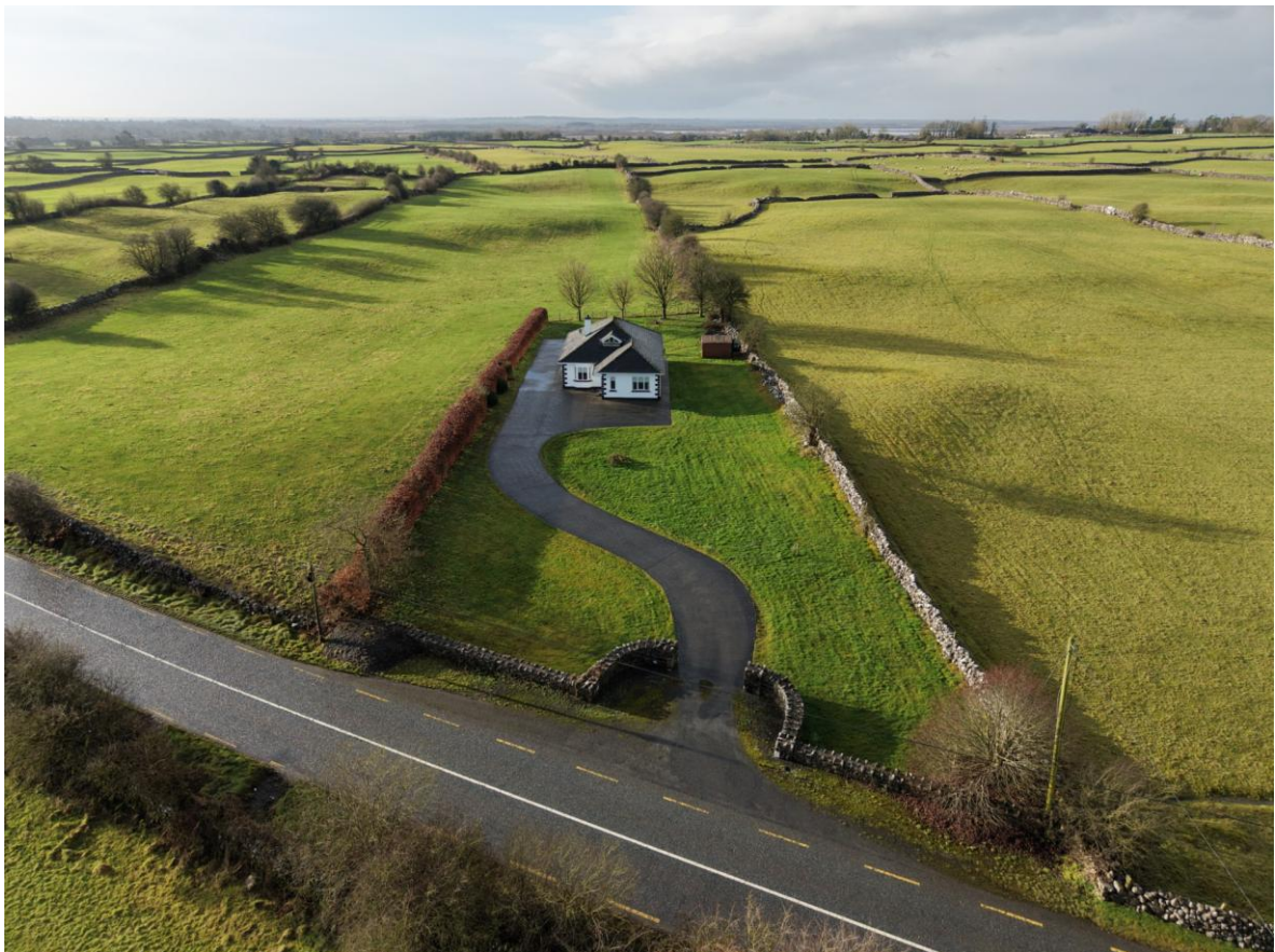
Ardcolman, Dysart, Ballinasloe, Co. Roscommon. H53 DK88