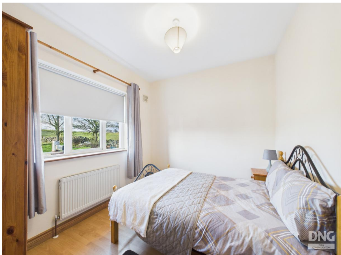
Ardcolman, Dysart, Ballinasloe, Co. Roscommon. H53 DK88