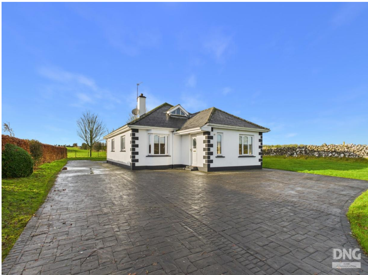
Ardcolman, Dysart, Ballinasloe, Co. Roscommon. H53 DK88