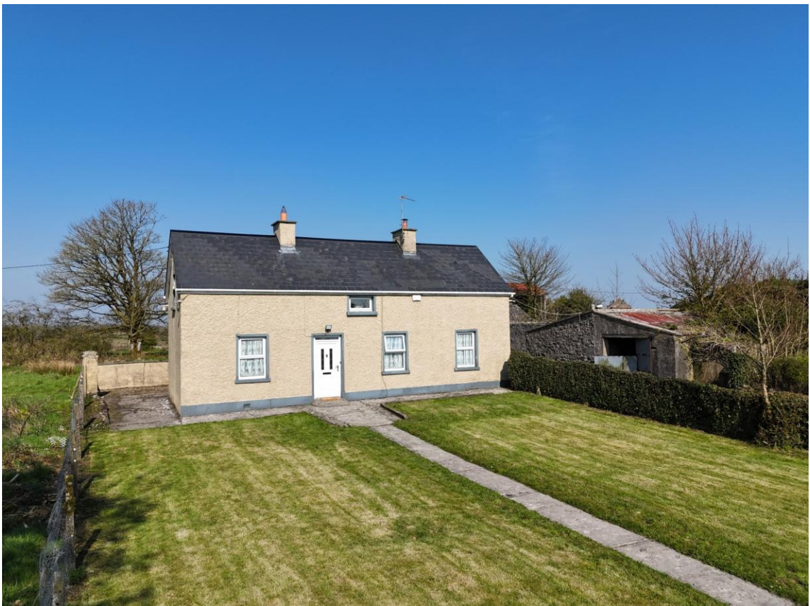
Residence On C. 1.30 Acres, Castleteheen, Castlerea, Co. Roscommon. F45 K304