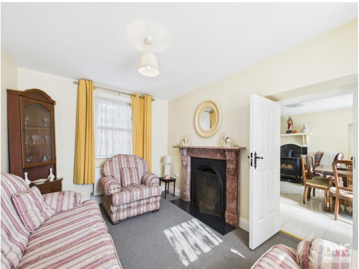
Residence On C. 1.30 Acres, Castleteheen, Castlerea, Co. Roscommon. F45 K304