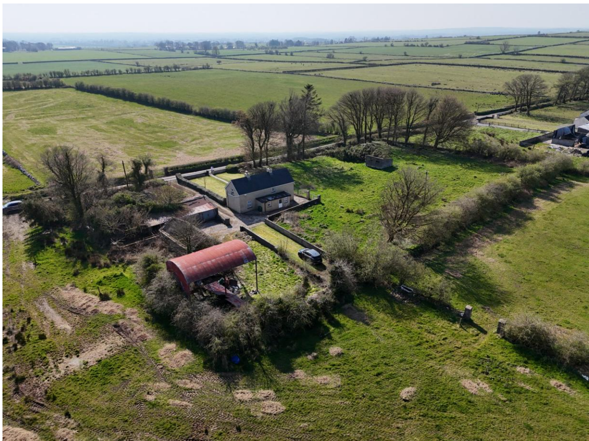
Residence On C. 1.30 Acres, Castleteheen, Castlerea, Co. Roscommon. F45 K304