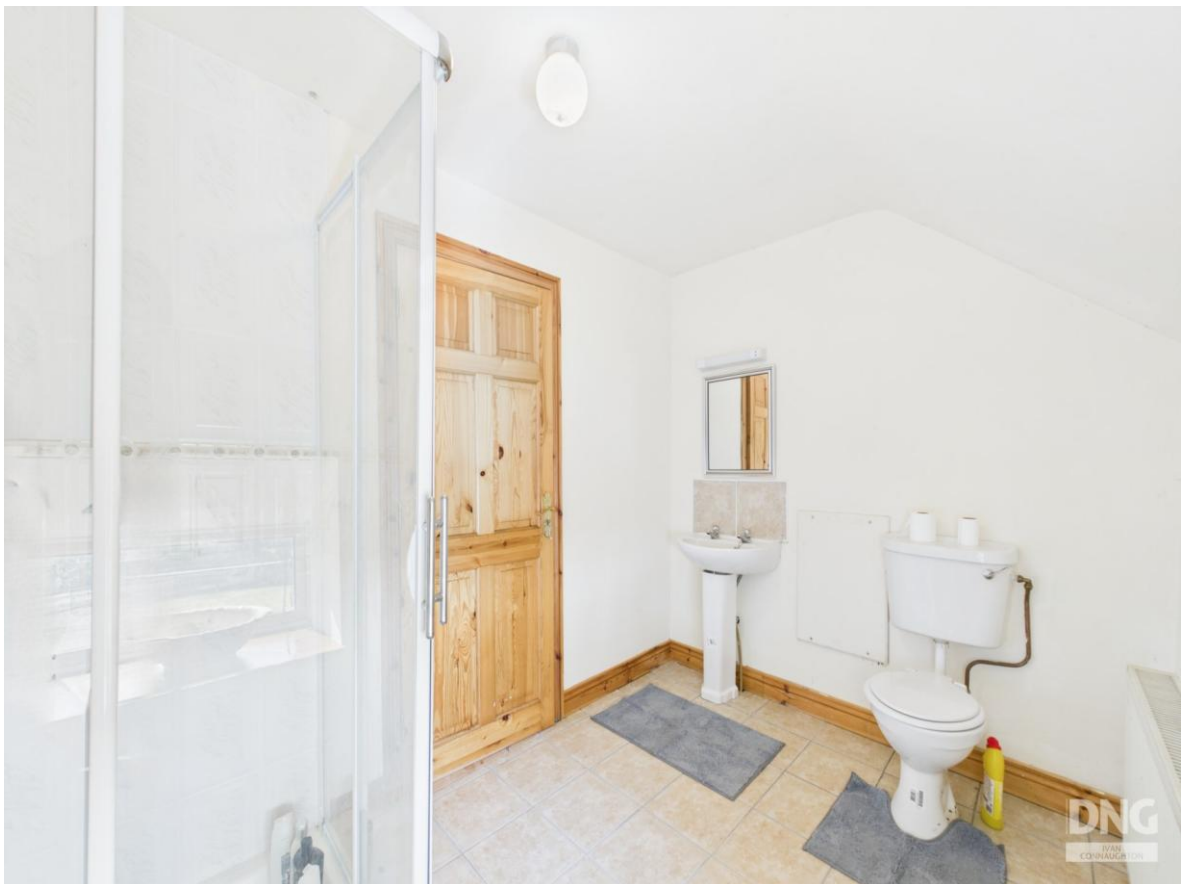
Residence On C. 1.30 Acres, Castleteheen, Castlerea, Co. Roscommon. F45 K304