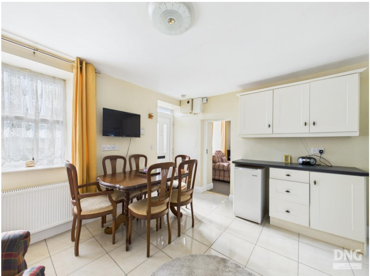
Residence On C. 1.30 Acres, Castleteheen, Castlerea, Co. Roscommon. F45 K304