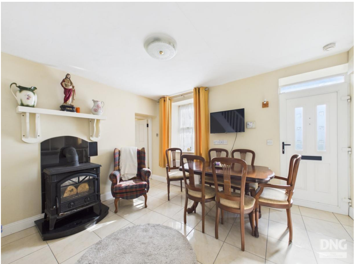
Residence On C. 1.30 Acres, Castleteheen, Castlerea, Co. Roscommon. F45 K304