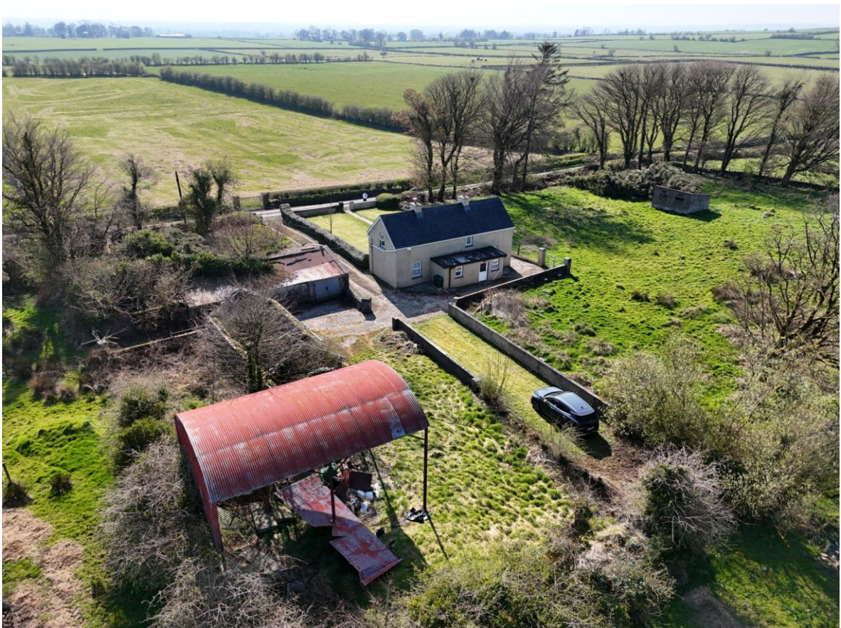
Residence On C. 1.30 Acres, Castleteheen, Castlerea, Co. Roscommon. F45 K304