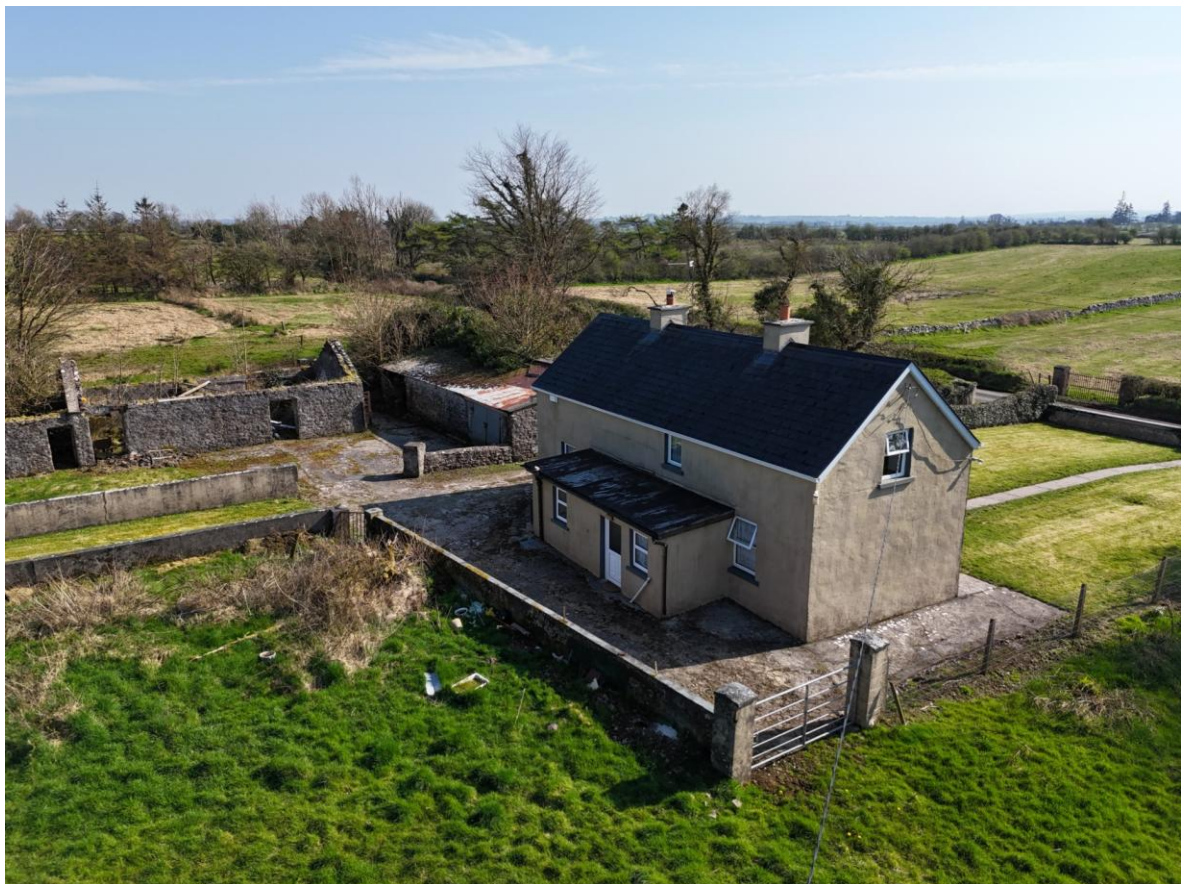
Residence On C. 1.30 Acres, Castleteheen, Castlerea, Co. Roscommon. F45 K304