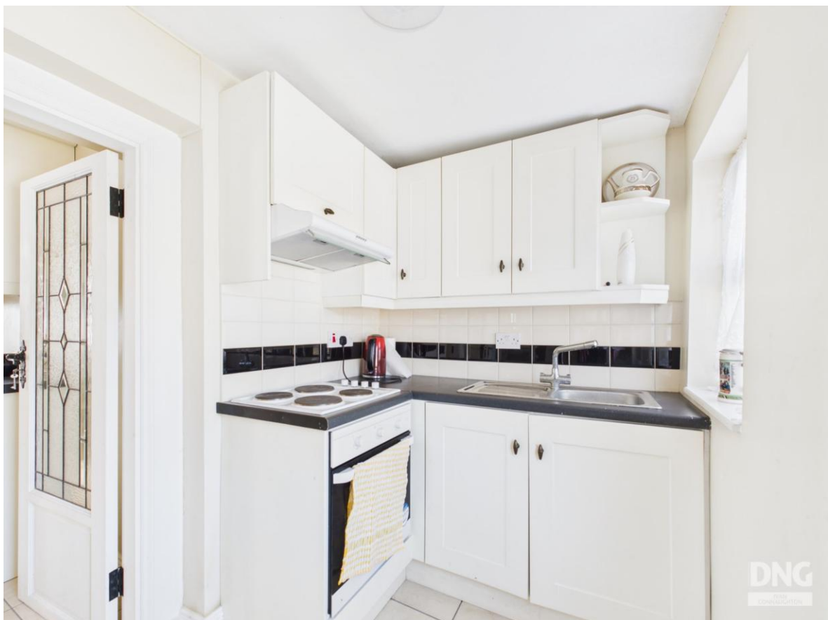
Residence On C. 1.30 Acres, Castleteheen, Castlerea, Co. Roscommon. F45 K304