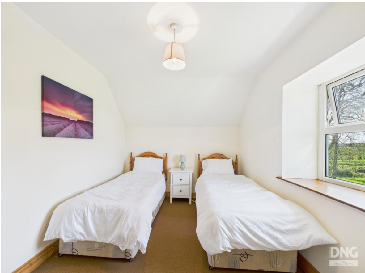
Residence On C. 1.30 Acres, Castleteheen, Castlerea, Co. Roscommon. F45 K304