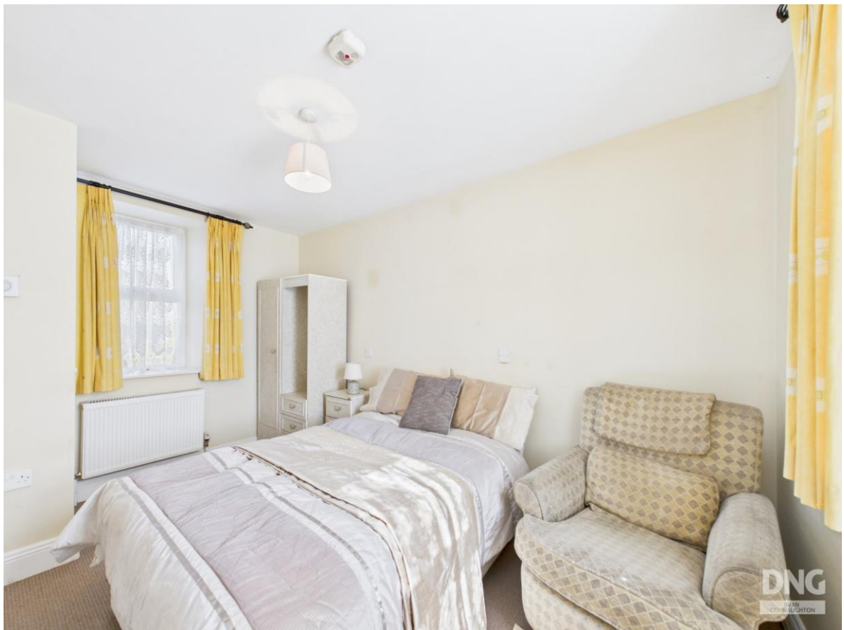
Residence On C. 1.30 Acres, Castleteheen, Castlerea, Co. Roscommon. F45 K304