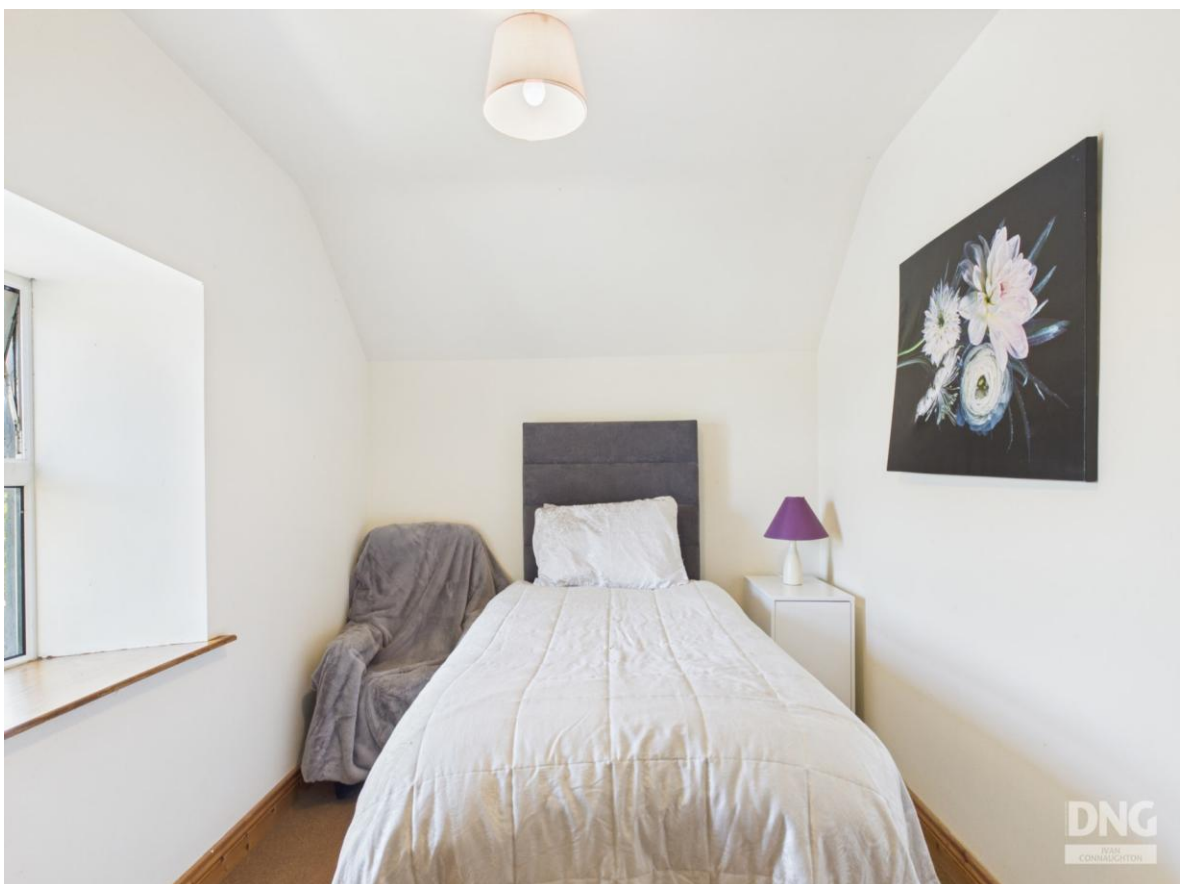
Residence On C. 1.30 Acres, Castleteheen, Castlerea, Co. Roscommon. F45 K304