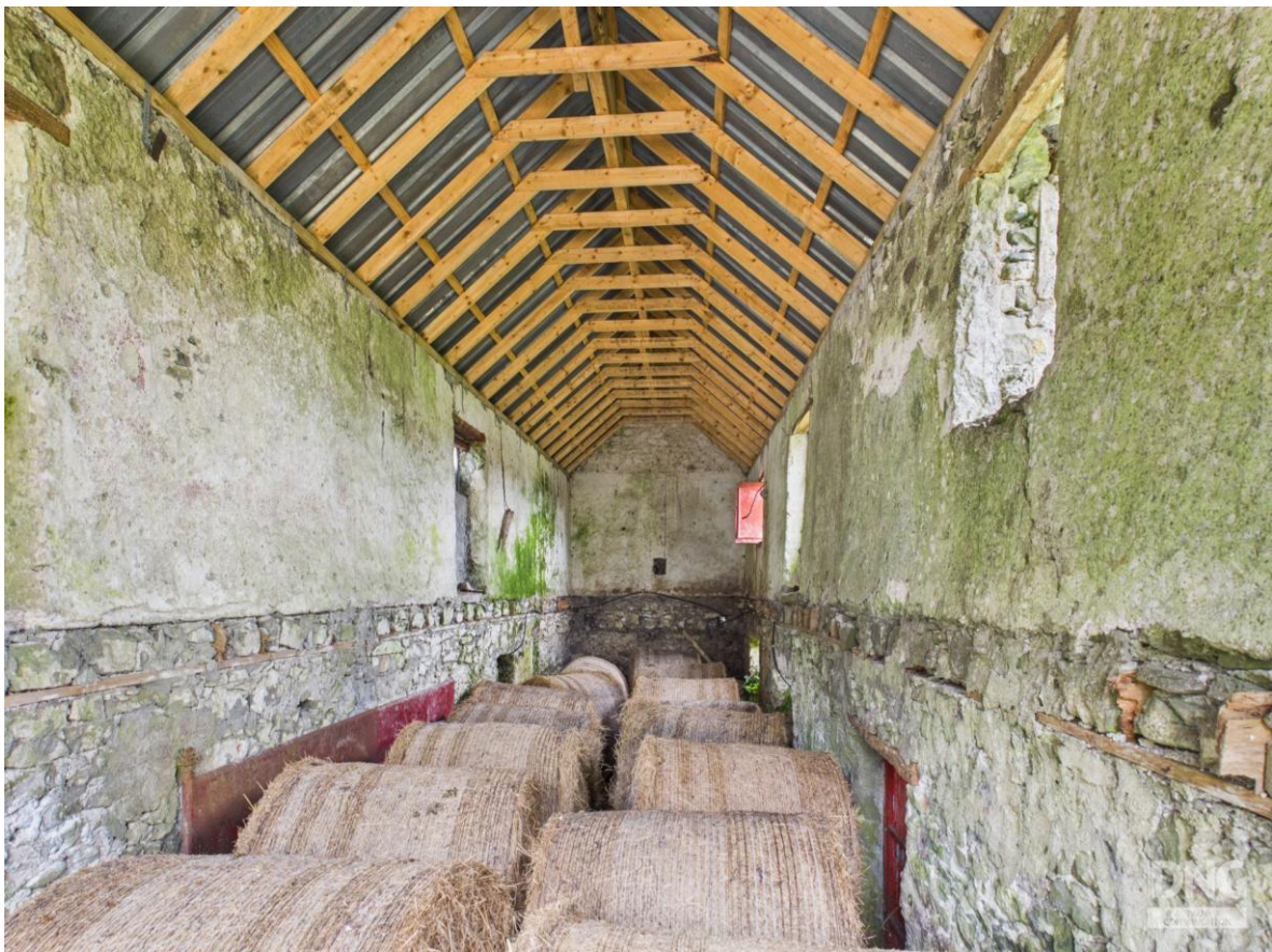
Residence & Outbuildings On C. 8.20 Acres, Shannagh More, Glenamaddy, F45 XR67