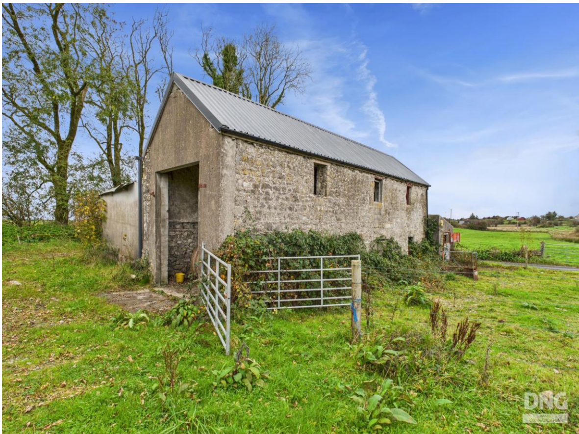
Residence & Outbuildings On C. 8.20 Acres, Shannagh More, Glenamaddy, F45 XR67