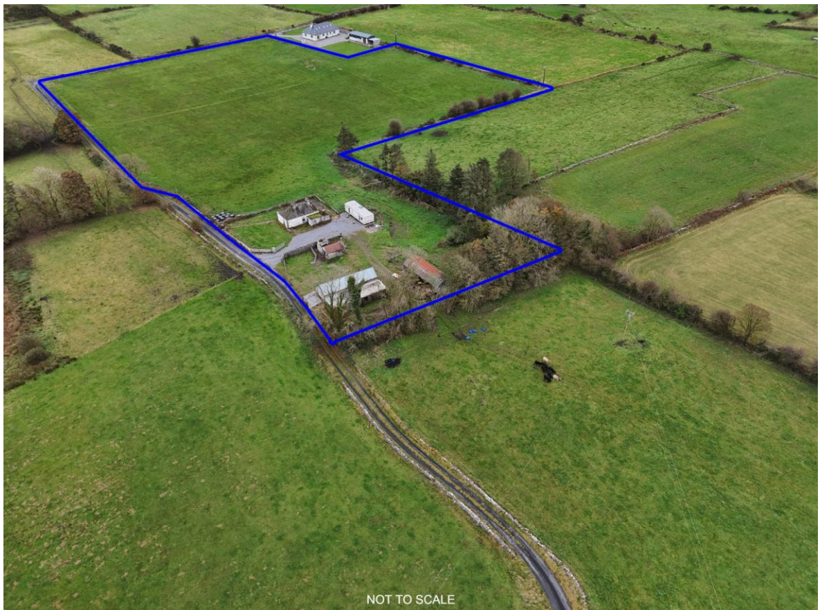
Residence & Outbuildings On C. 8.20 Acres, Shannagh More, Glenamaddy, F45 XR67