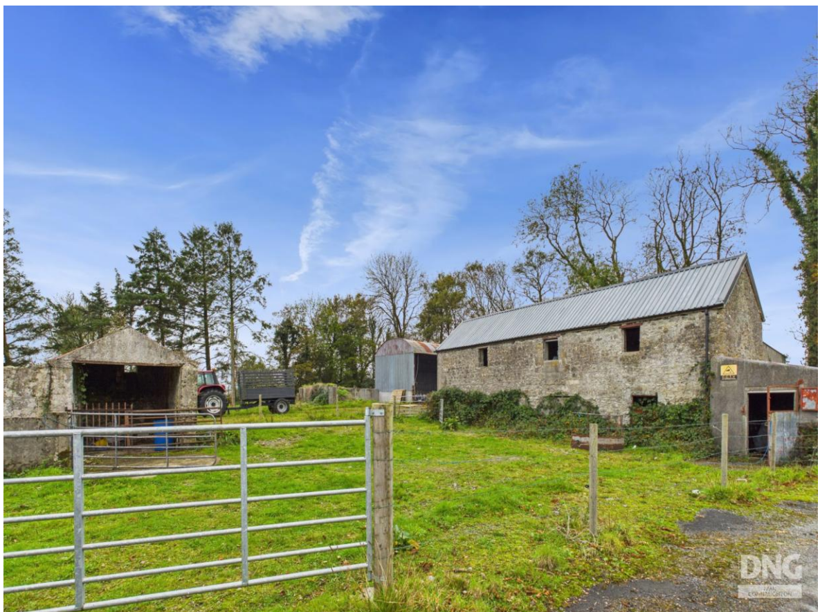
Residence & Outbuildings On C. 8.20 Acres, Shannagh More, Glenamaddy, F45 XR67