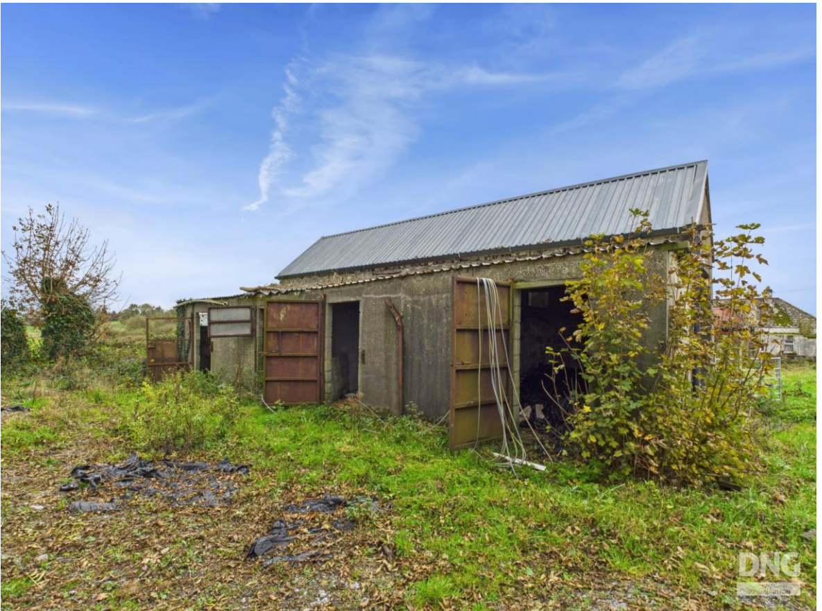
Residence & Outbuildings On C. 8.20 Acres, Shannagh More, Glenamaddy, F45 XR67