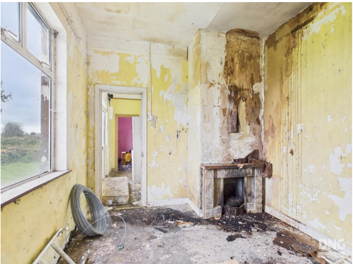
Residence & Outbuildings On C. 8.20 Acres, Shannagh More, Glenamaddy, F45 XR67