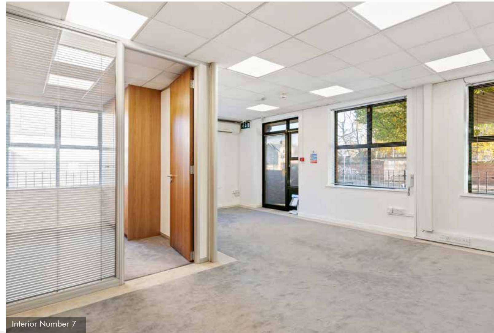
Interior Number 7

Metric floor areas above are rounded. Intending purchasers / tenants are specifically advised to verify all information, including floor areas. See DISCLAIMER.