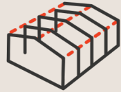
STEEL FRAME CONSTRUCTION