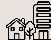
ZONED MIX USE