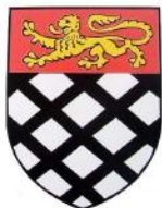
Arms of the de Meppershall Family