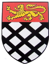
Arms of the de Meppershall Family