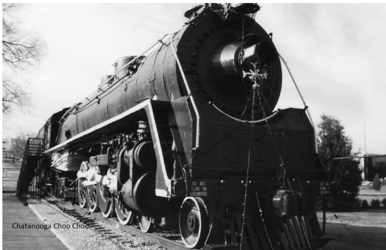
Chatanooga Choo Choo