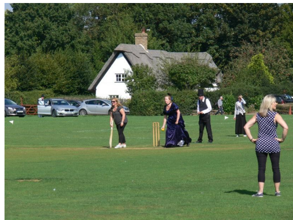
Celebrating the 175 th Anniversary of Cricket on Ickwell Green

Cricket has been played here since 1839 and in 2014; Ickwell Cricket Club celebrated the 175 th Anniversary of the first game on Ickwell Green which was against nearby neighbours Old Warden. With its beautiful surroundings this must be one of the most photographed village green cricket grounds in the country. It is a great favourite place for spectators to come and watch a game of cricket or just to relax on a summer's day. More people come to watch cricket here than on any other ground in Bedfordshire.