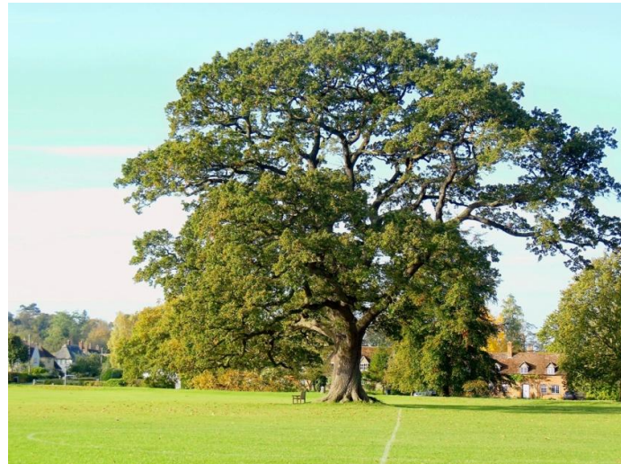
'The Ickwell Oak'

Last year 'The Ickwell Oak', which stands on Ickwell Green, was chosen out of 200 original entries to be one of the ten trees to take part in the final of The Woodland Trust's National 'Tree of the Year' competition. After the votes were counted it was a very creditable third behind the 'Major Oak' in Sherwood Forest, said to be Robin Hood's legendary hideout and 'Old Knobbly' in Essex. The Ickwell Oak is estimated to be about 260 years old and is a centrepiece of this picturesque Green which is surrounded by a variety of old cottages.