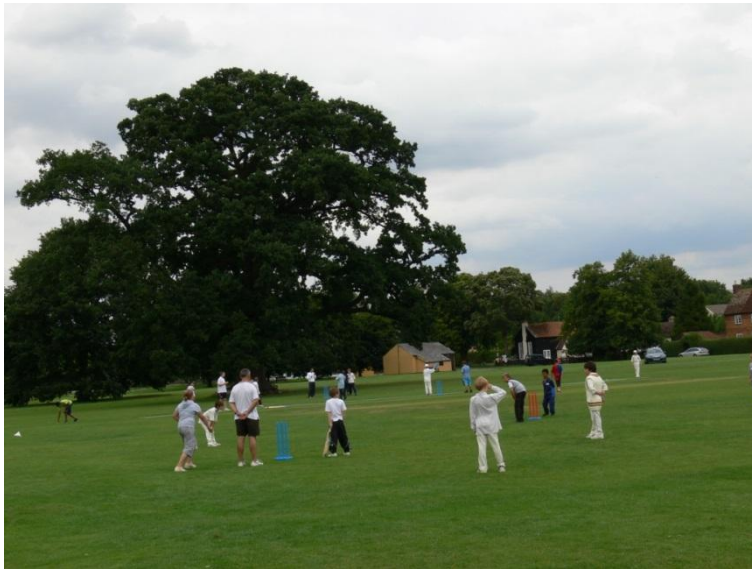
Young cricketers on Ickwell Green under 'The Oak'

Unusually the oak tree stands within the boundary of the cricket ground and four runs are scored no matter where the ball strikes the tree. So a batsman may feel short-changed if he just fails to clear this massive oak. A six can only be scored by hitting the ball over the tree and this is a very rare event. The tree is such a well-known landmark that it has been adopted as the logo for Ickwell Cricket Club.