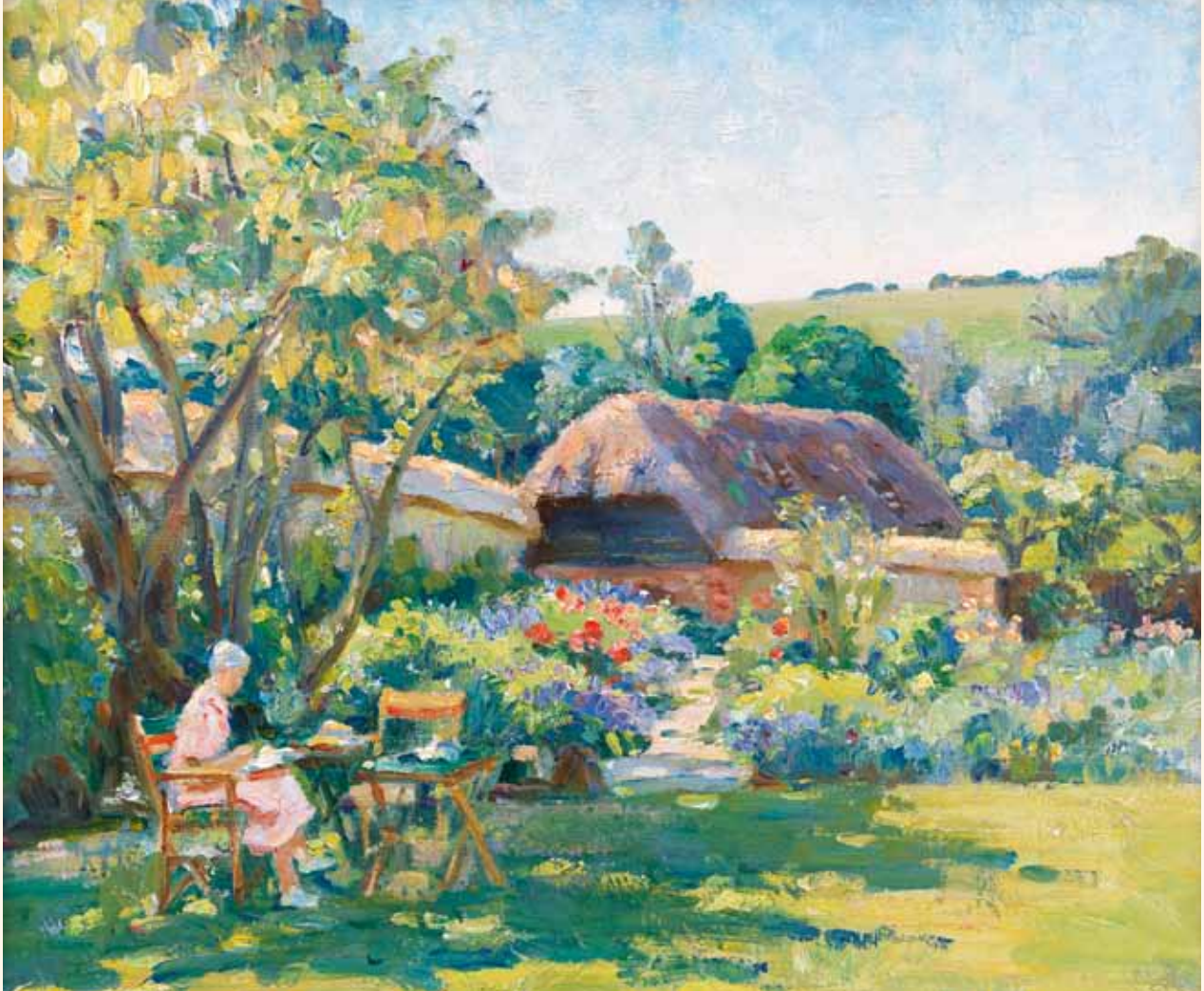
The Wiltshire Landscapes