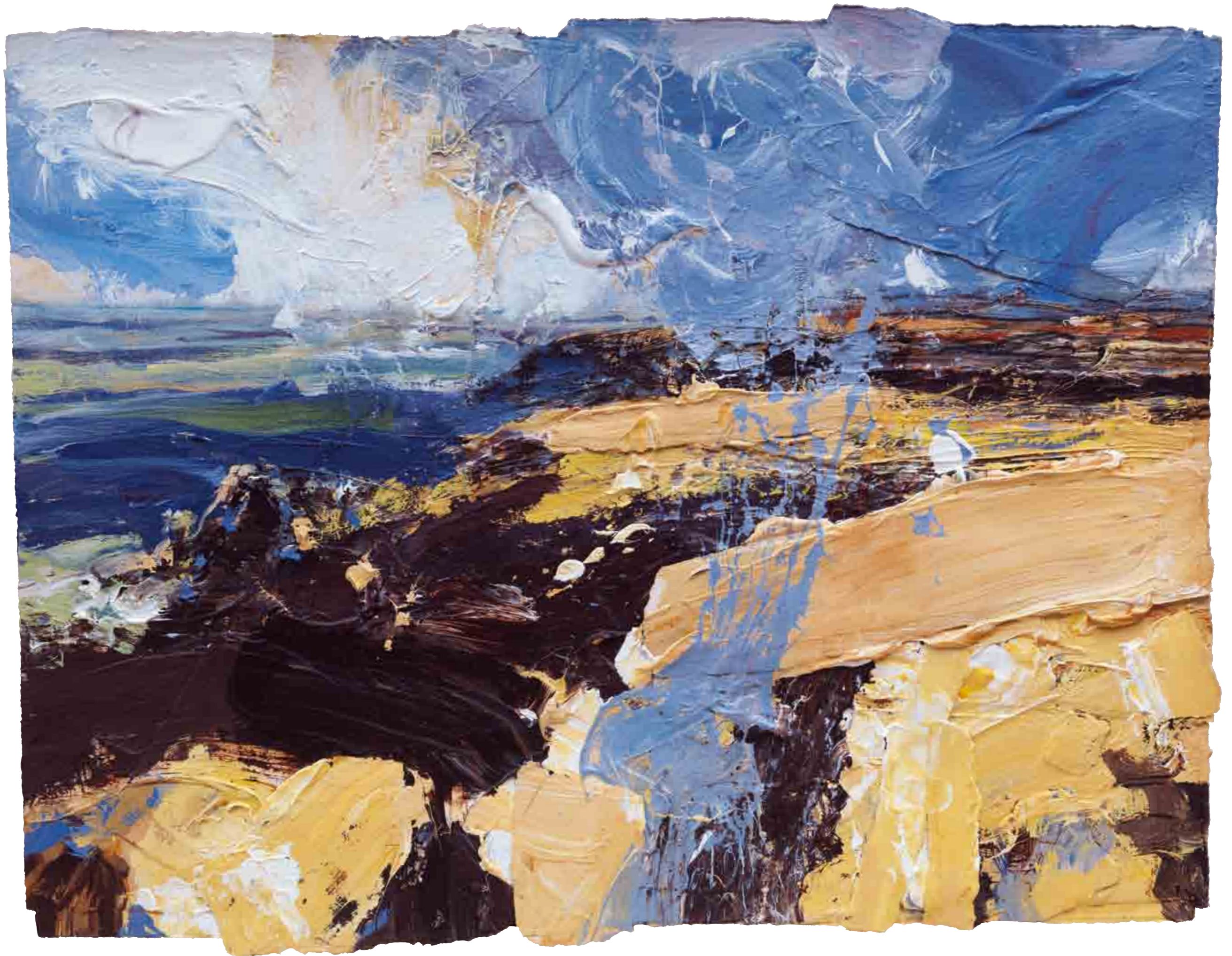
45. Landfall (St. Non), 2016 mixed media on paper 64 x 81 cms 25¼ x 31⅞ ins