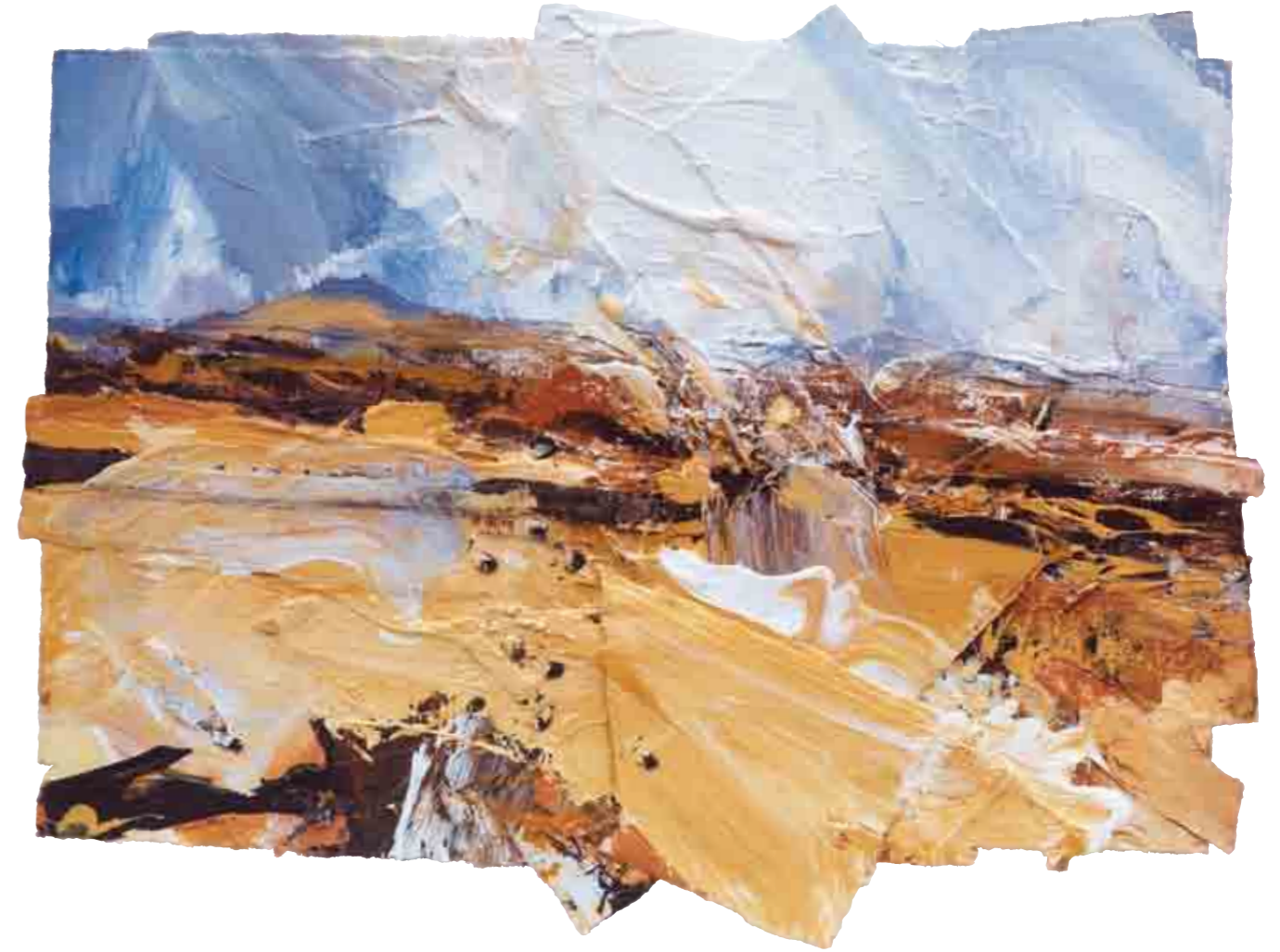
15. Sometimes I Think About Brown Willy and Rough Tor, 2016 mixed media on paper 50 x 66 cms 19¾ x 26 ins