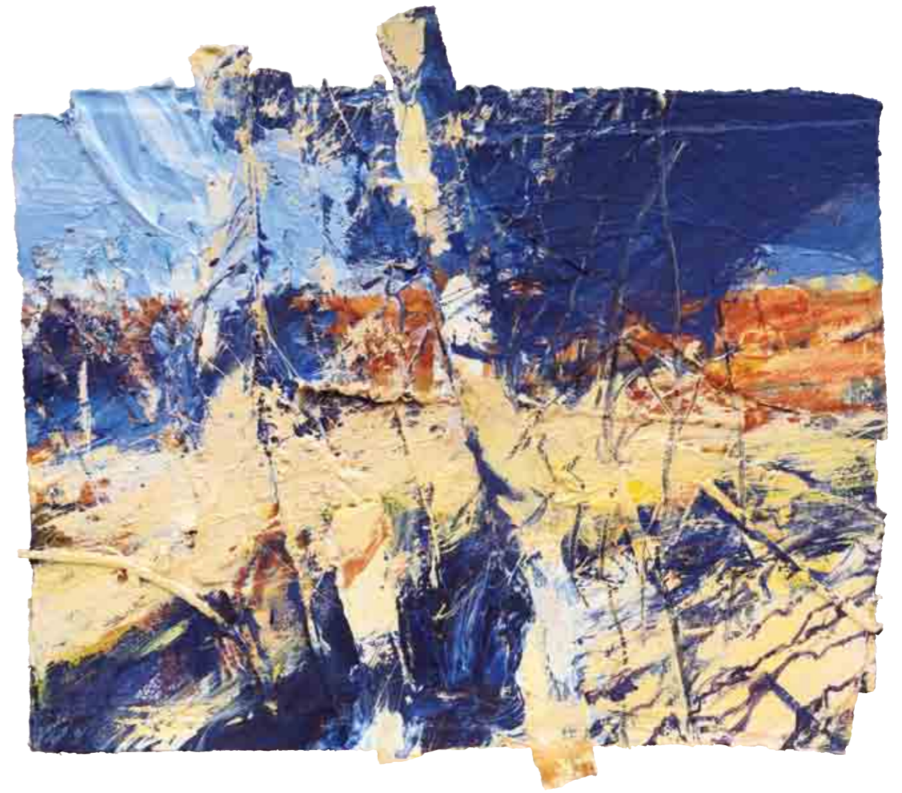
36. Solstice Sun (Caerbwdy), 2016 mixed media on paper 37 x 42 cms 14½ x 16½ ins