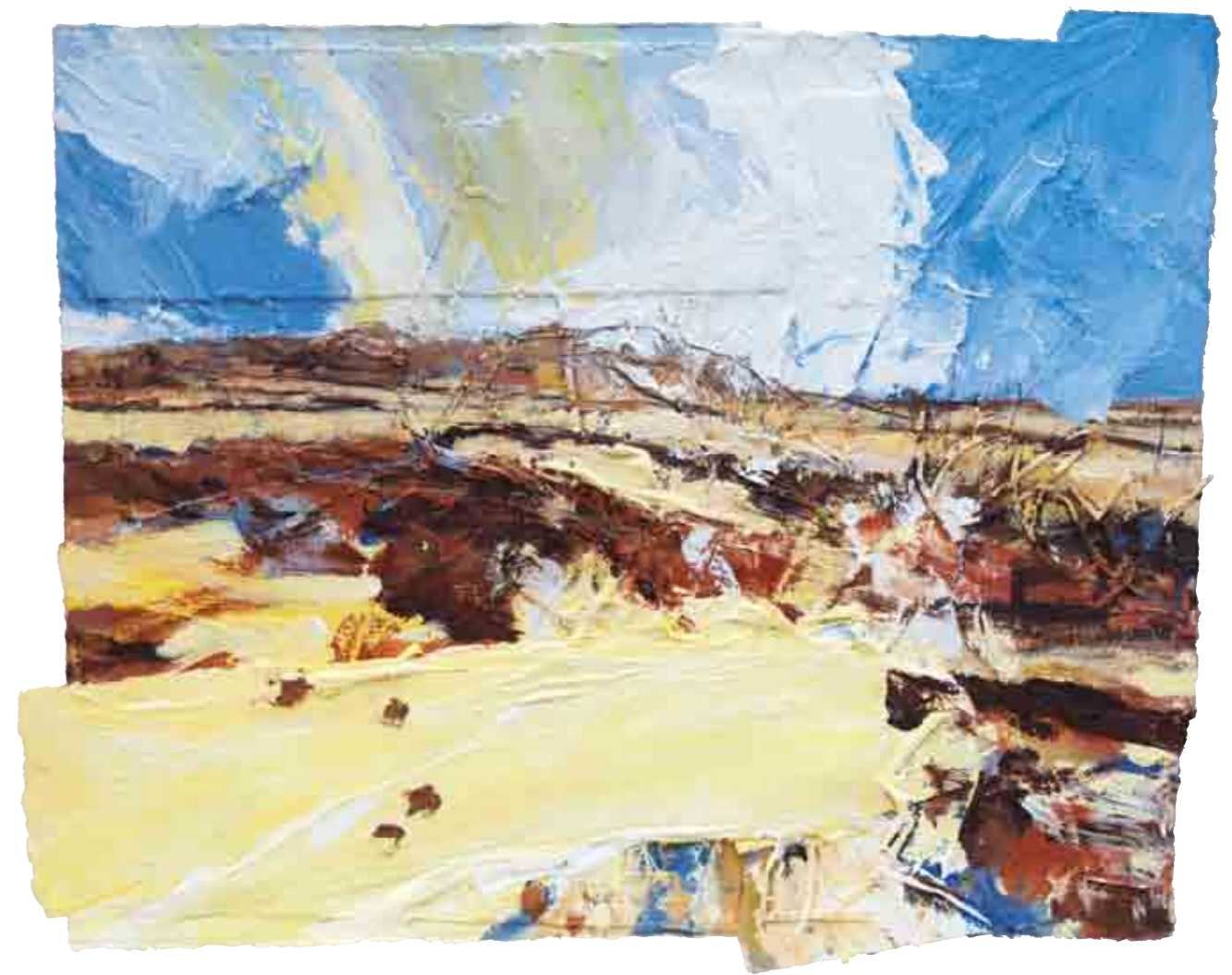
44. Sometimes in Spring (Clegyr Boia), 2016 mixed media on paper 53 x 65 cms 20 7 / 8 x 25 3 / 8 ins