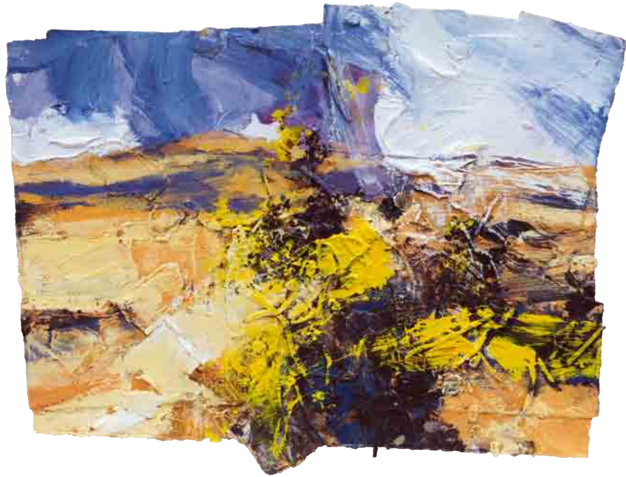
14. Sometimes I Think About Garrow Tor In Spring, 2016 mixed media on paper 49 x 62 cms 19¼ x 24¾ ins