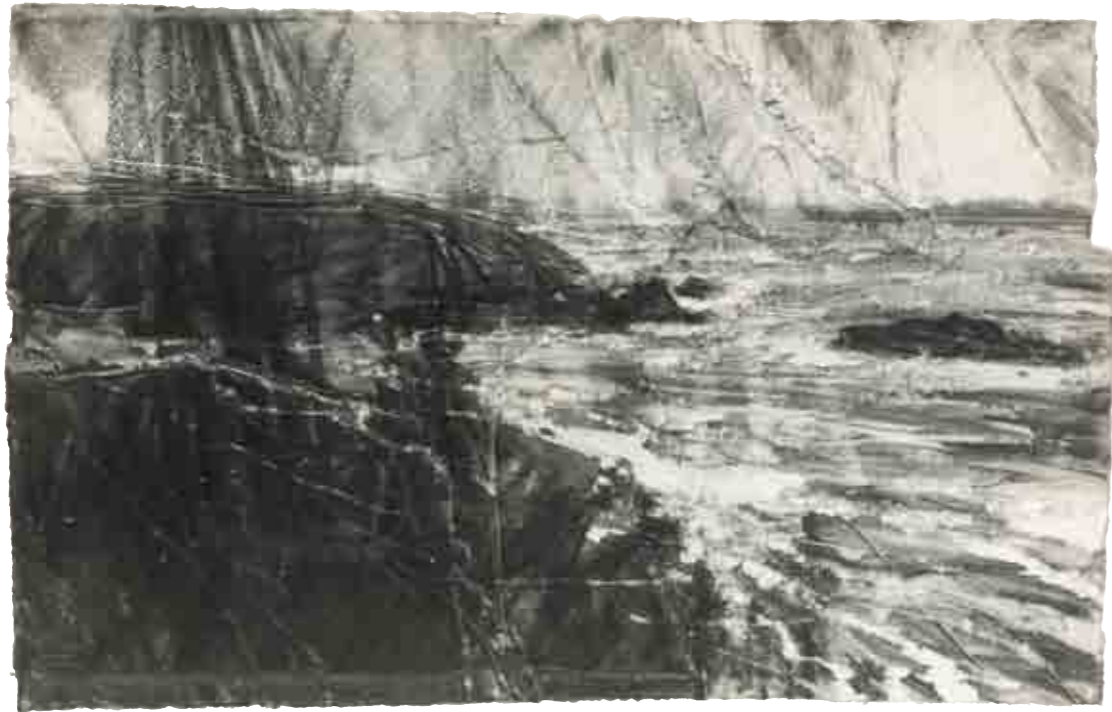
42. Winter, Caerfai, 2017 graphite on paper 29 x 46 cms 11 \frac{3}{8} x 18 \frac{1}{8} ins