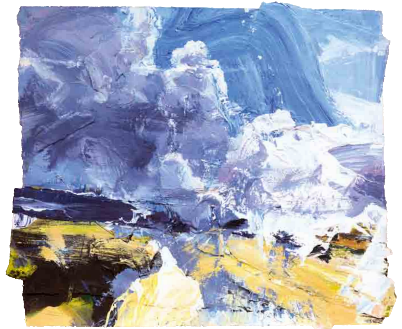
10. Cumulus, Early Sun (North Bovey), 2016 mixed media on paper 52 x 62 cms 20½ x 24¾ ins