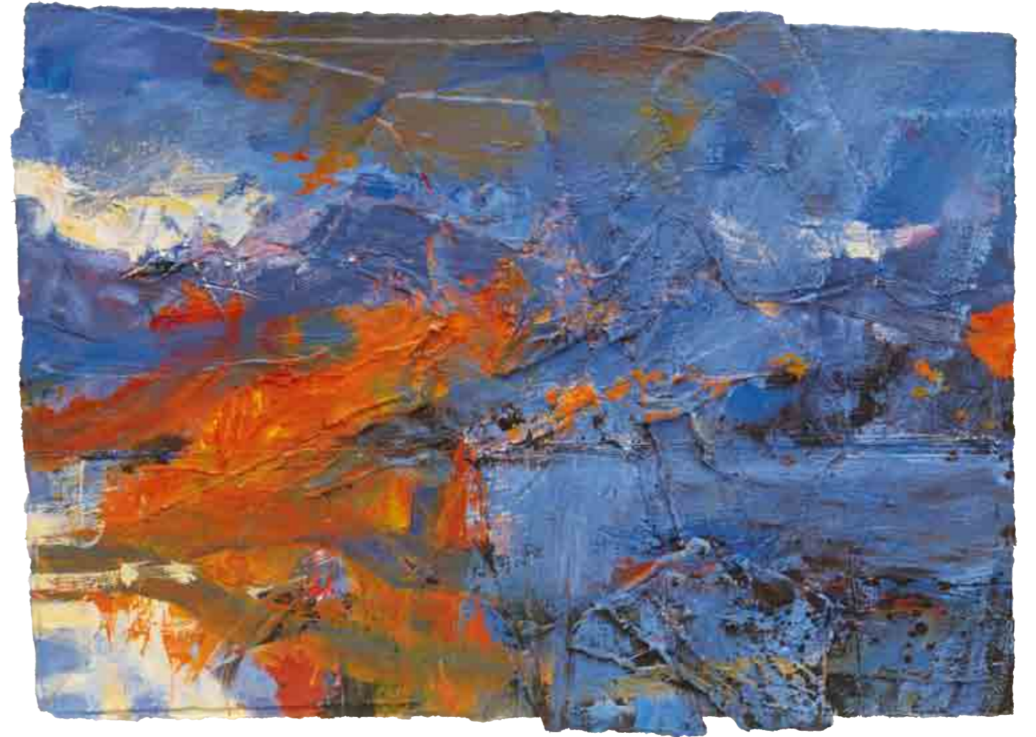
46. Loch Kishorn, Last Sun I, 2016 mixed media on paper 43 x 59 cms 16 7/8 x 23 1/4 ins