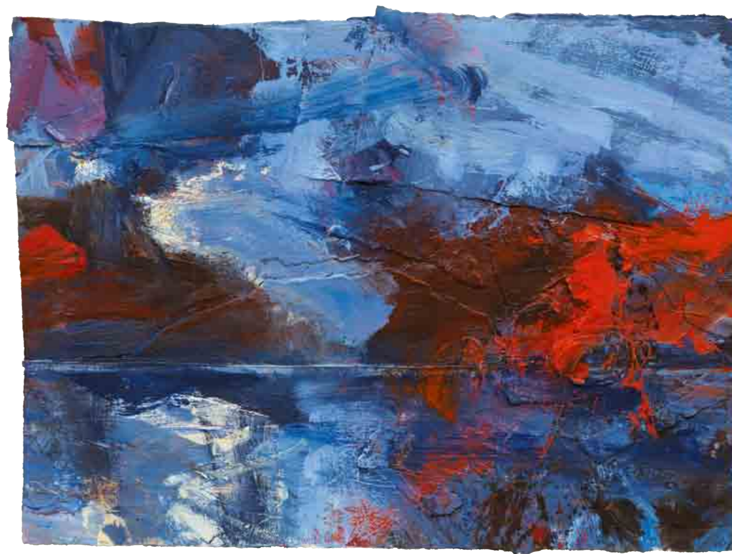
49. Day Ending (Last Sun, Beinn Bhan), 2016 mixed media on paper 61 x 82 cms 24 x 32¼ ins