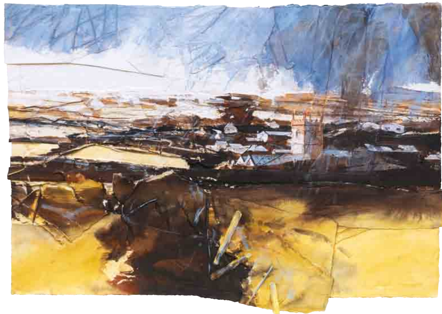
24. Churchtown (Zennor) II, 2016 mixed media on paper 61 x 87 cms 24 x 34¼ ins