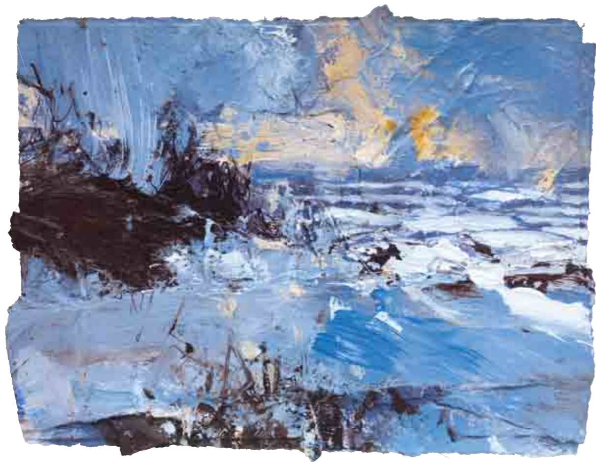
22. Darkening Snow Day I, 2016 mixed media on paper 31 x 40 cms 12¼ x 15¾ ins