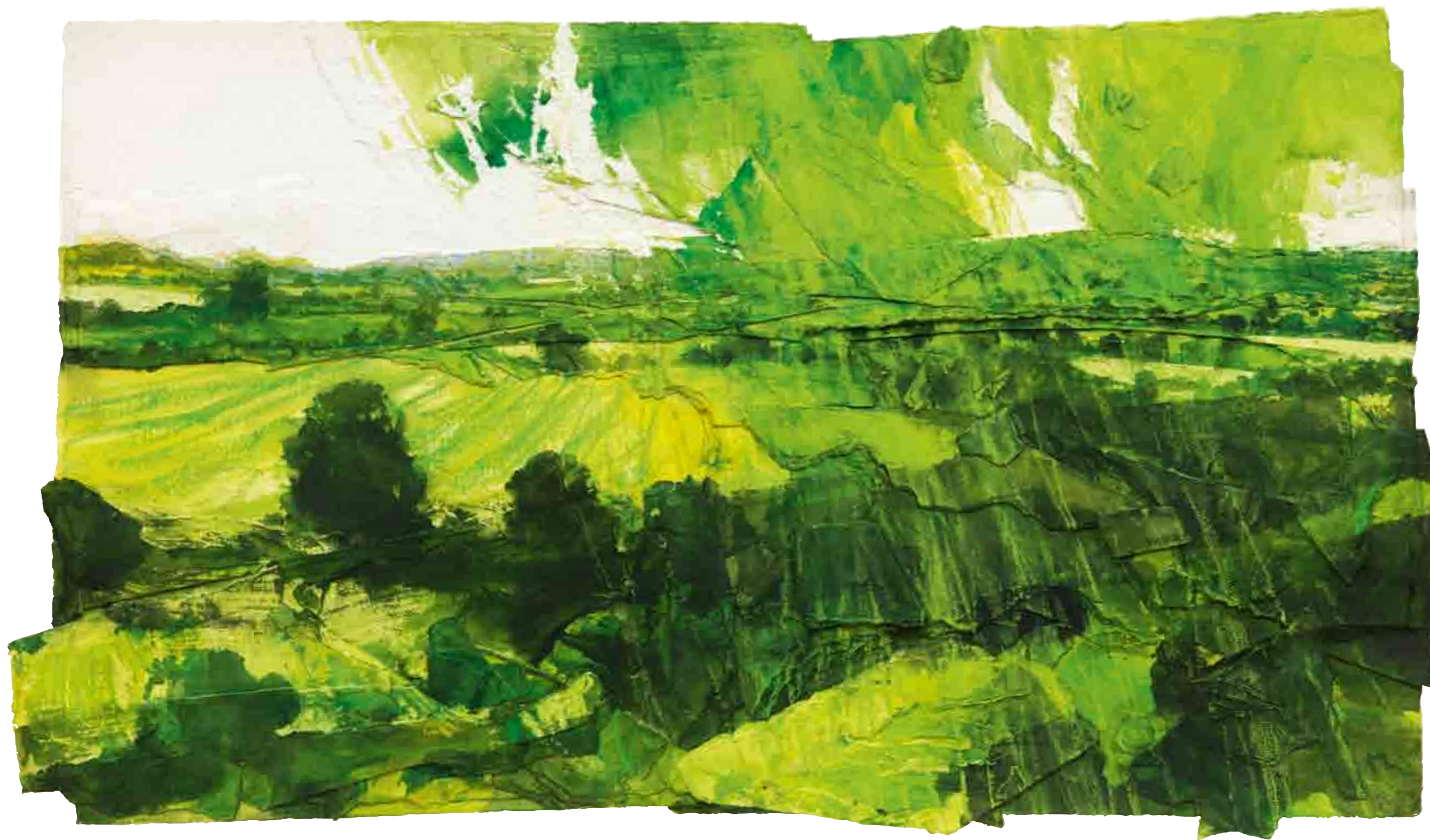
2. Green Teesdale, 2016 mixed media on paper 64 x 109 cms 25¼ x 42⅞ ins

with certainty that he is 'fighting his corner', a phrase he repeats in conversation. If at first this belief, that all his outcomes are hard-won, seems to be an exaggeration, upon reflection it is clear that, as a landscape painter of the post-millennial era, Tress's singular pursuit of a contemporary 'Sublime' is increasingly a struggle against the cheap artistic standards of others. At that level, every work in this exhibition is a cry of defiance.