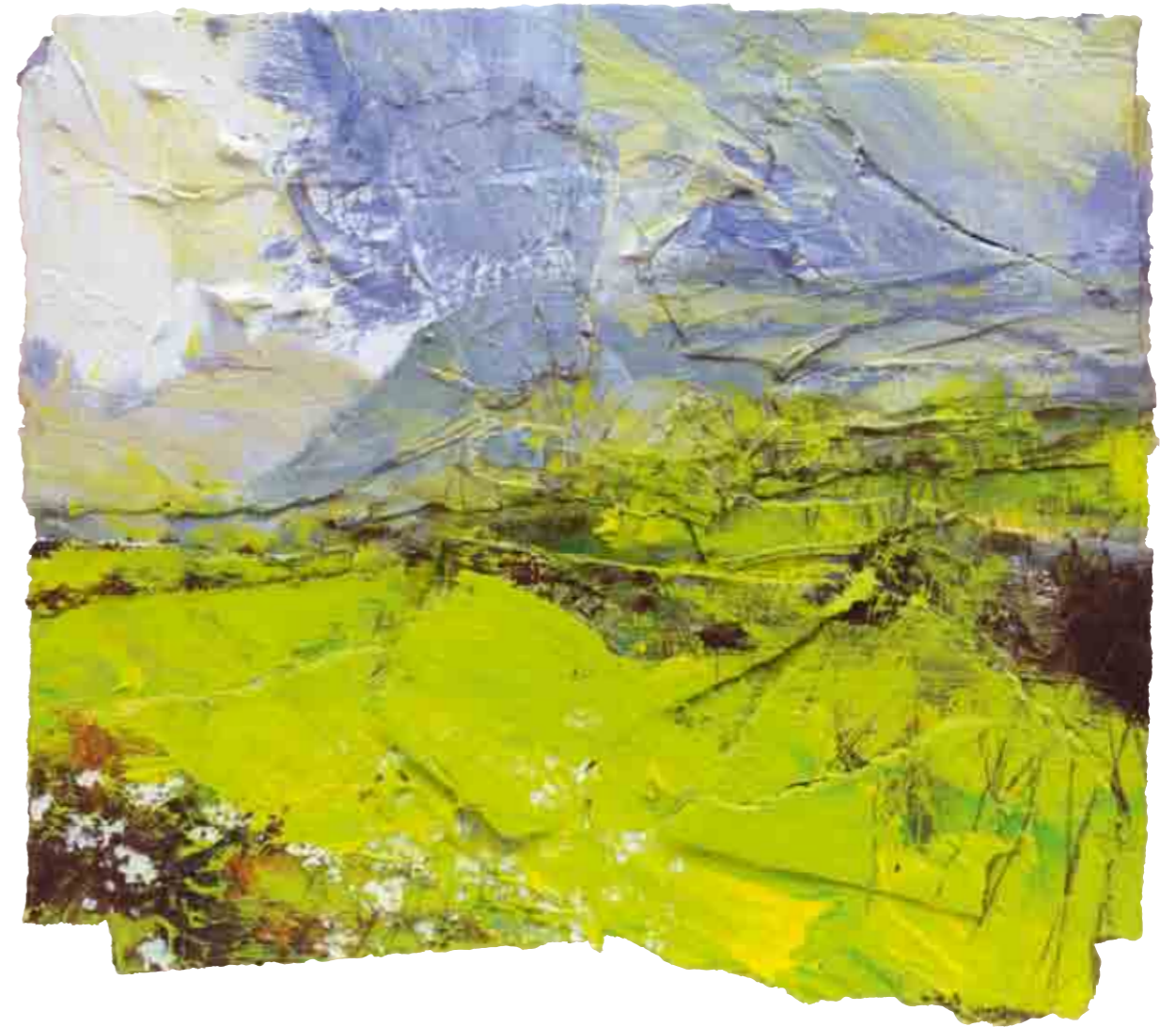
16. A Very Wet Day (Near Combe, Devon), 2016 mixed media on paper 39 x 42 cms 15½ x 16½ ins