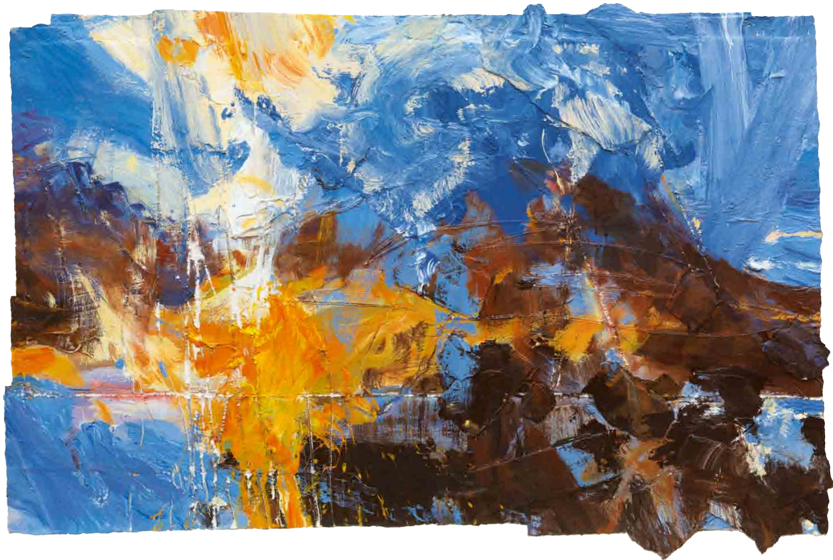
48. Beinn Bhan, Sun Breaking, 2016 mixed media on paper 73 x 109 cms 28¾ x 42⅝ ins