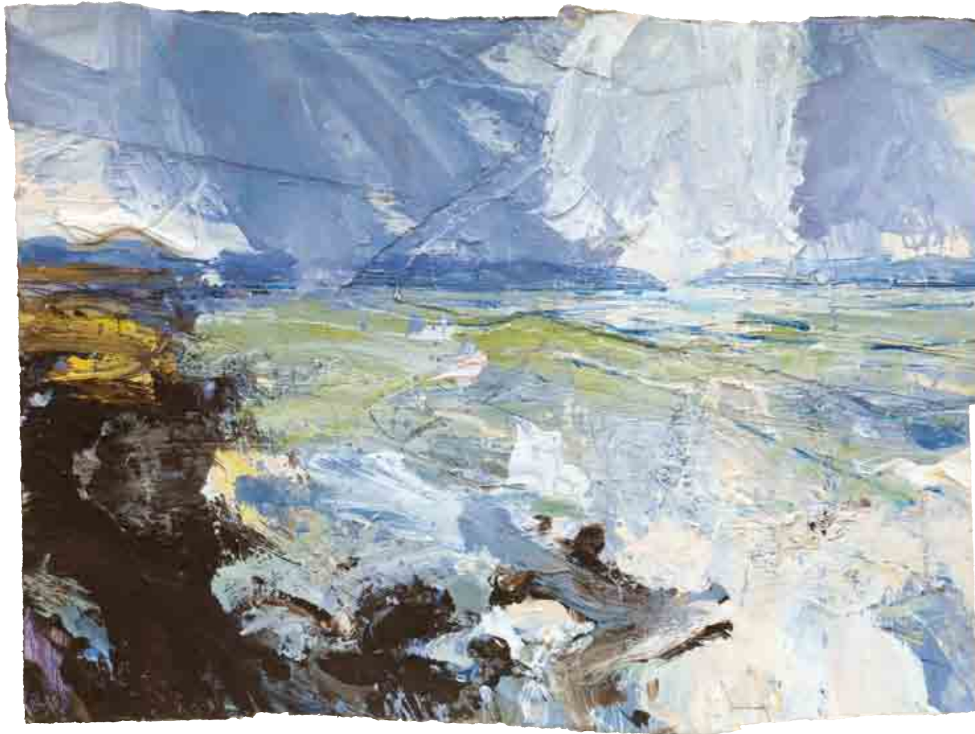
34. Landfall (St. Justinian), 2016 mixed media on paper 61 x 81 cms 24 x 31 \frac{1}{8} ins