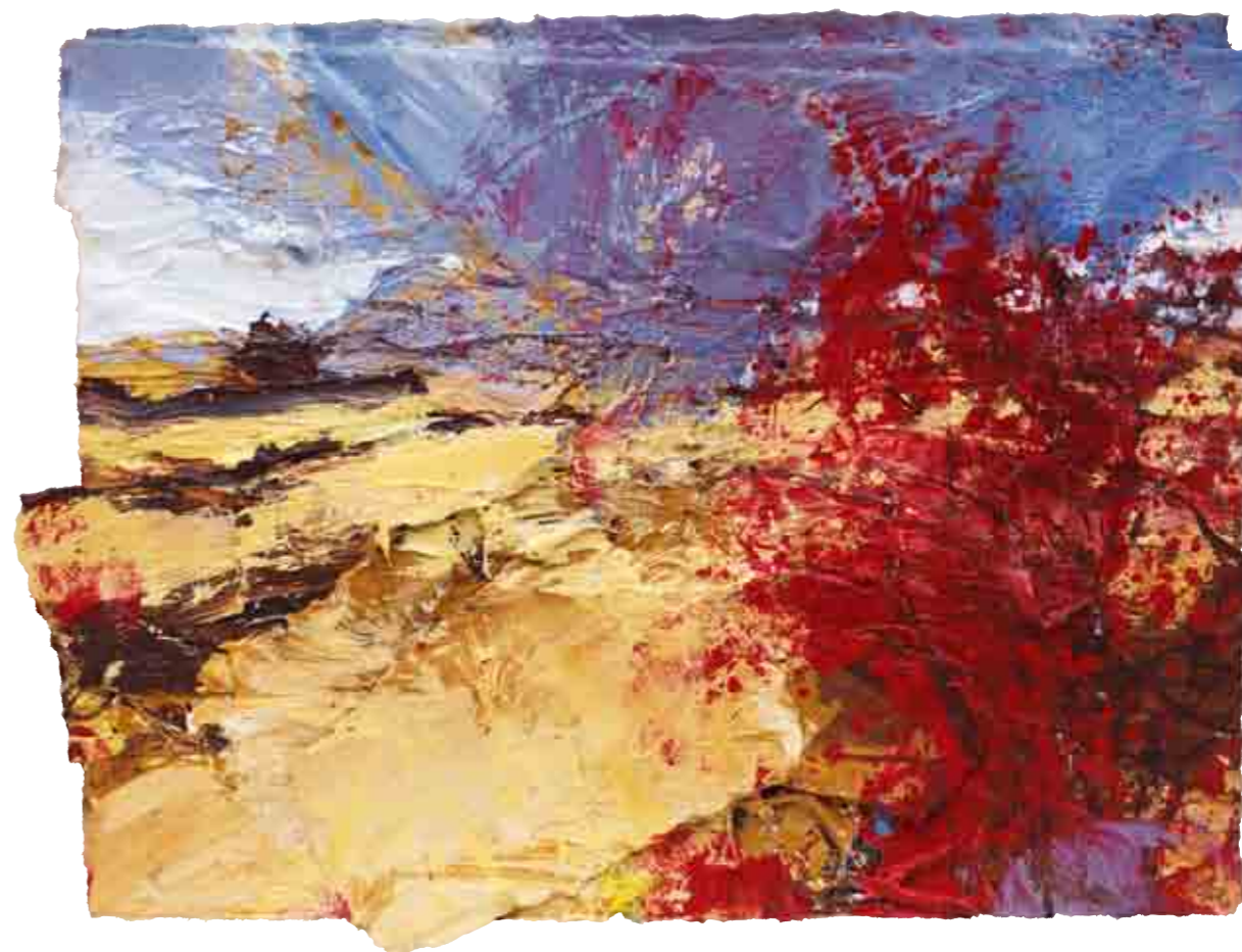
33. Red Thorn (Pen Beri), 2016 mixed media on paper 37 x 41 cms 14½ x 16½ ins