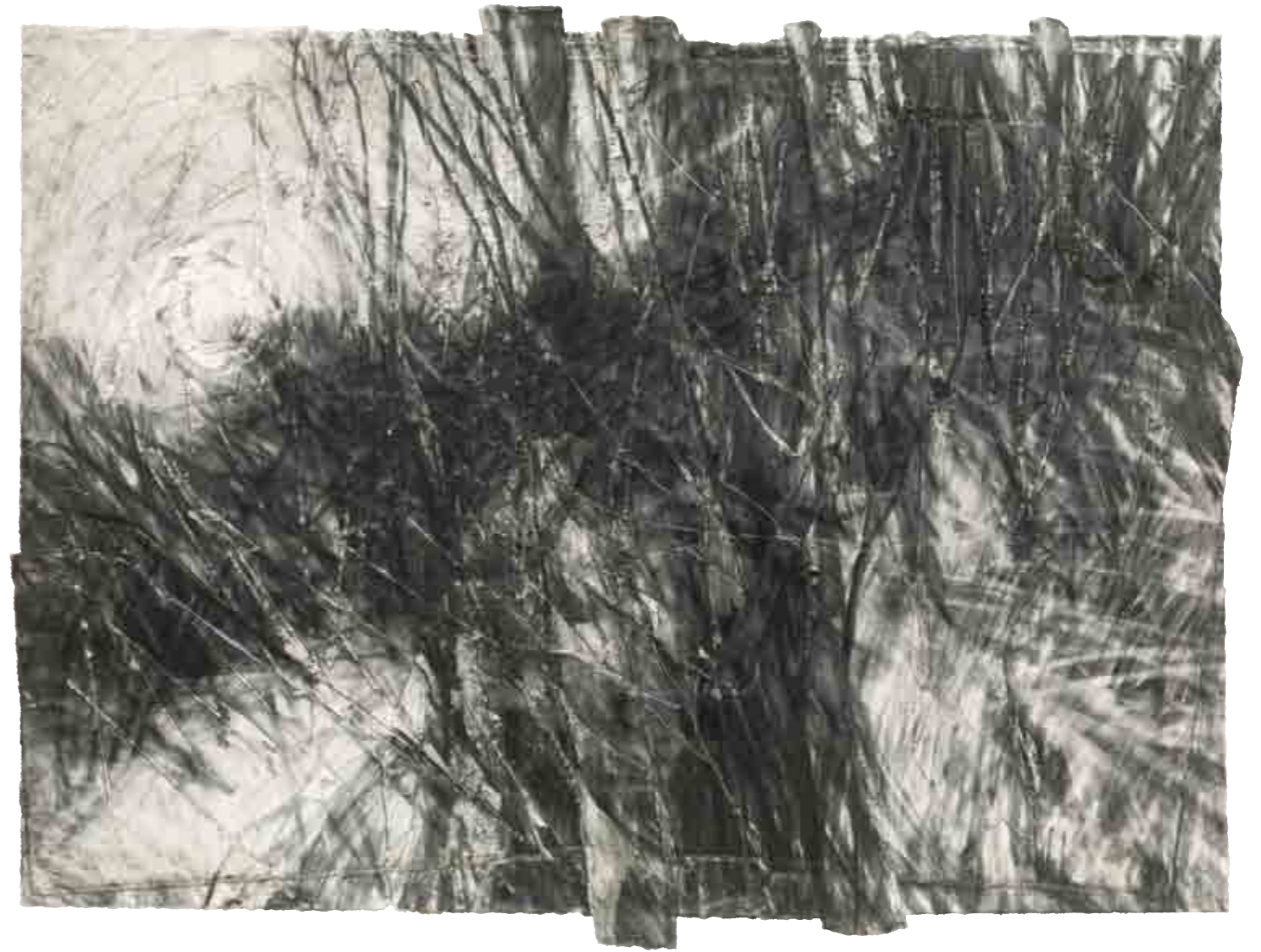
41. Dying Sun (Midwinter Revelation), 2016 graphite on paper 65 x 85 cms 25 \frac{5}{8} x 33 \frac{1}{2} ins