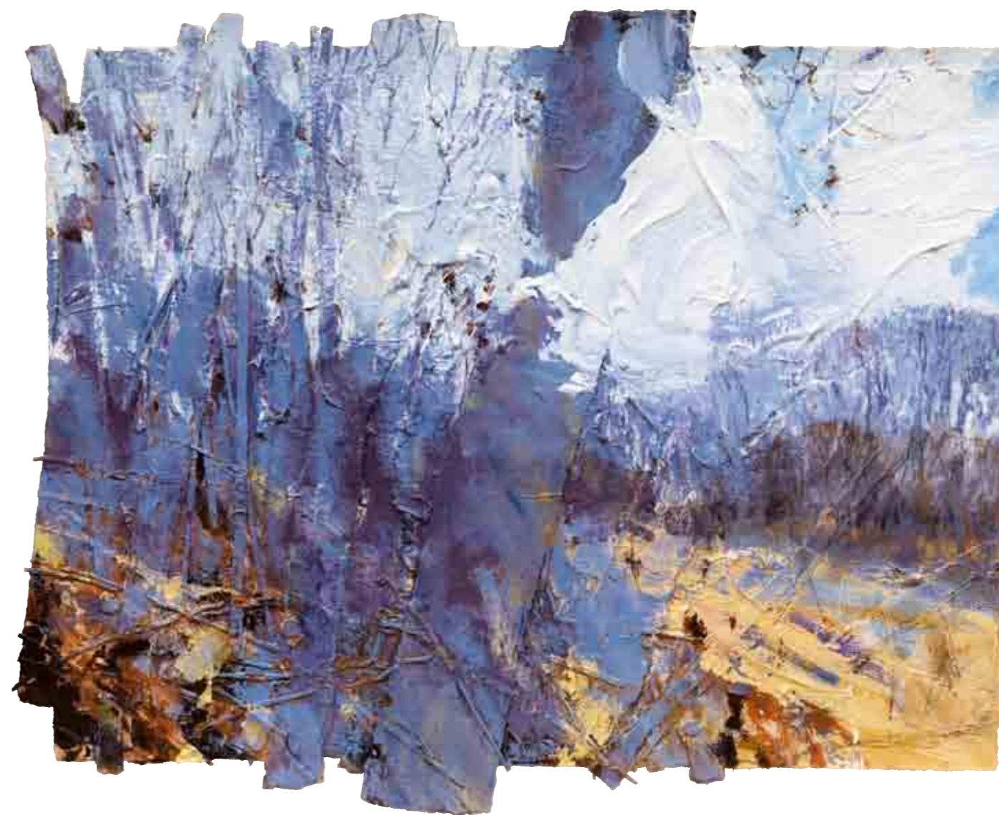
31. In November II, 2016 mixed media on paper 72 x 87 cms 28⅞ x 34¼ ins