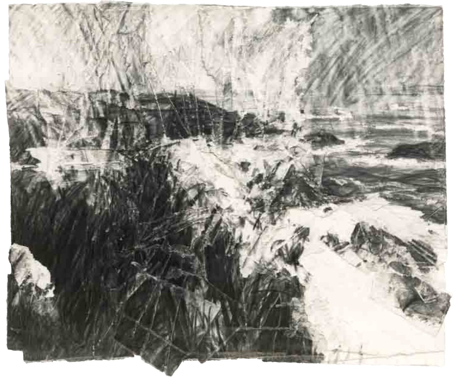
39. Light, Caerfai II, 2016 graphite on paper 66 x 79 cms 26 x 31 \frac{1}{8} ins