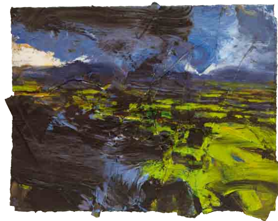
29. Yes, This Is The Land (Far Preseli) II, 2016 mixed media on paper 30 x 42 cms 11¾ x 16½ ins