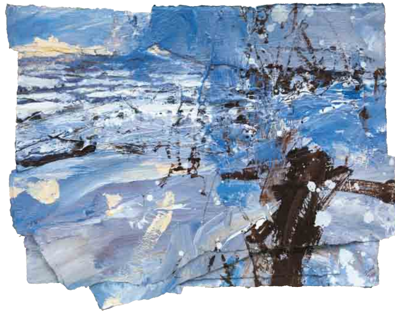
23. Darkening Snow Day II, 2016 mixed media on paper 38 x 48 cms 15 x 18¾ ins