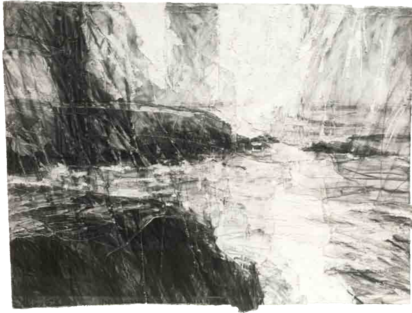
38. Light, Caerfai I, 2016 graphite on paper 60 x 79 cms 23 \frac{3}{8} x 31 \frac{1}{8} ins