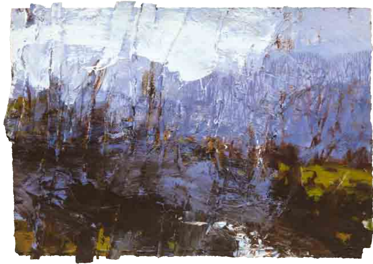
40. Valley Stream (December), 2016 mixed media on paper 41 x 58 cms 16 \frac{1}{8} x 22 \frac{7}{8} ins