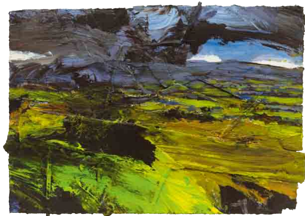
28. Yes, This Is The Land (Far Preseli) I, 2016 mixed media on paper 30 x 42 cms 11¾ x 16½ ins