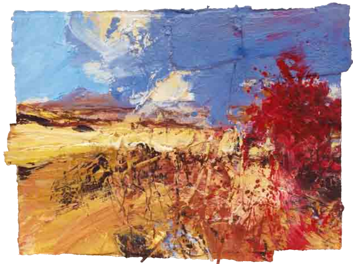
32. Red Thorn (Light and Carn Llidi), 2016 mixed media on paper 31 x 41 cms 12¼ x 16½ ins