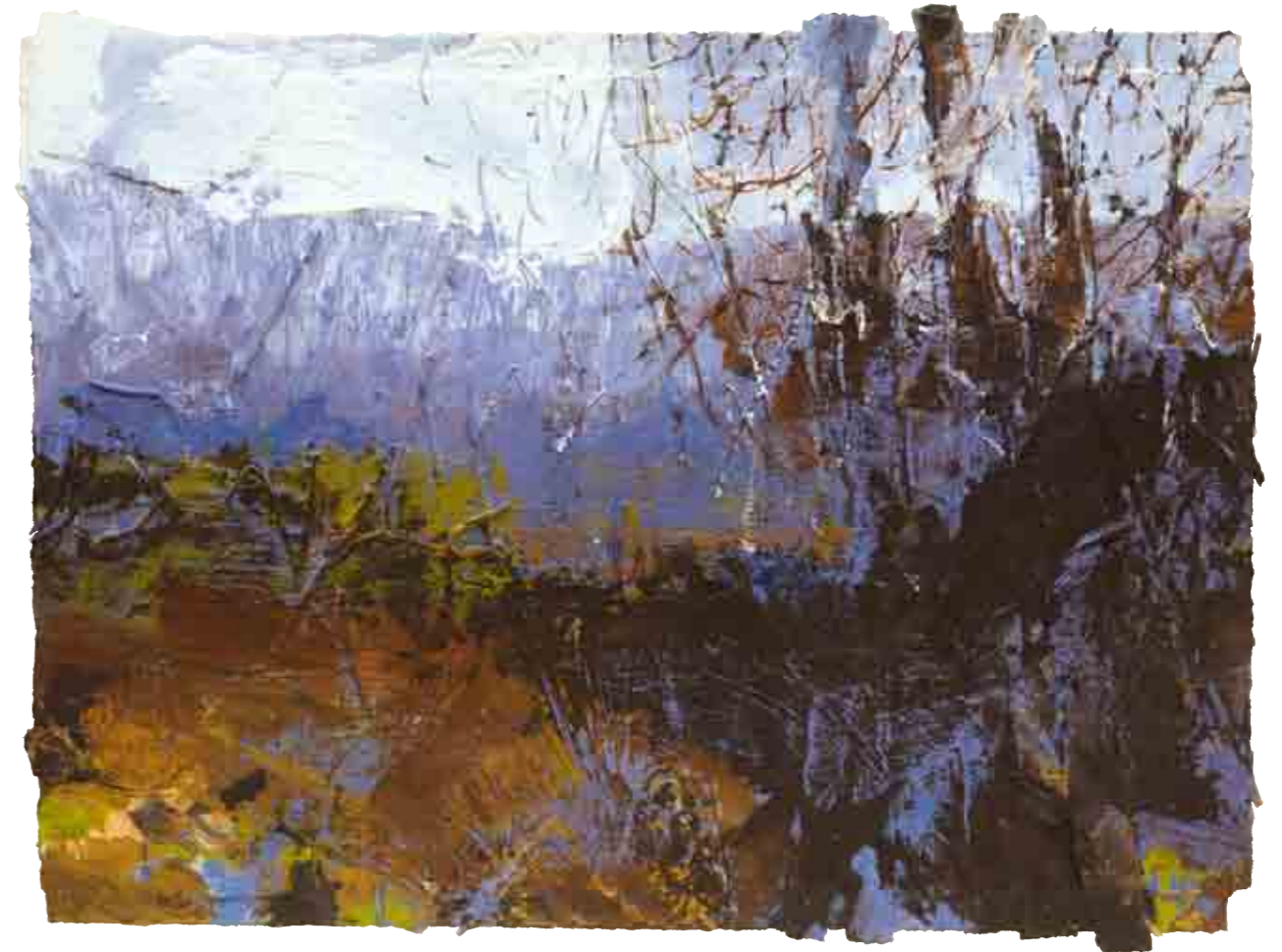
43. The Valley, December (Damp, Still), 2016 mixed media on paper 44 x 58 cms 17 \frac{3}{8} x 22 \frac{7}{8} ins