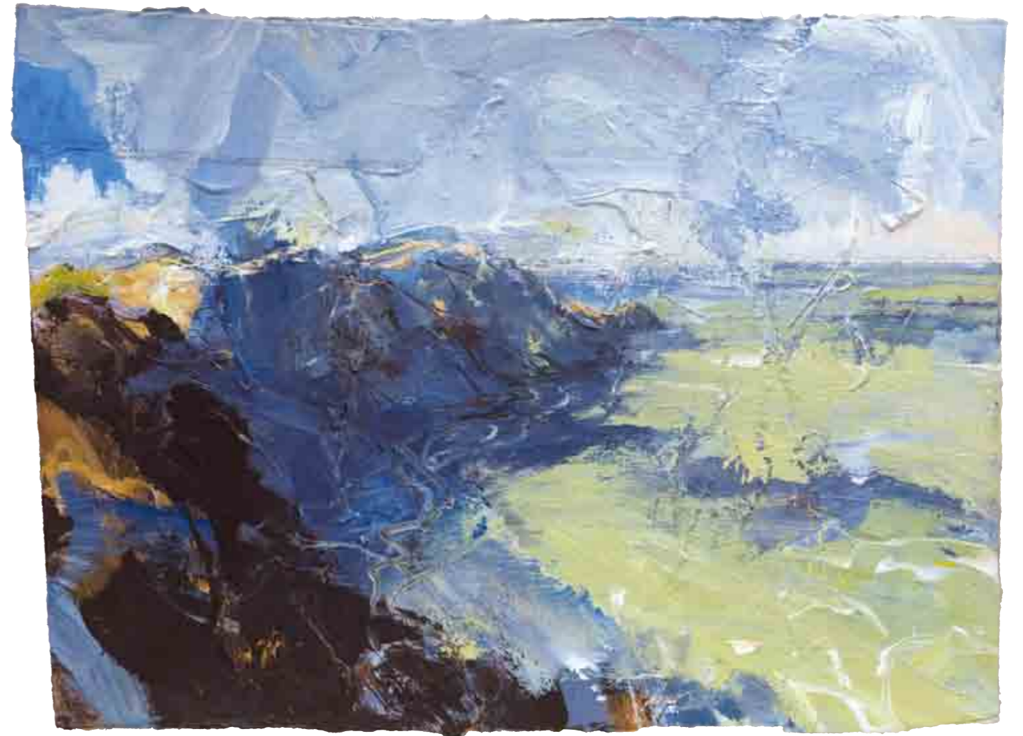
35. Landfall (St. Gwyndaf), 2016 mixed media on paper 61 x 81 cms 24 x 31 \frac{1}{8} ins