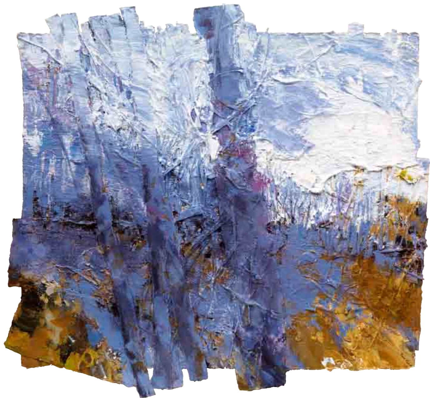
30. In November I, 2016 mixed media on paper 75 x 81 cms 29½ x 31⅞ ins