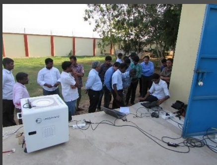
Demonstration and observation of the first results