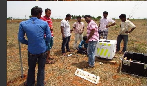
Commissioning of the WindCube