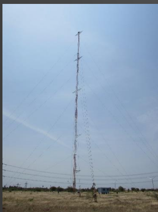
View of the 120m Met Mast

Offshore deployment zone in Gujarat : Source: FOWIND Pre-feasibility Reports