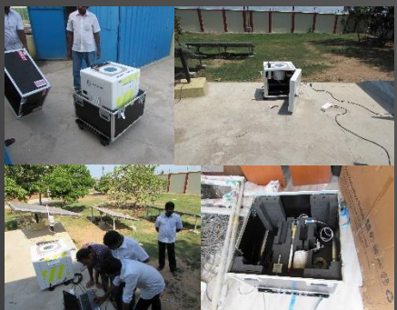
Installation and configuration of the WindCube