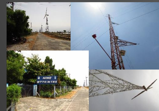
NIWE's Kayathar site (WTTTS/WTRS)

The Validation Period: The WindCube observed data will be compared to the measurements of a 120-meter met mast located in NIWE's test site at Kayathar in Tuticorin District, Tamil Nadu. On the 18 th of May 2016, the WindCube LiDAR commissioning was performed on-site. This validation phase will validate the WindCube accuracy through the comparison of 10-minute average wind speed and direction as well as the performance of the WindCube in terms of data availability. This first campaign also provides the opportunity to try out the WindCube set up (Power supply, remote access and control) before offshore deployment.